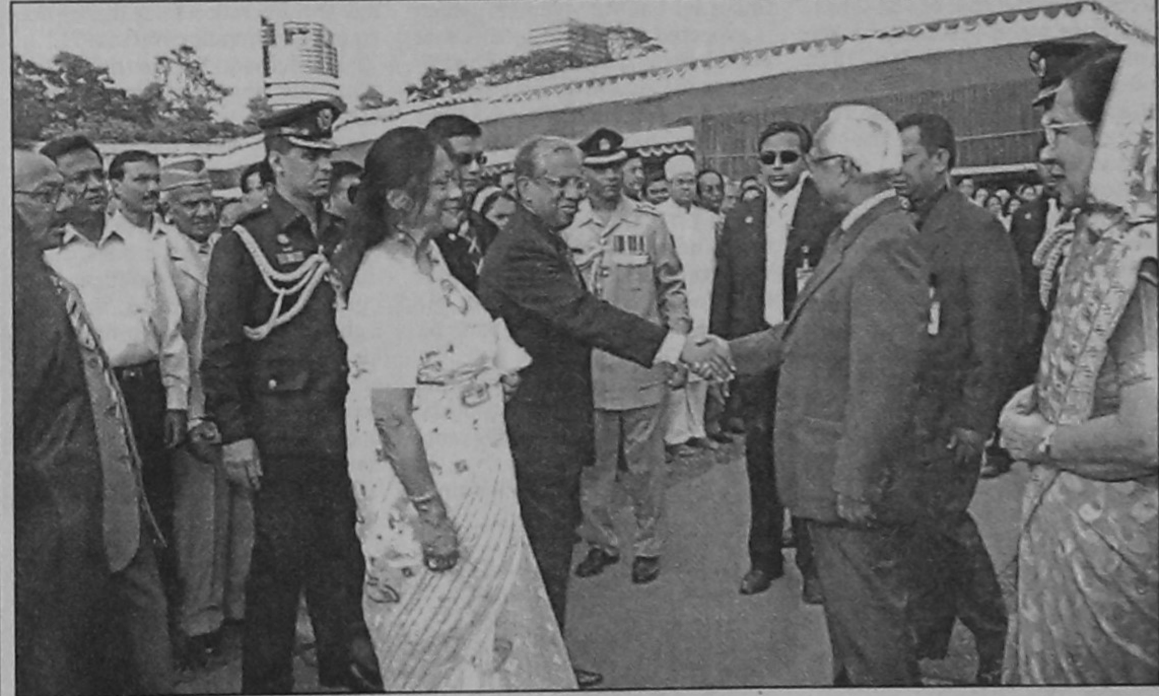
President Iajuddin Ahmed exchanges greetings with Chief Adviser Fakhruddin Ahmed at a reception hosted by the president at Bangabhaban yesterday on the occasion of the Independence Day.

Bangladesh Chhatra League at Bangladesh University of Engineering and Technology (Buet) in a separate programme yesterday also demanded formation of special tribunal to try the war criminals.