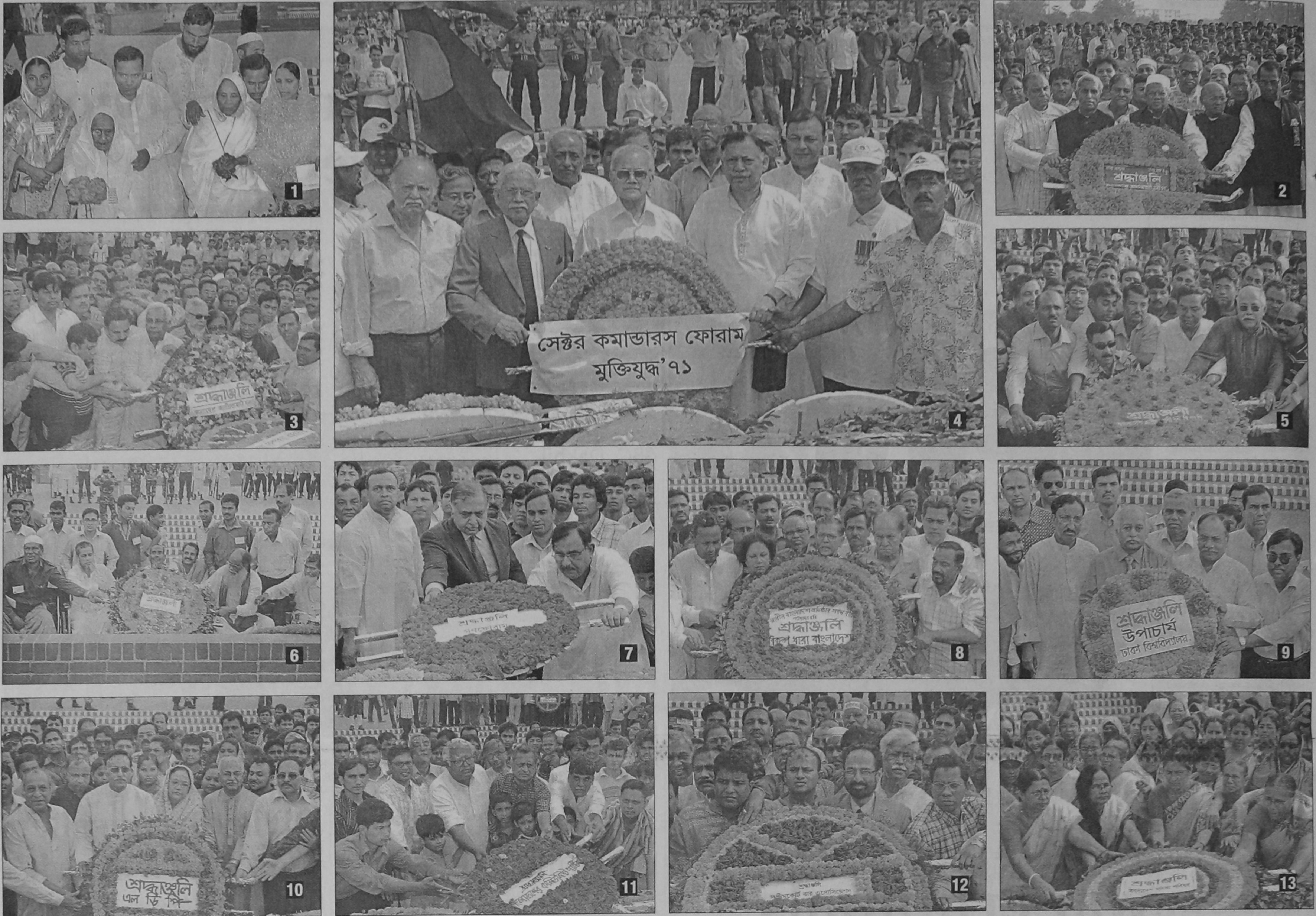
Political and socio-cultural organisations and individuals place wreaths at the National Memorial at Savar yesterday to pay homage to the martyrs of the War of Liberation on the occasion of Independence Day. 1) Family members of Bir Sreshthas; 2) Awami League; 3) Leaders of a faction of BNP; 4) Sector Commanders Forum; 5) Leaders of another faction of BNP; 6) War-maimed freedom fighters; 7) Gono Forum; 8) Bikalpa Dhara Bangladesh; 9) Vice chancellor of Dhaka University; 10) Liberal Democratic Party; 11) Communist Party of Bangladesh; 12) Supreme Court Bar Association and 13) Bangladesh Mahila Parishad.