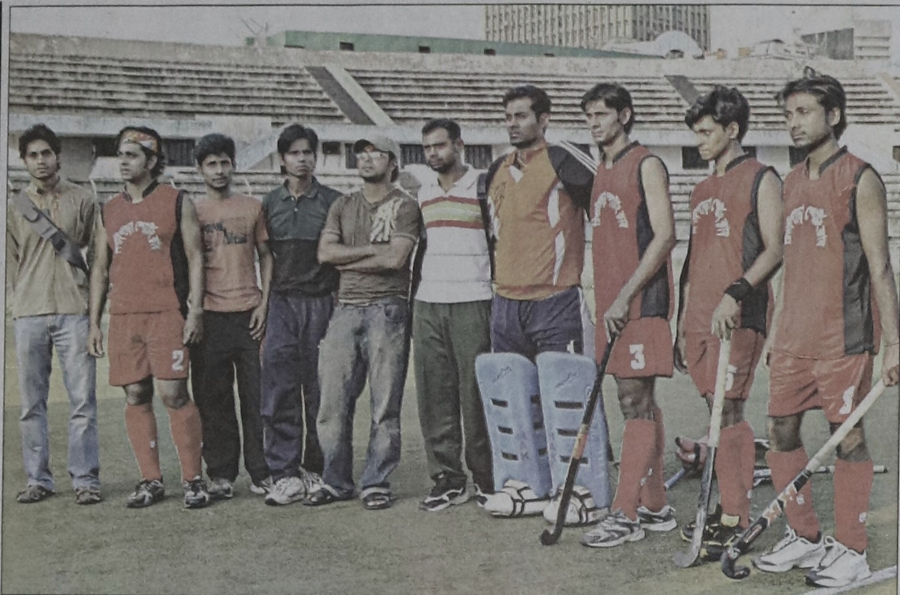
WHAT HAVE WE DONE TO DESERVE THIS? The ten hockey players, who resigned from the national team after failing to find any team for the coming season, show their frustration yesterday at the Maulana Bhasani National Hockey Stadium.

May 2-5: 2nd 4-dayer against Pakistan Academy in Bogra