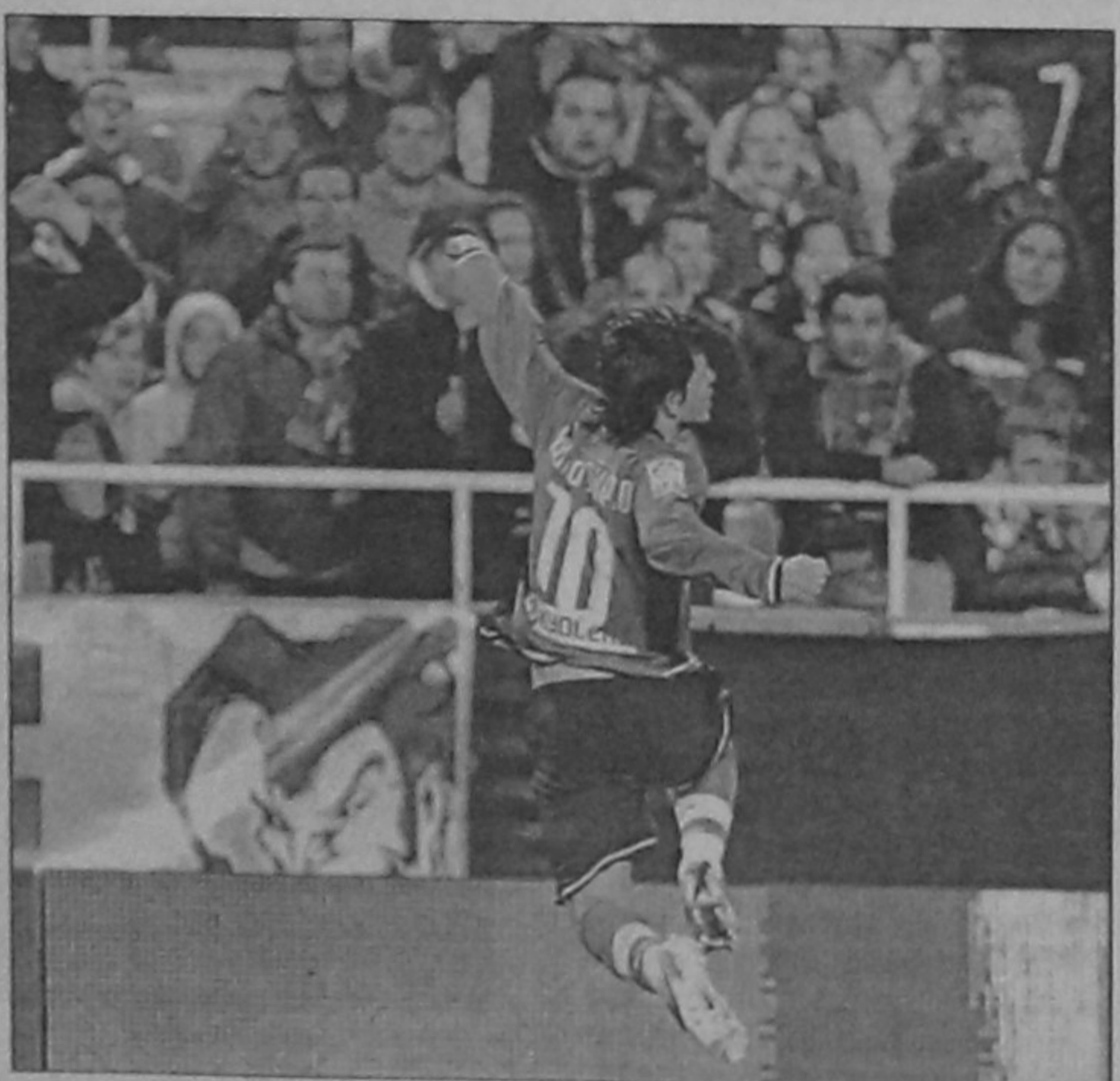
Atletico Madrid star Kun Aguero is ecstatic after scoring against Sevilla during their Primera Liga tie at the Sanchez Pizjuan Stadium on Saturday.

But the hosts levelled shortly after the interval with Diego Capel following up after Frederic Kanoute's initial shot was well-saved.