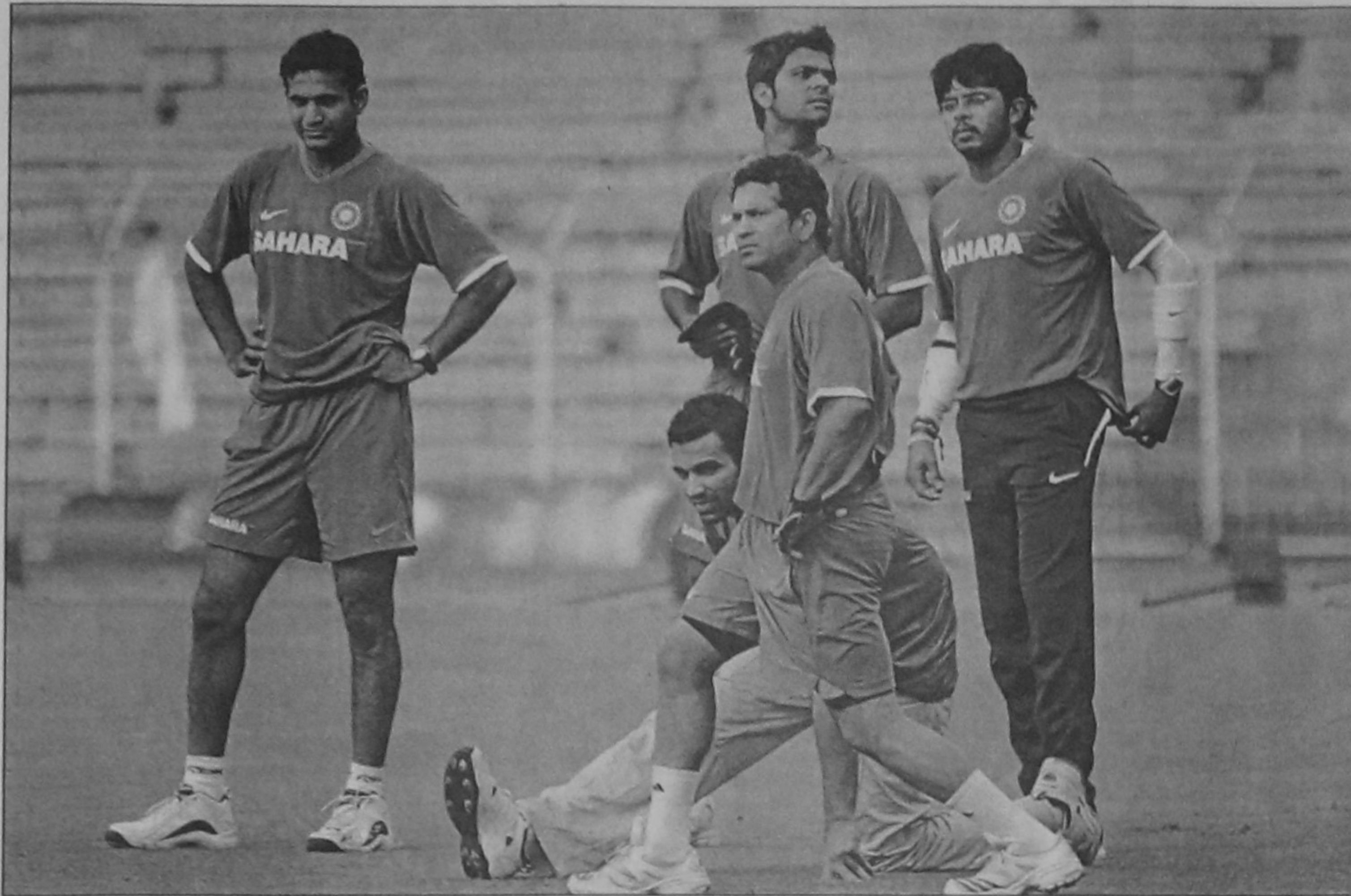
Indian superstar Sachin Tendulkar (C) stretches as he takes part in a training session along with his teammates at the MAC stadium in Chennai yesterday.