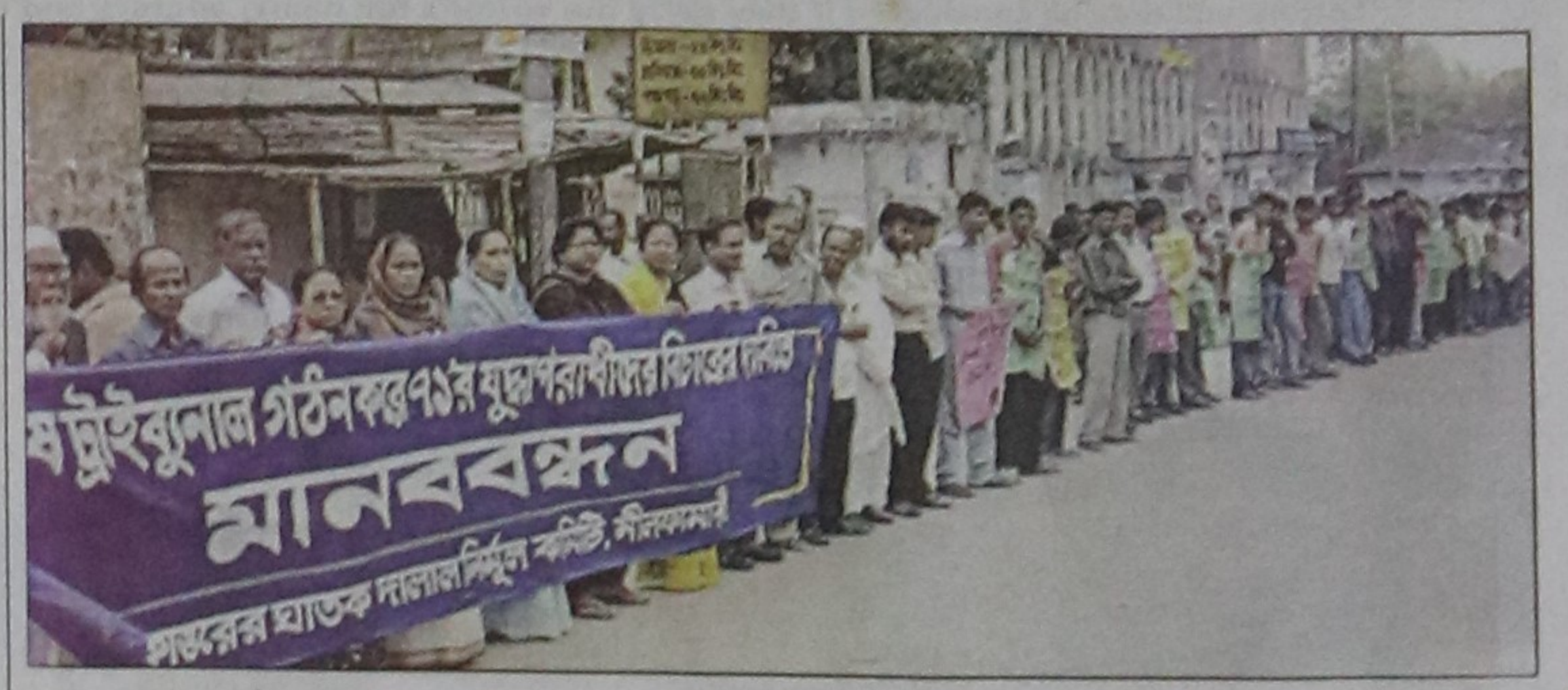
Ekkatarer Ghatak Dalai Nirmul Committee forms a human chain at Nilphamari town yesterday demanding trial of war criminals.