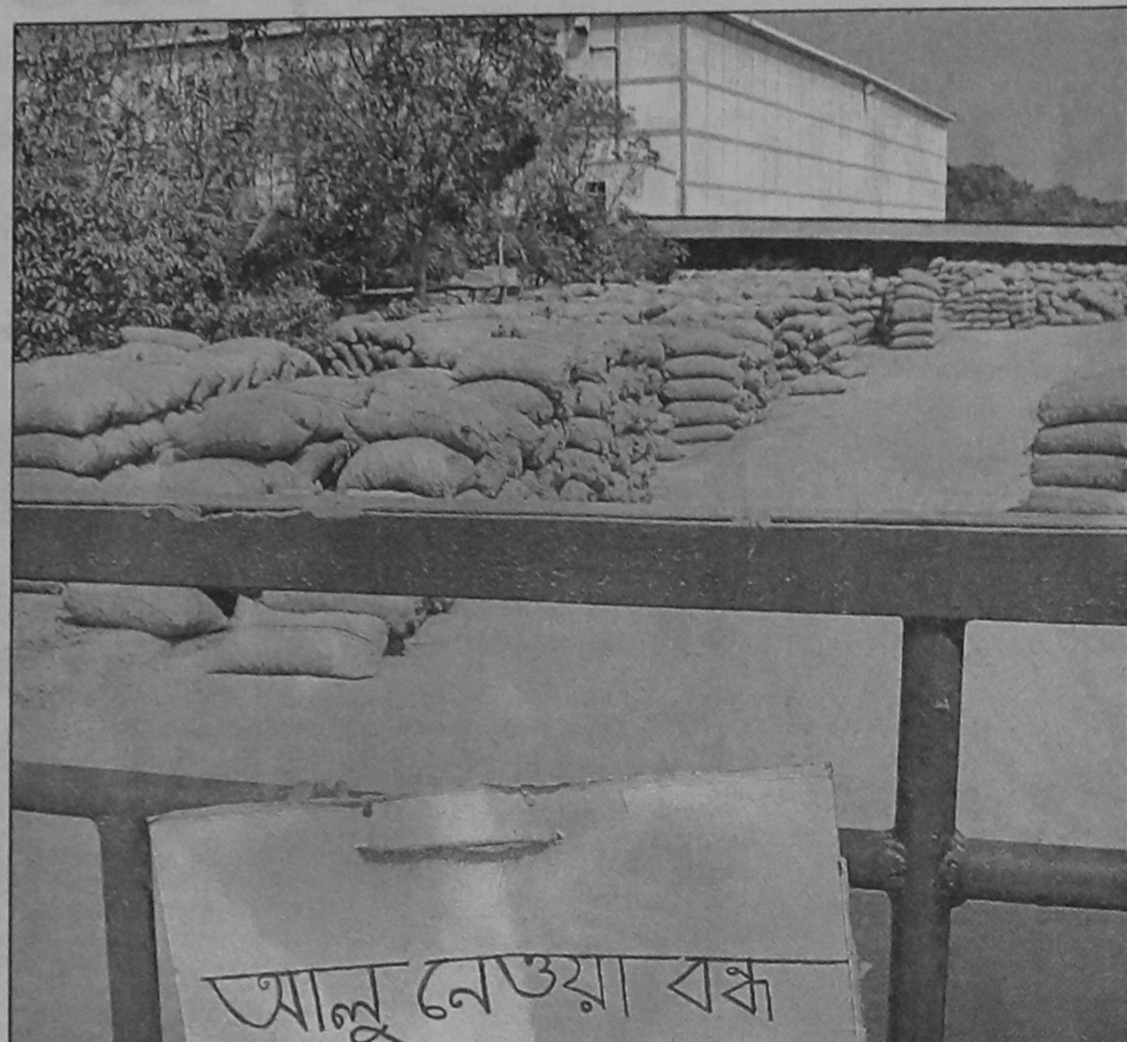
Potato sacks are stockpiled on the premises of Rahman Cold Storage at Nawhata in Rajshahi as authorities put up a sign saying they have stopped receiving potatoes for storage.

Cold storage owners are not taking new booking now, compelling growers either to sell