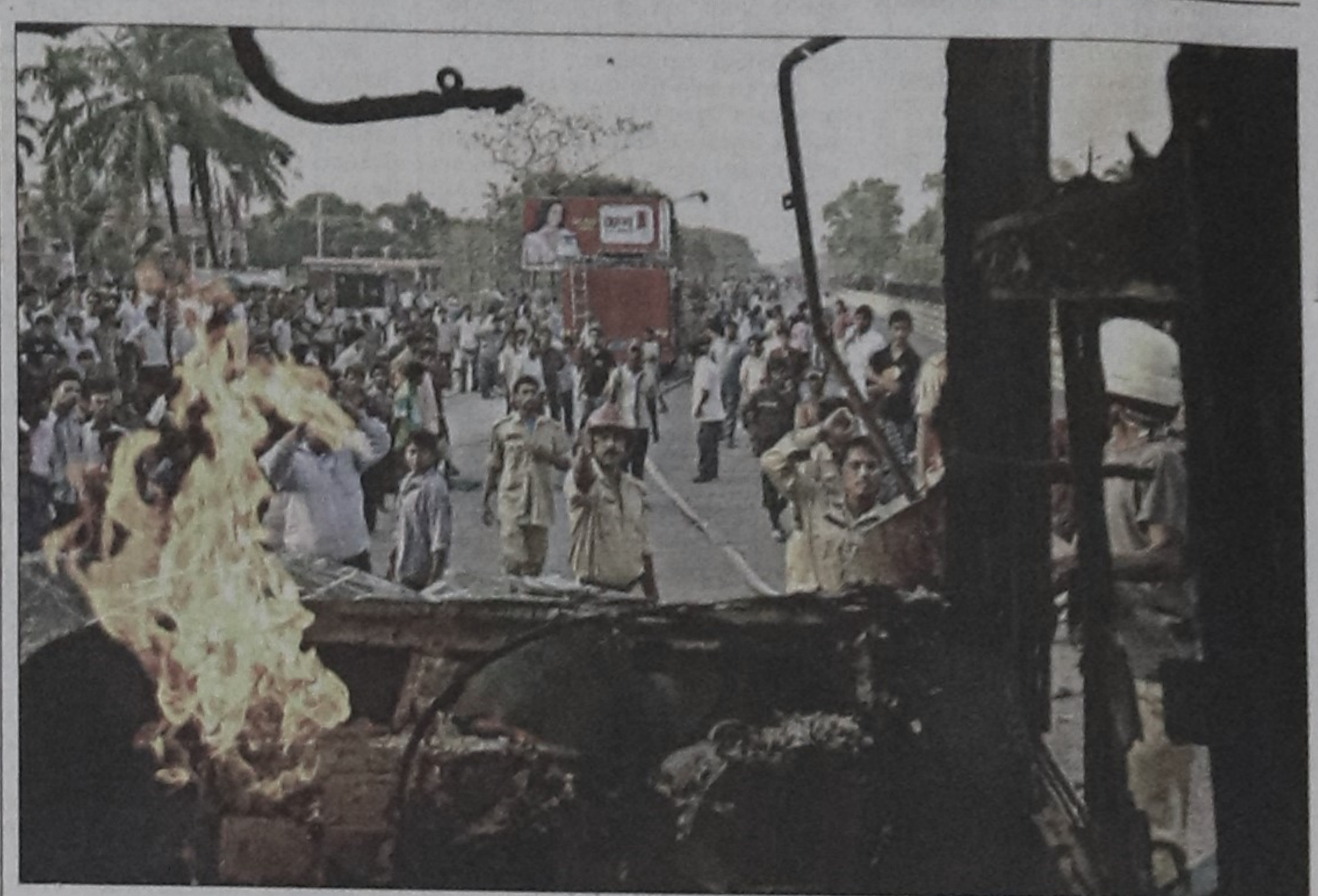
Firefighters try to douse flames on a bus at Dairy Farm gate of Jahangirnagar University yesterday. Students set fire to the vehicle protesting assault on their fellows at Gabtoli in the capital.