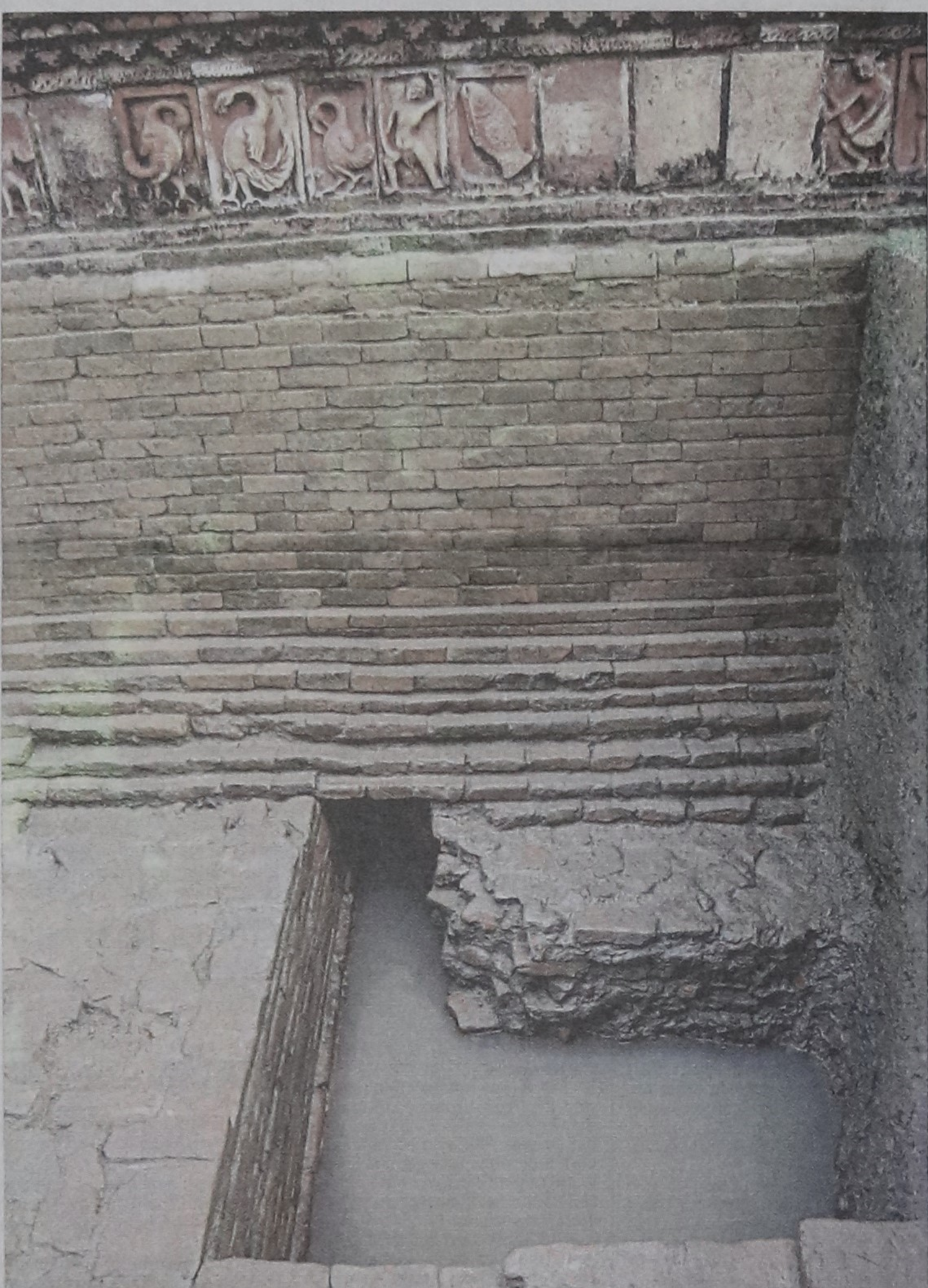
Part of a brick structure believed to have been built in pre-Pala era at Paharpur. The archaeologists digging the world heritage site found it beneath the main temple there recently.