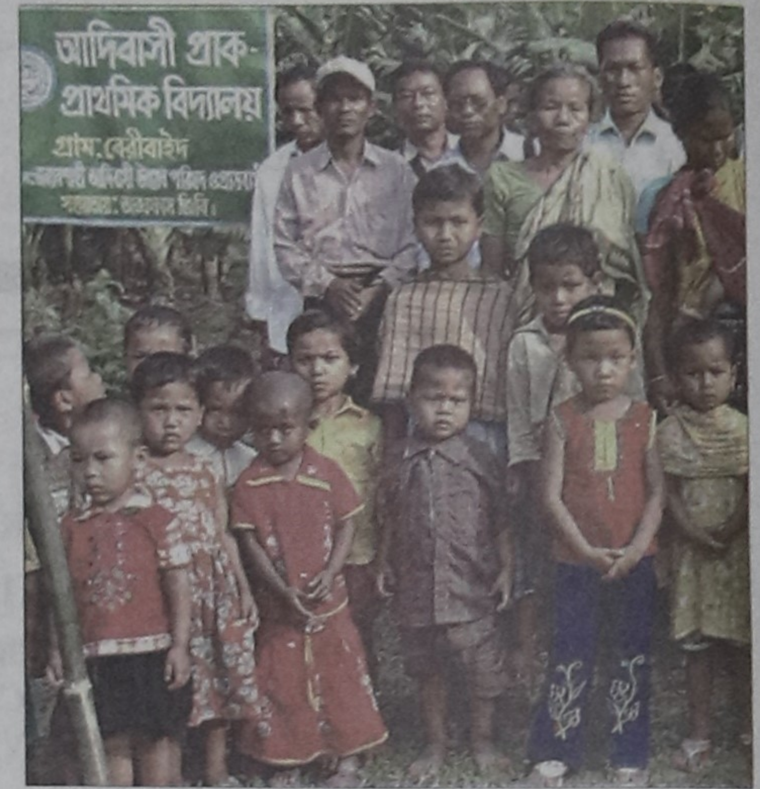
This new pre-primary school in Beribaid village, Madhupur will provide education to the local Garo children in their mother tongue