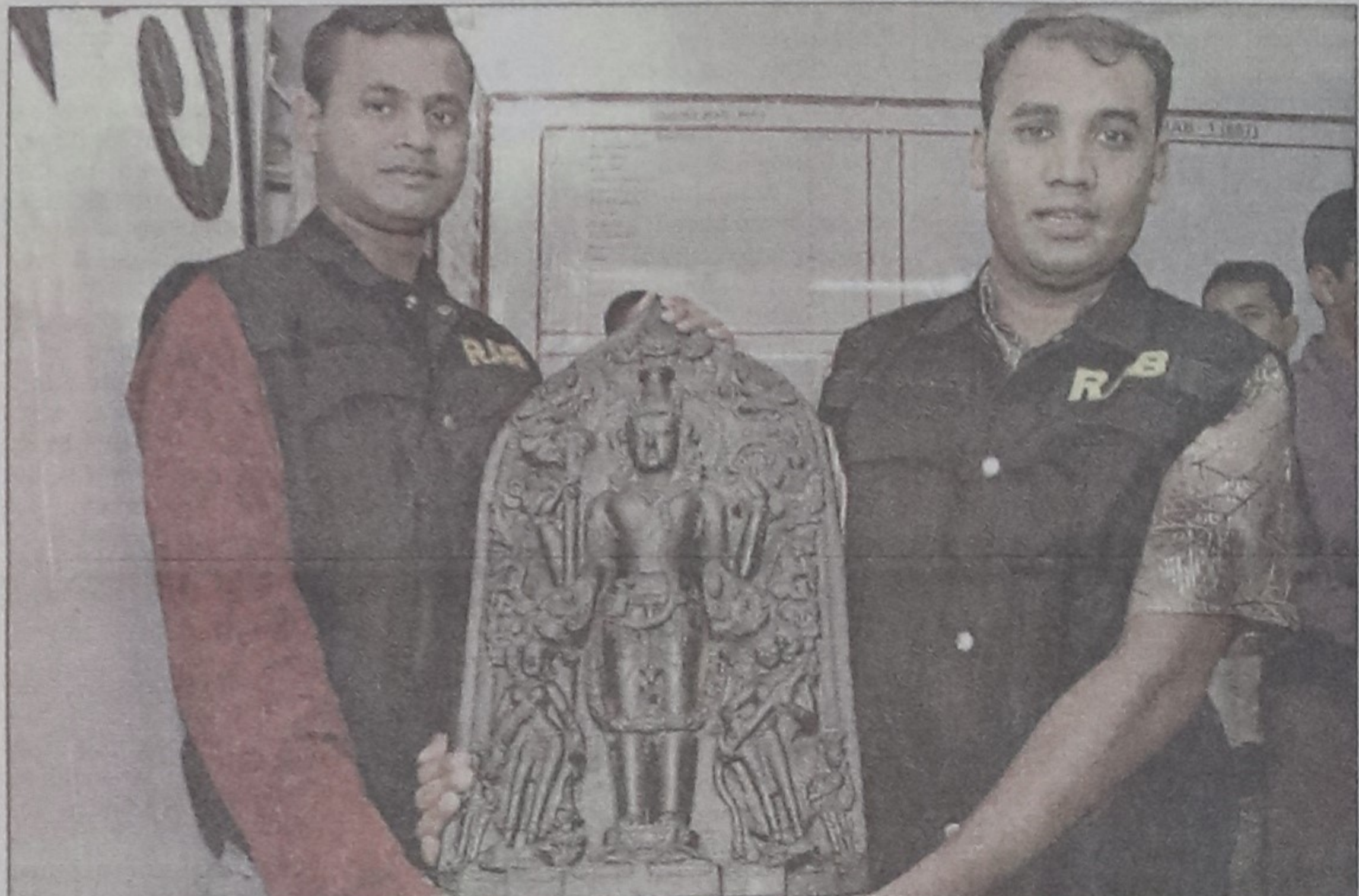
Two Rab personnel hold the 1,000-year-old artefact at the Rab-1 office in the capital yesterday. The law enforcers found the statue on the side of Road-91 in Gulshan-2 over a week ago.