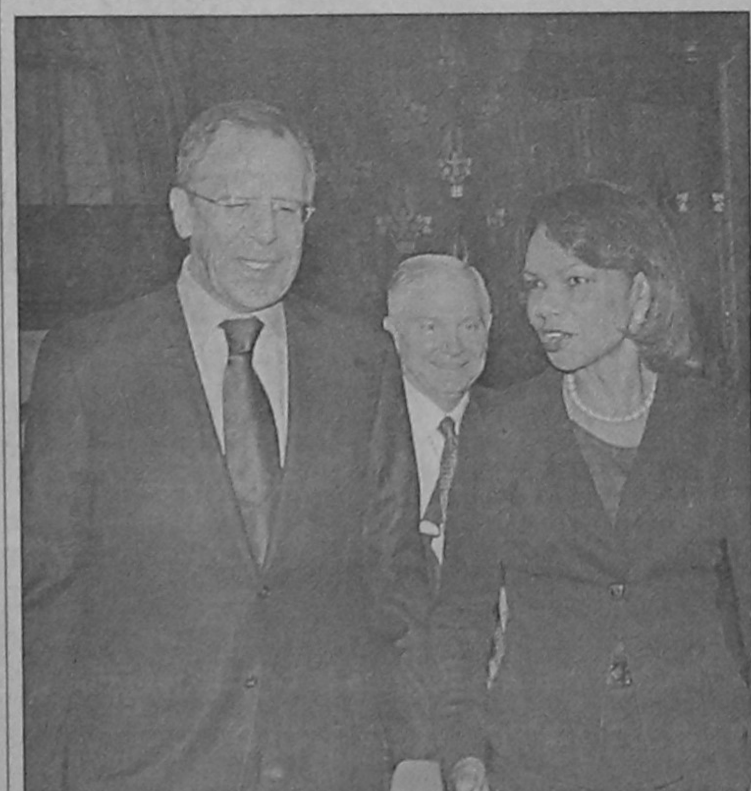
Russian Foreign minister Sergey Lavrov (L), US Defence Secretary Robert Gates (2L) and US Secretary of State Condoleezza Rice walk prior to talks at the Foreign Ministry guesthouse in Moscow yesterday.