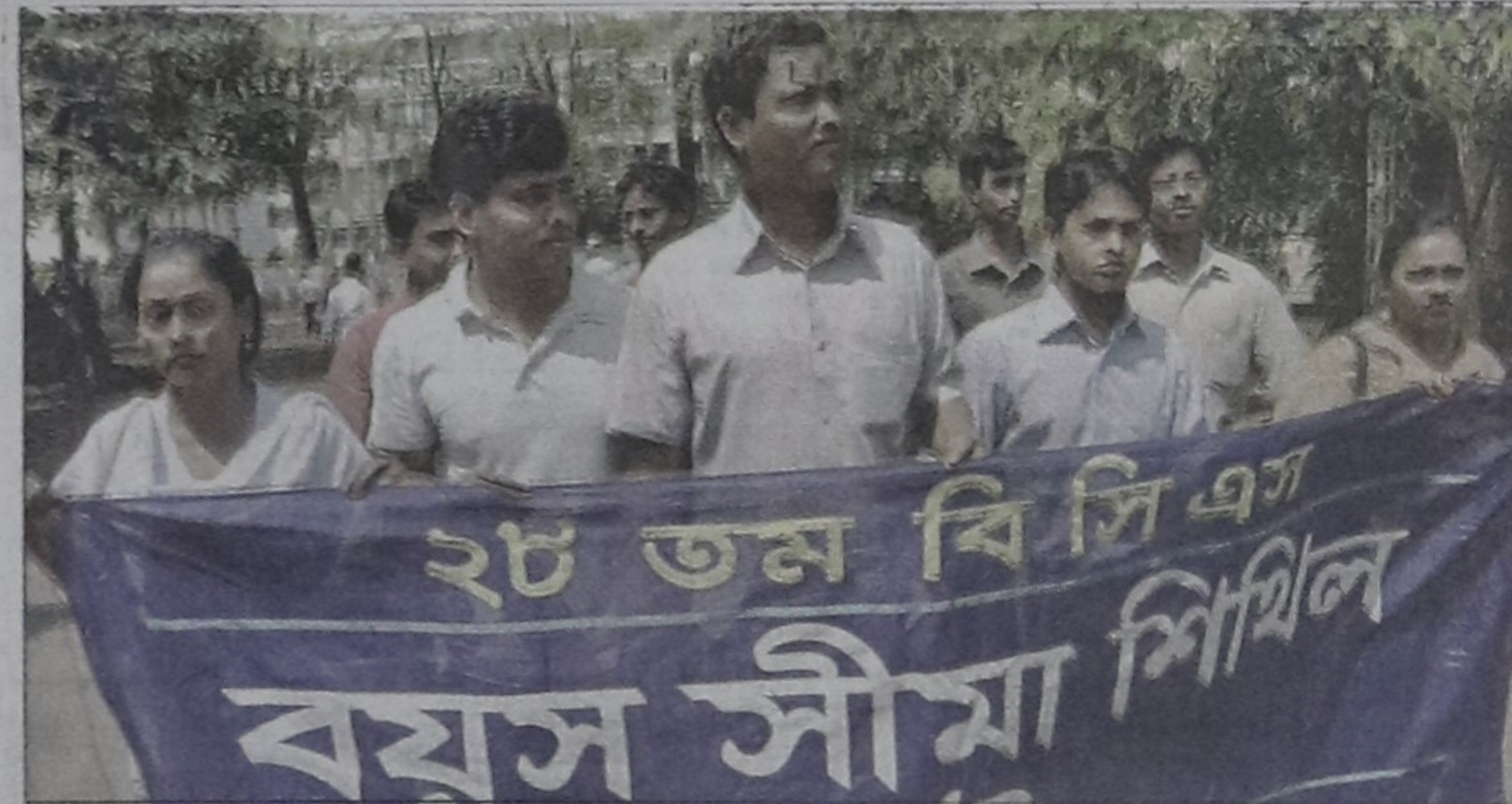
A group of job seekers take out a procession on the Dhaka University campus yesterday demanding relaxation of age limit in the 28th BCS exams by one year.

Fax + 88-02-8825941 E-mail: info@geneticlimited.com Web: www.geneticlimited.com