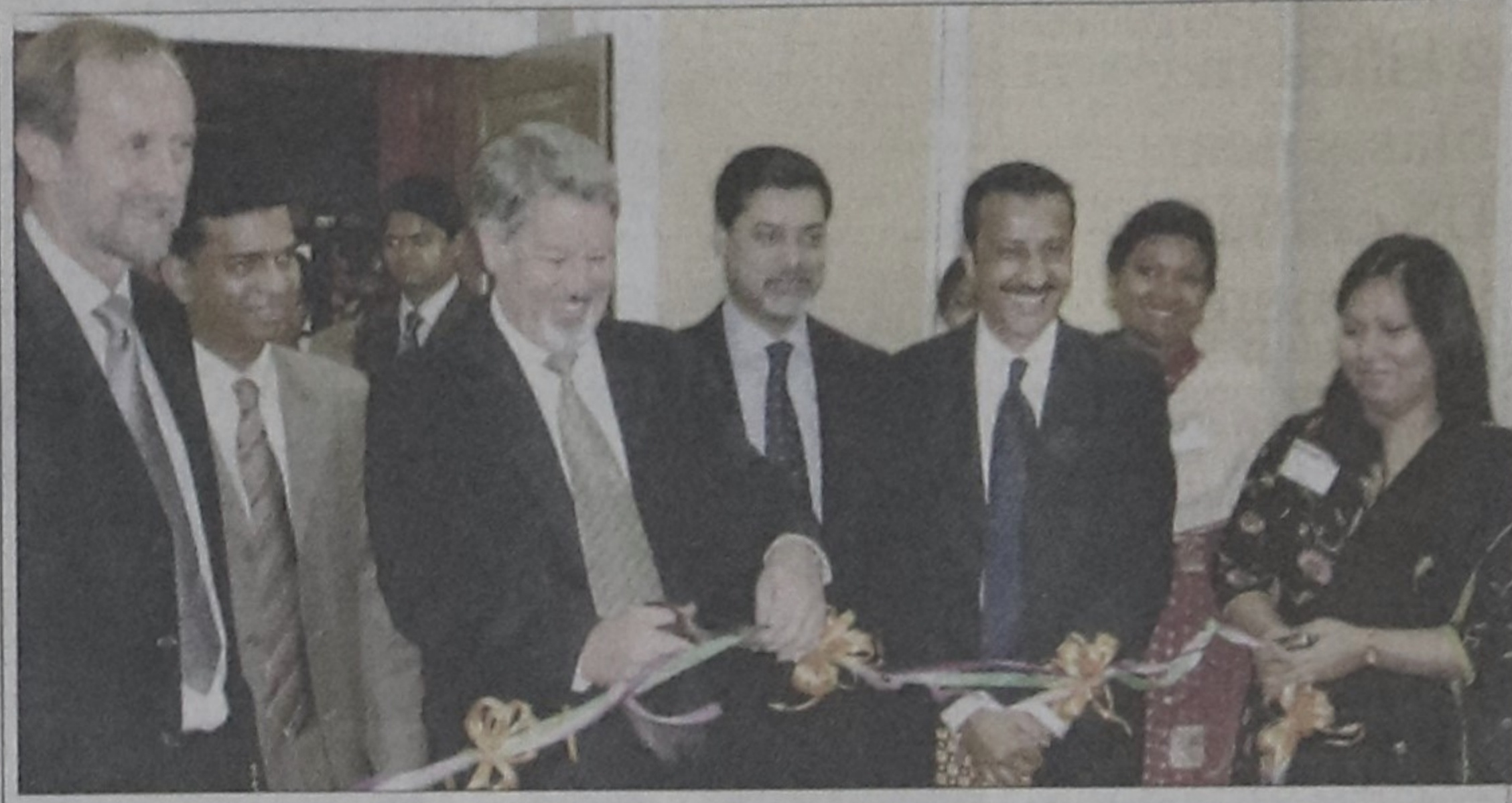
Australian High Commissioner Douglas Foskett inaugurates a two-day Australian Education Exhibition at Sheraton Hotel in the city yesterday.

Australian Trade Commission of the Australian High Commission and IDP Education jointly organised the exhibition.