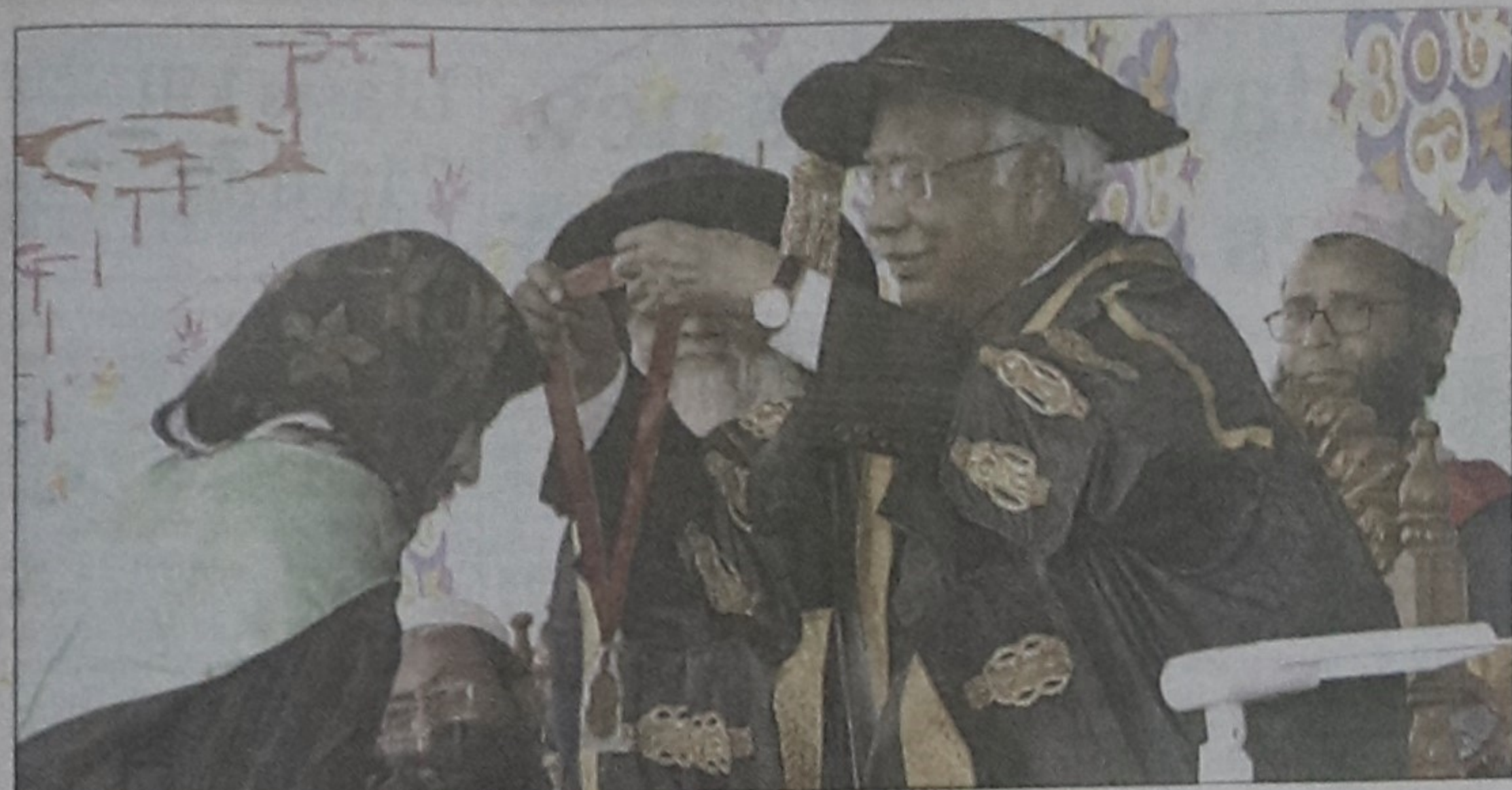
President Iajuddin Ahmed gives away a gold medal to a successful graduate at the third convocation of Rajshahi University of Engineering and Technology yesterday.