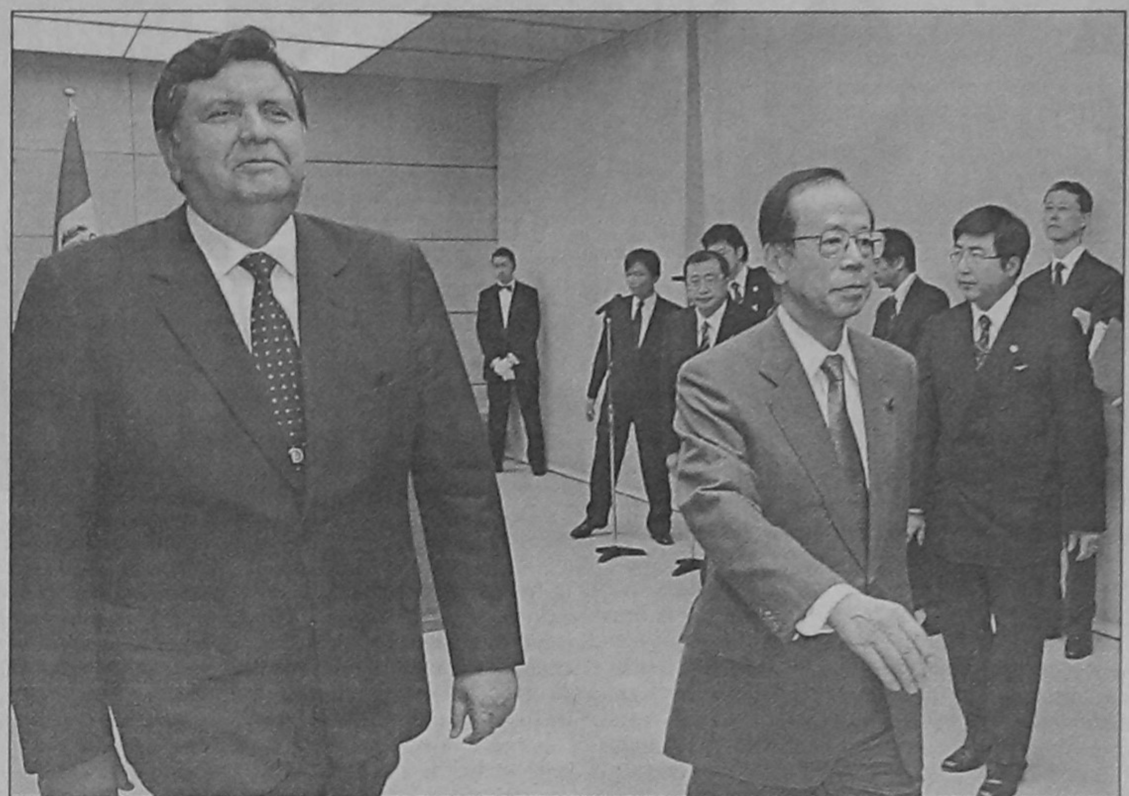
Peruvian President Alan Garcia (L) and Japanese Prime Minister Yasuo Fukuda walk out after they signed a cooperation agreement at the latter official residence, in Tokyo yesterday. Peruvian President Alan Garcia appealed for Japan to invest in his country, saying that a long cold spell in ties due to a row over former strongman Alberto Fujimori was a "serious mistake."

ISAF does not release the nationalities of its casualties but the Danish military said two of its troops were killed and one injured. The soldiers were from a Danish unit that works on reconstruction projects, it said.