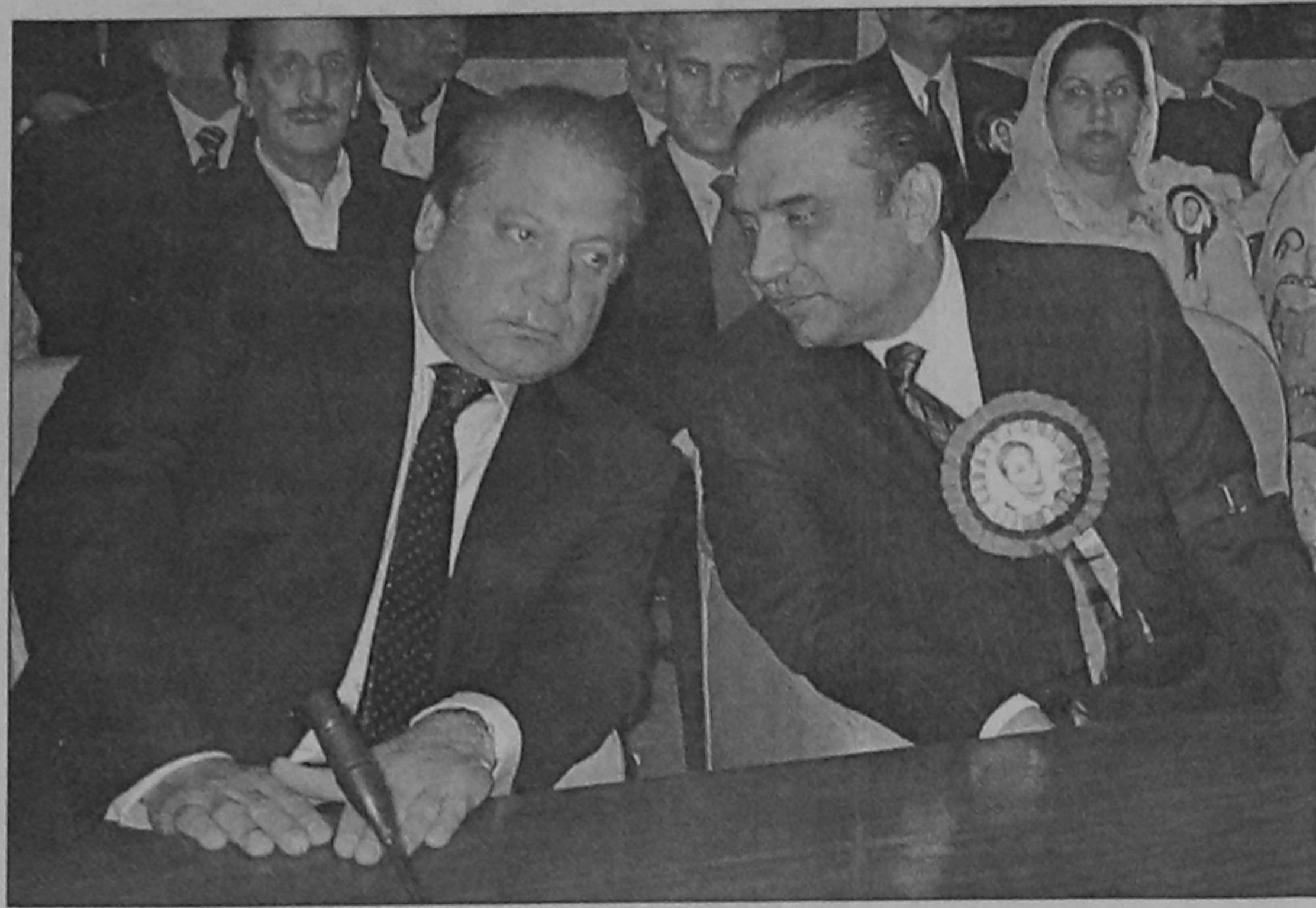
Asif Ali Zardari, (R) widower of slain former Pakistani premier Benazir Bhutto and co-chairman of Pakistan People's Party (PPP) shares a word with former premier Nawaz Sharif during their joint parliamentary meeting prior to the inauguration of the new parliament in Islamabad yesterday. Once arch foes, both of their parties have now joined hands making a tough front to face US-backed President Pervez Musharraf, and vowing to end his "dictatorship".

Officials said last week that a new outbreak of bird flu had also hit another province in the south of the country, killing hundreds of ducks on a poultry farm.