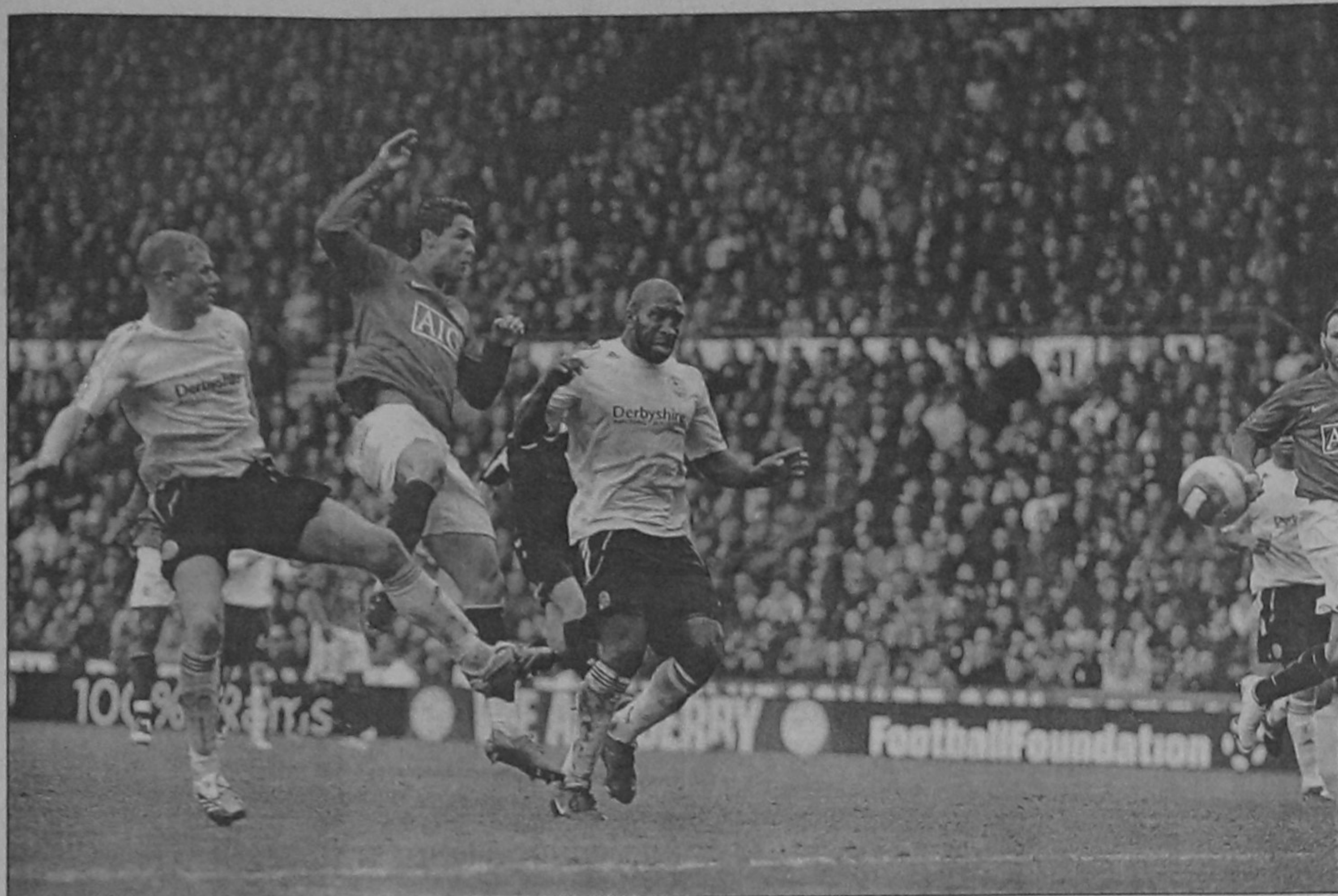
Manchester United star Cristiano Ronaldo (C) goes airborne to score the all-important goal against Derby County during their Premiership encounter at Pride Park on Saturday.