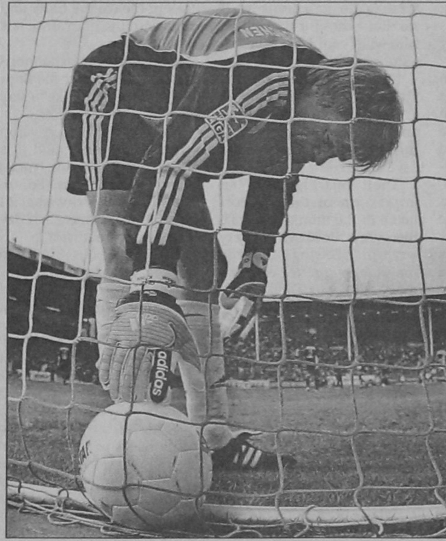
Bayern Munich goalkeeper Oliver Kahn picks up the ball after conceding a goal during their Bundesliga match against Energie Cottbus at the Friendship Stadium on Saturday.

Germany defender Heiko Westermann hitting the winner on 74 minutes and the defeat means Duisburg are now bottom of the table.