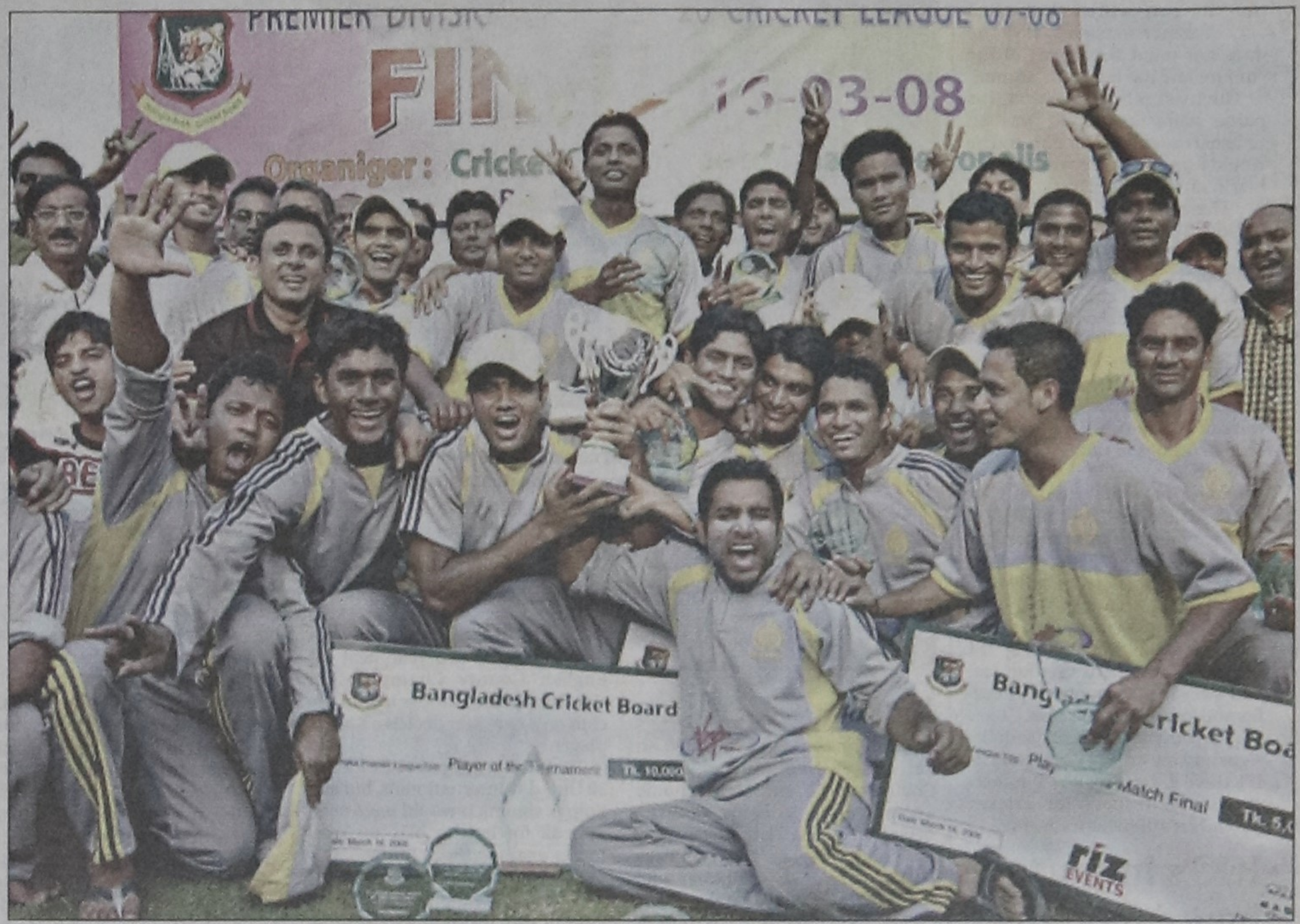
SMILES AFTER AN EASY RIDE: Abahani players celebrate their Premier League Twenty20 triumph at the Sher-e-Bangla National Stadium yesterday.