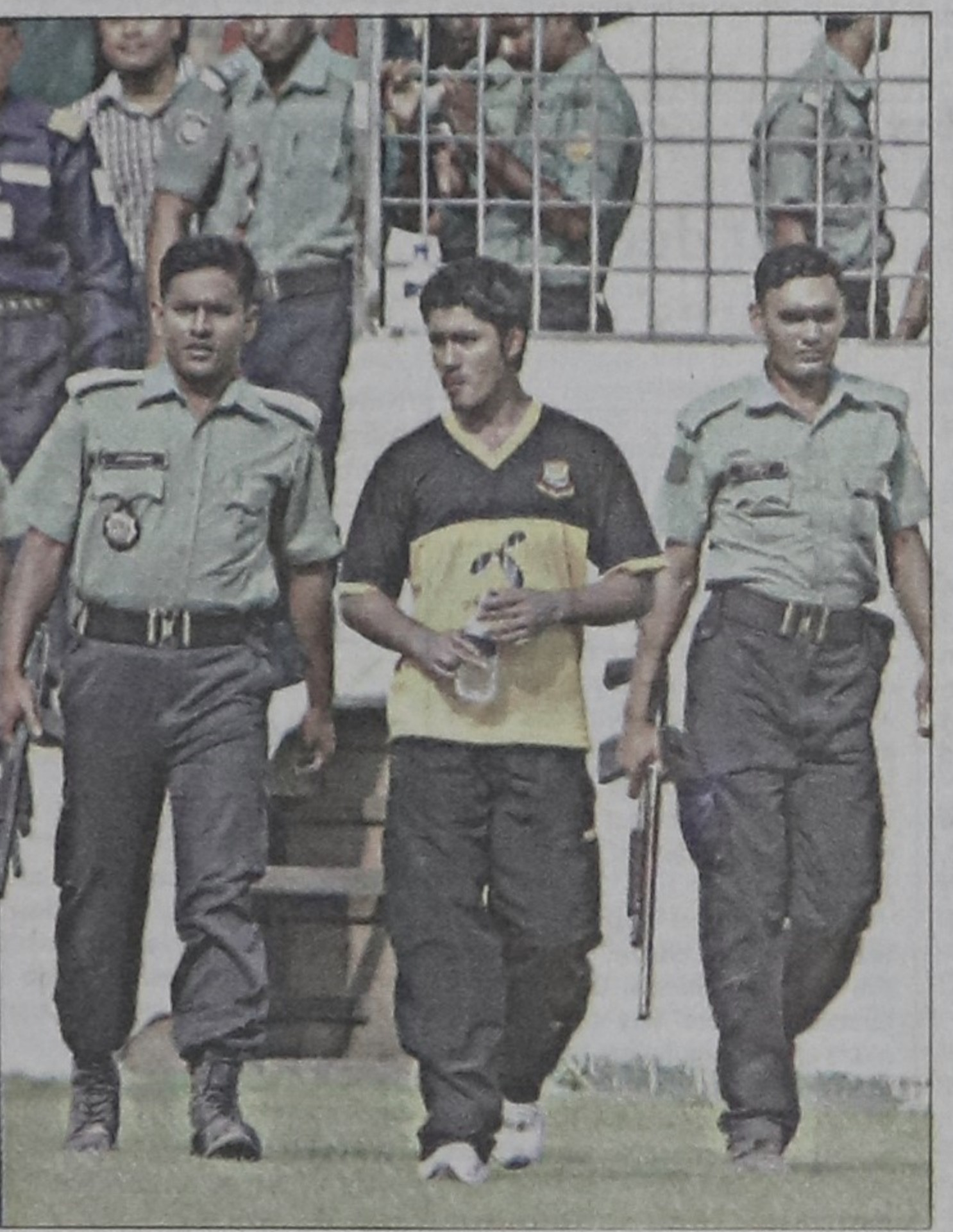
PHOTO: STAR THAT WATER SHOULD BE COLD: Bangladesh captain Mohammad Ashraful walks into the Sher-e-Bangla National Stadium from the indoors under police protection, half-an-hour after he was involved in a fracas with a fan yesterday.

Besides his latest act supported the growing concern that the little right-hander is just not strong enough to tackle the intricacies of a post that requires a cool head.