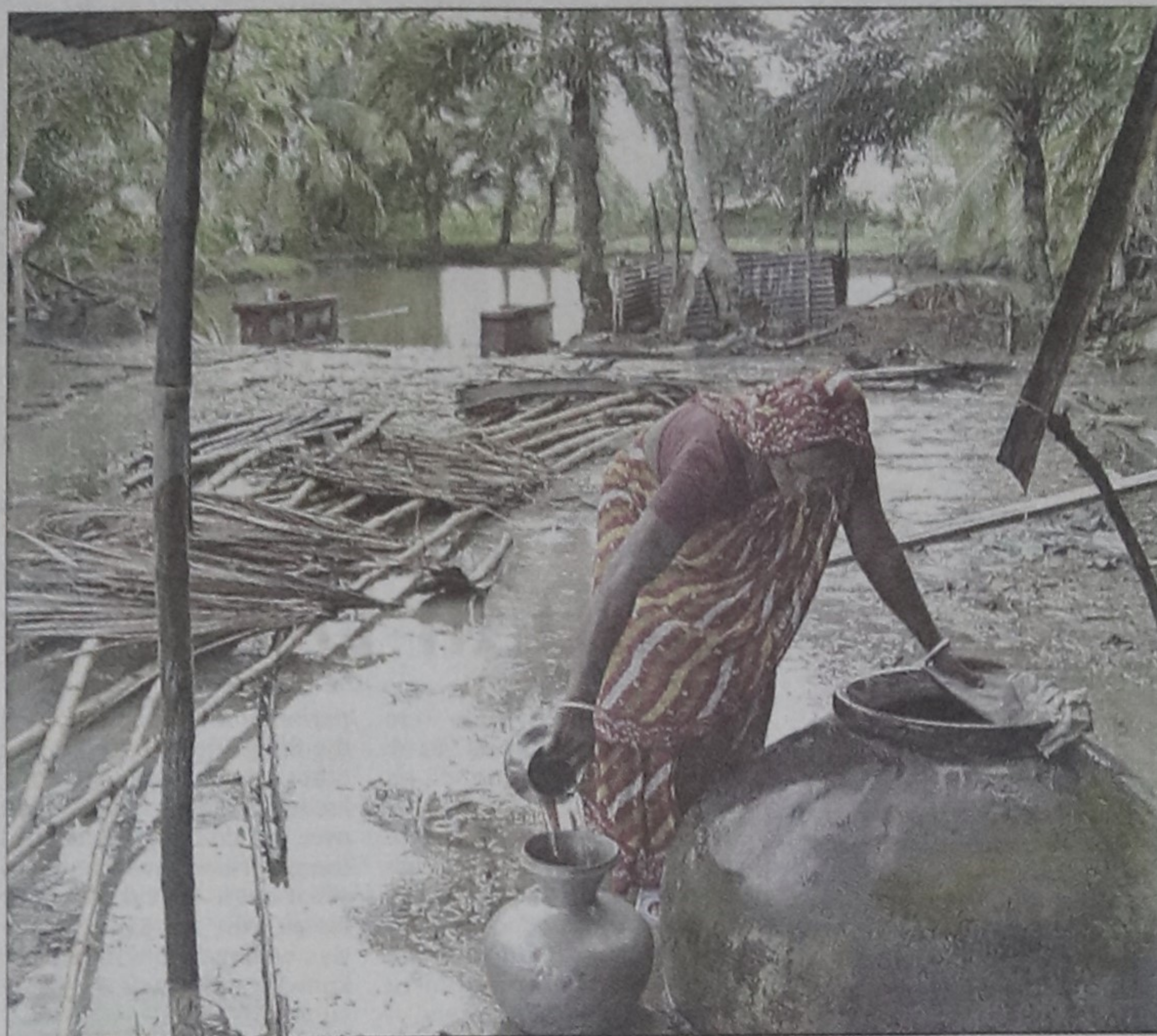
A woman taking rainwater stored in a large jar in Dakop upazila in Khulna where crisis of drinking water is acute.

In the coastal belts of Khulna district, most of the ponds having water worth drinking have been grabbed by shrimp cultivators and it has led to acute crisis of pure drinking water, said the report of Media Cell. Sand filters set up to purify water from salinity are also lying inactive, it added.