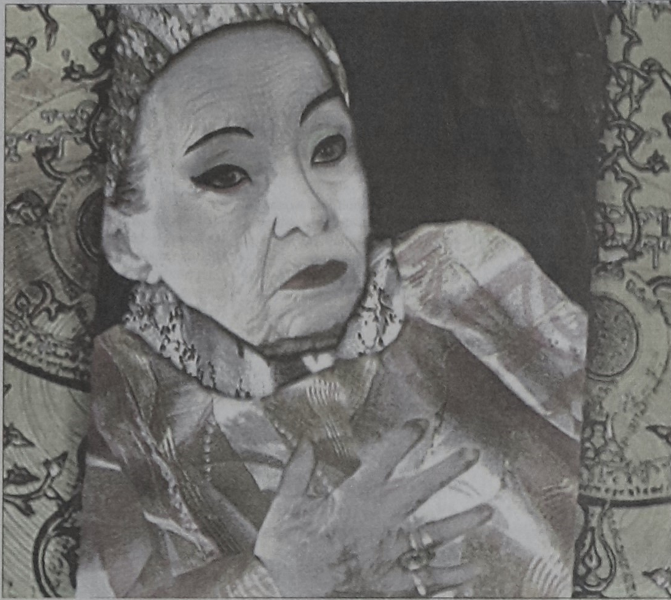
A photograph by Pascal Monteil

Monteil changed the position of the characters in the picture and added items like a dog and some red flowers.