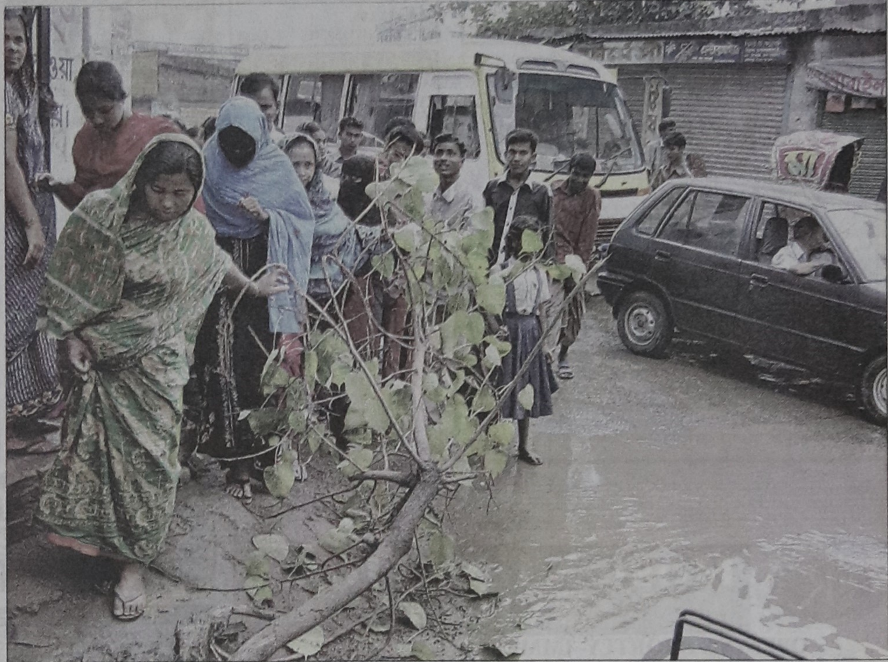
The Basila Road at Mohammadpur in the city is a pain in the neck for the locals and commuters, as the road remains waterlogged all the year round because of sewerage water and downpours. The picture was taken yesterday.