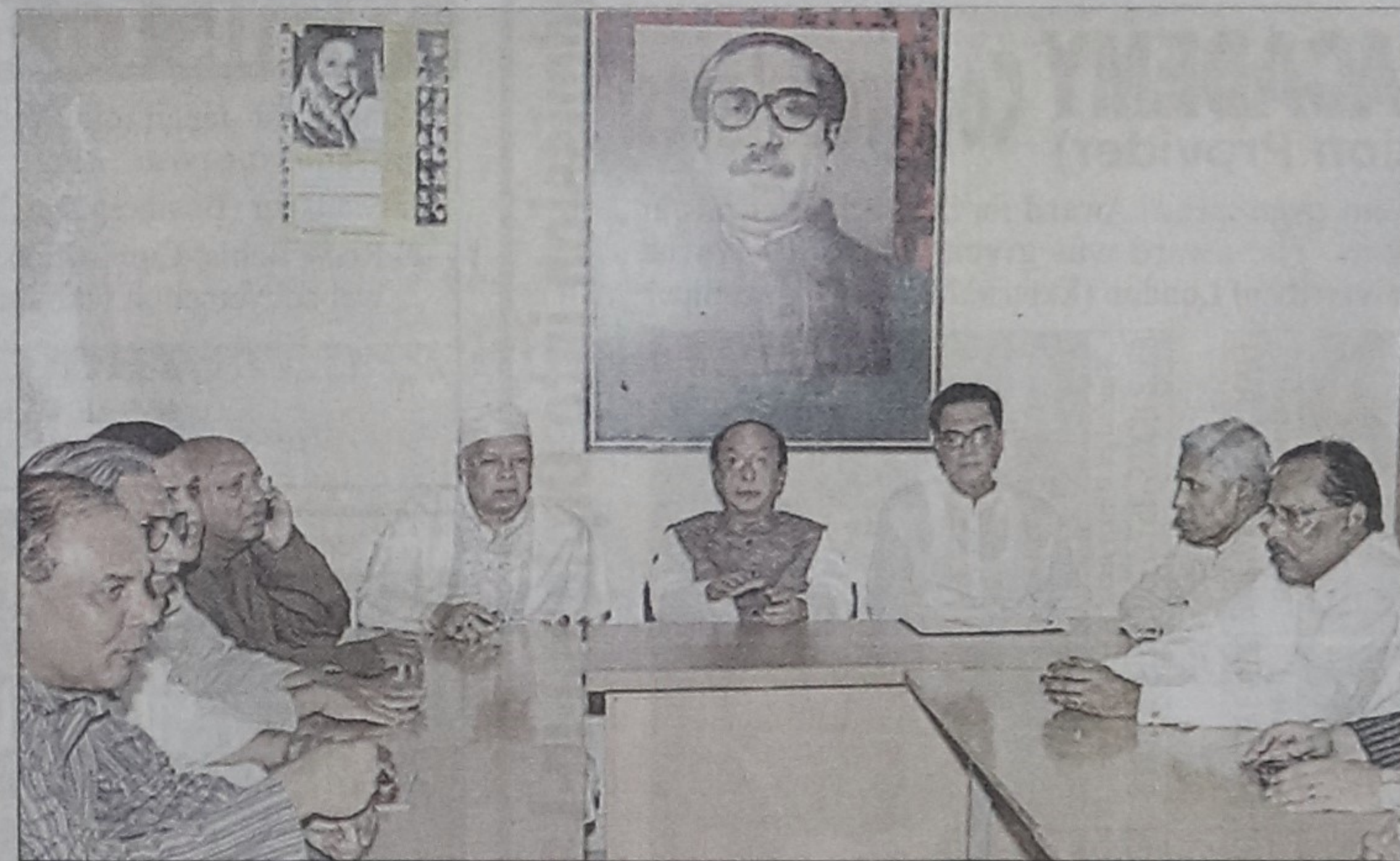
A joint meeting of Awami League presidium members and organising secretaries was held at the party chief Sheikh Hasina's political office at Dhanmondi in the city with acting president Zillur Rahman in the chair.

"We sent the injured workers to Chittagong Medical College Hospital (CMCH) for medication and activities of the factory were resumed at around 12:00noon," he said.