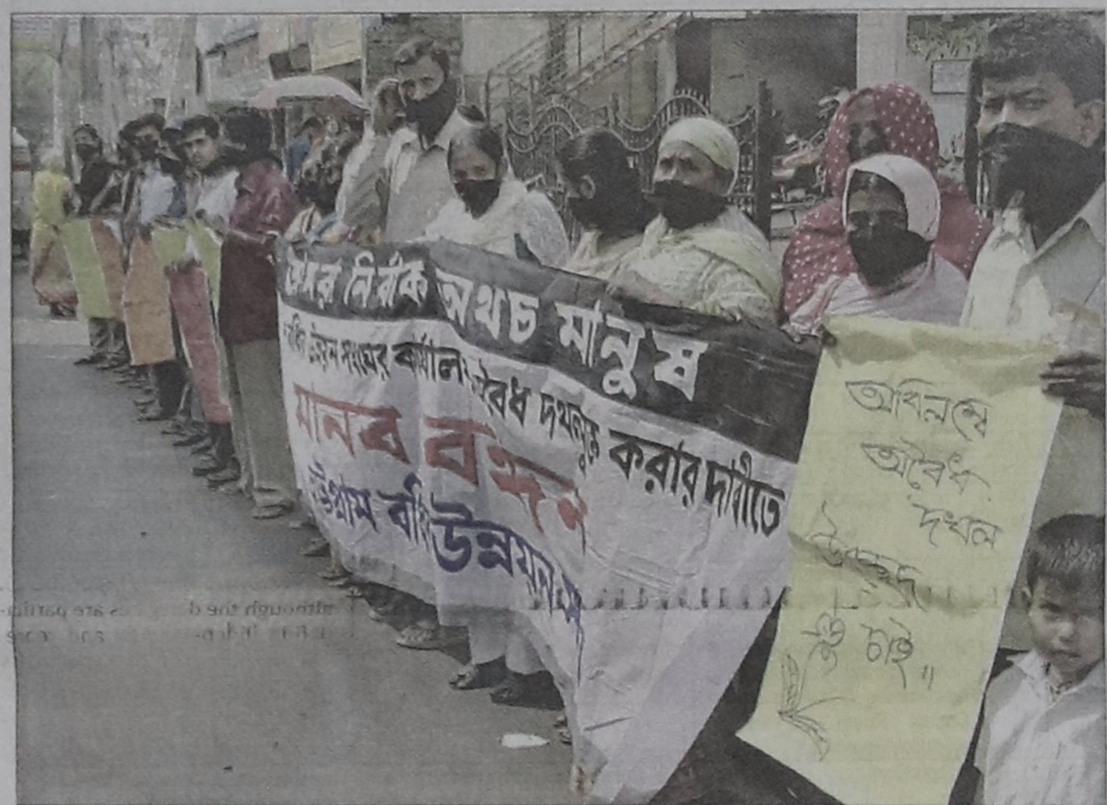
Badhir Unnayan Sangha (an association of the deaf) forms a human chain on the Chittagong Press Club premises yesterday protesting occupation of its land by the criminals in the Jamal Khan area in the port city.