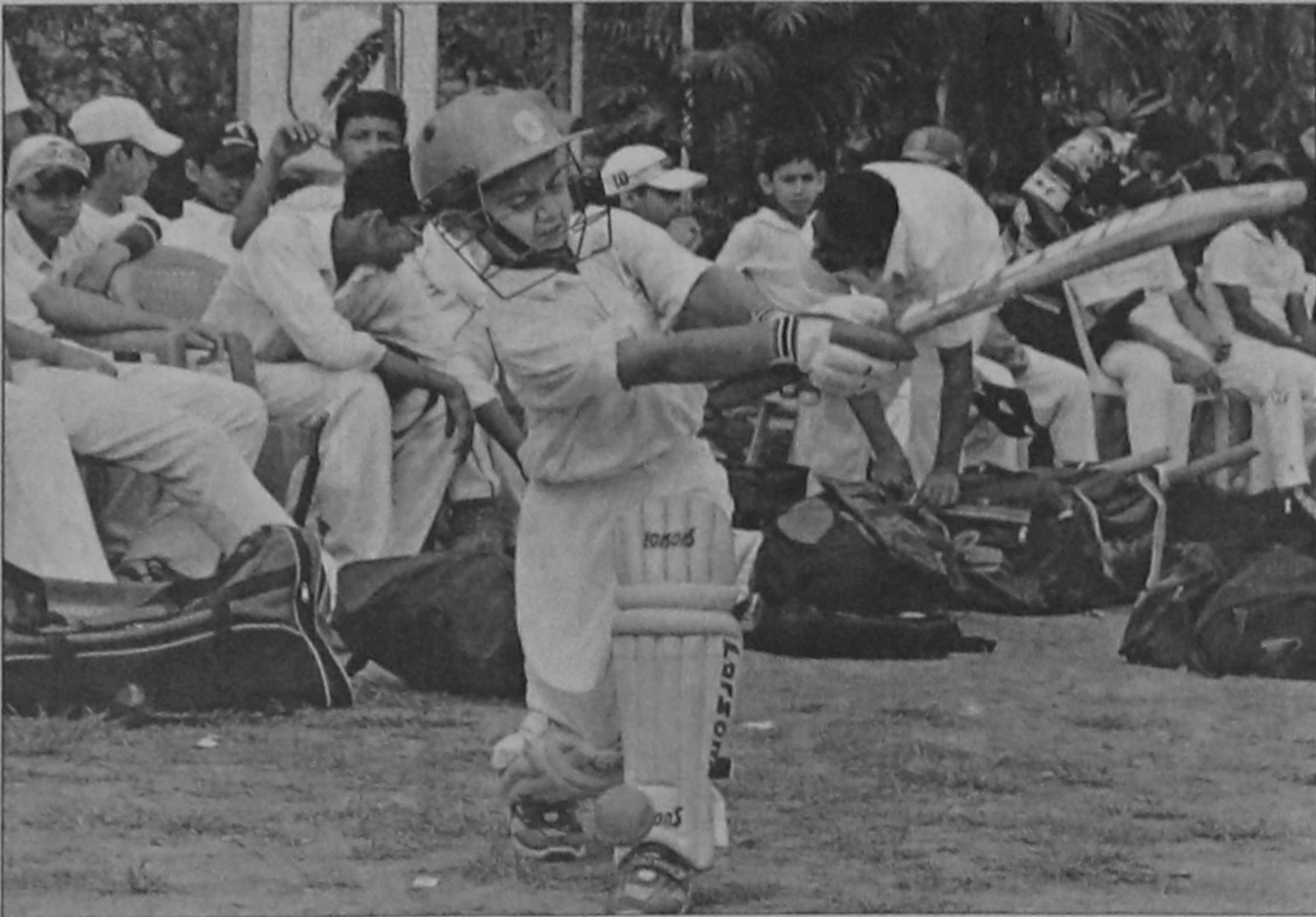
A tiny-tot attired fully in cricket gear practices a few swings before coming on to bat during the Boost Power Cup tournament being held at the Kalabagan cricket ground yesterday.

South Africa swept the two-Test series against Bangladesh and wrapped up the one-day series 3-0 with a seven-wicket win in Mirpur on Friday. The team will leave Bangladesh on Saturday and is scheduled to fly out from Johannesburg for Chennai on March 21.