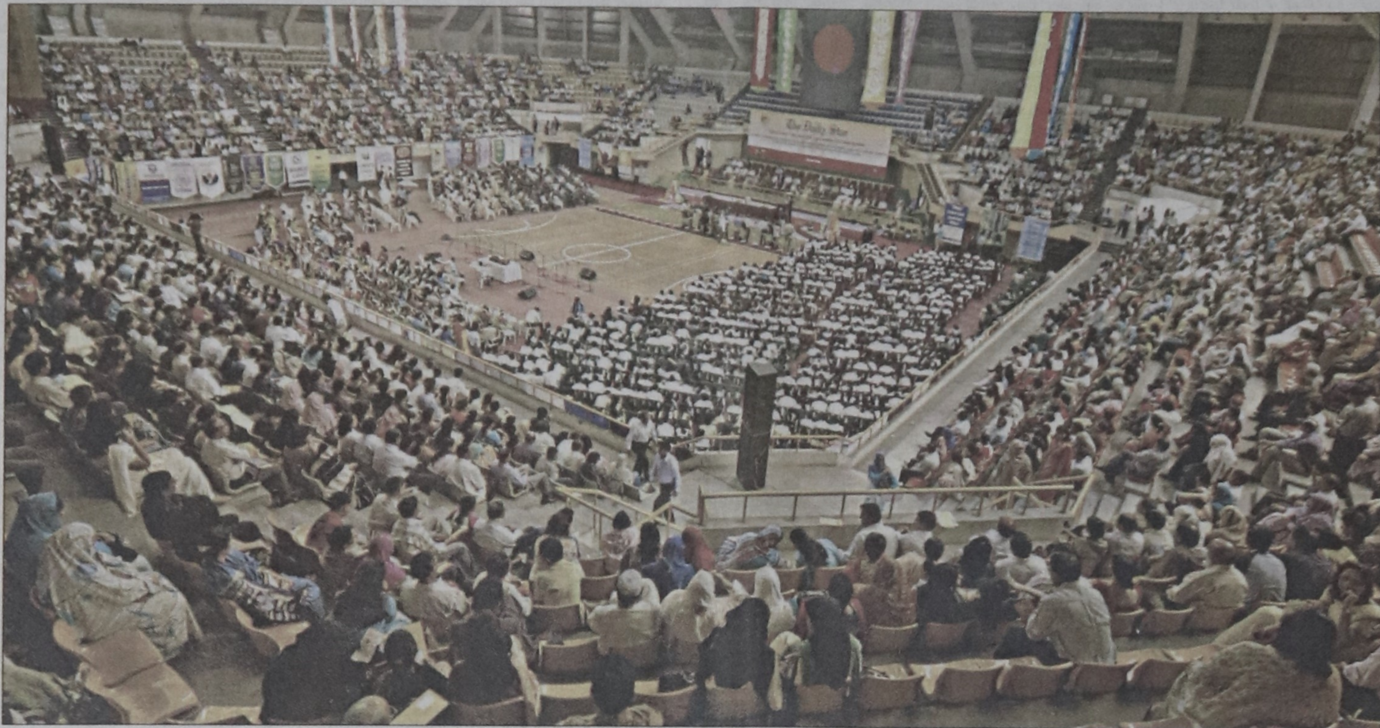
Awardees, their families, teachers, friends and invited guests at Shaheed Suhrawardy National Indoor Stadium in Mirpur during the ninth award presentation ceremony for outstanding students of "O" and "A" levels organised by The Daily Star yesterday.