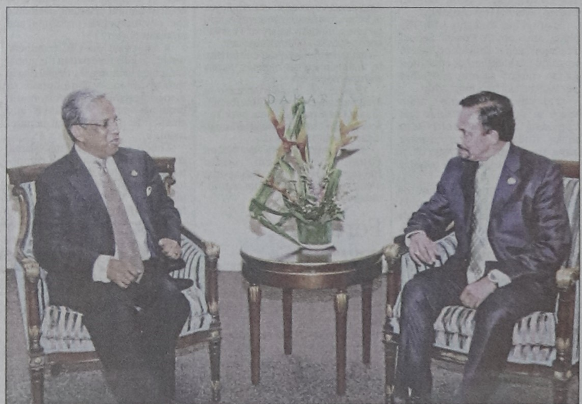
Chief Adviser Fakhruddin Ahmed meets Prime Minister of Brunei Sultan Haji Hassanal Bolkiah on the sidelines of the 11th OIC Summit in Dakar, Senegal yesterday.