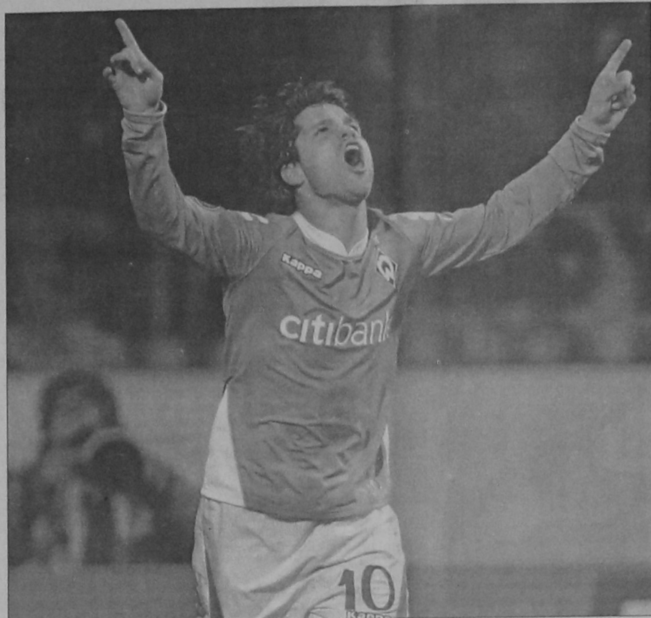
Werder Bremen star Diego celebrates after scoring the opening goal against Rangers during their UEFA Cup match at the Weser Stadium on Thursday.

"I don't know what was lacking today. It was one of those games."