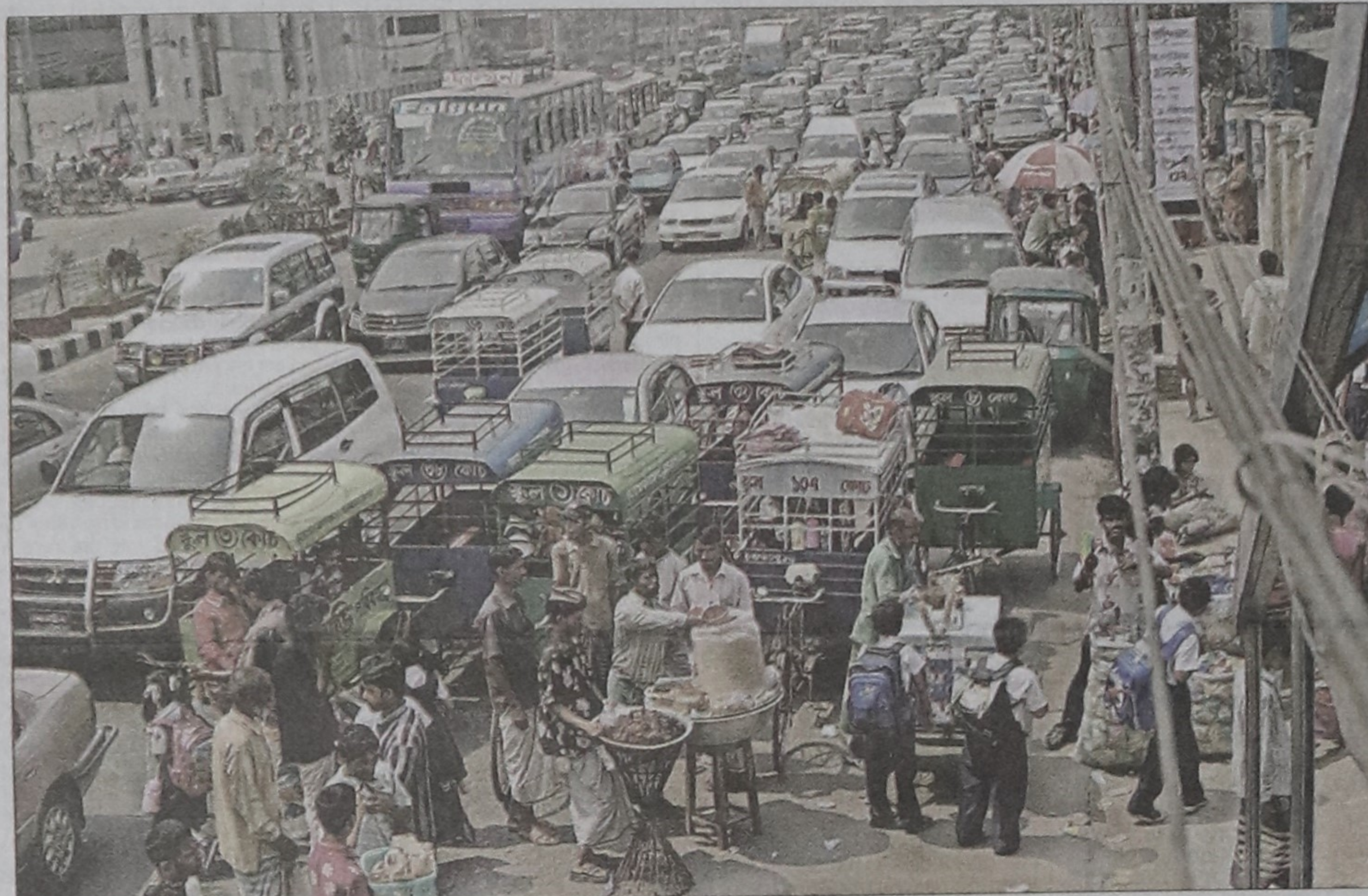
Haphazardly parked three-wheelers and cars and snack hawkers' occupation of a part of the street in front of Willes Little Flower School in Kakrail create tailbacks yesterday. Most educational institutions in the capital do not have their own car park.

Several hundred students of Fazle Rabbi Hall of Dhaka Medical College (DMC) blockaded the city's Bakshi Bazar intersection for about three hours last night protesting frequent power cuts. There was no power at their dormitory from 6:00pm to 11:30pm. They took to the streets around 9:00pm and stayed there until 12:00am. During the demonstration, the students set fire to tyres on the street and blocked all four roads of