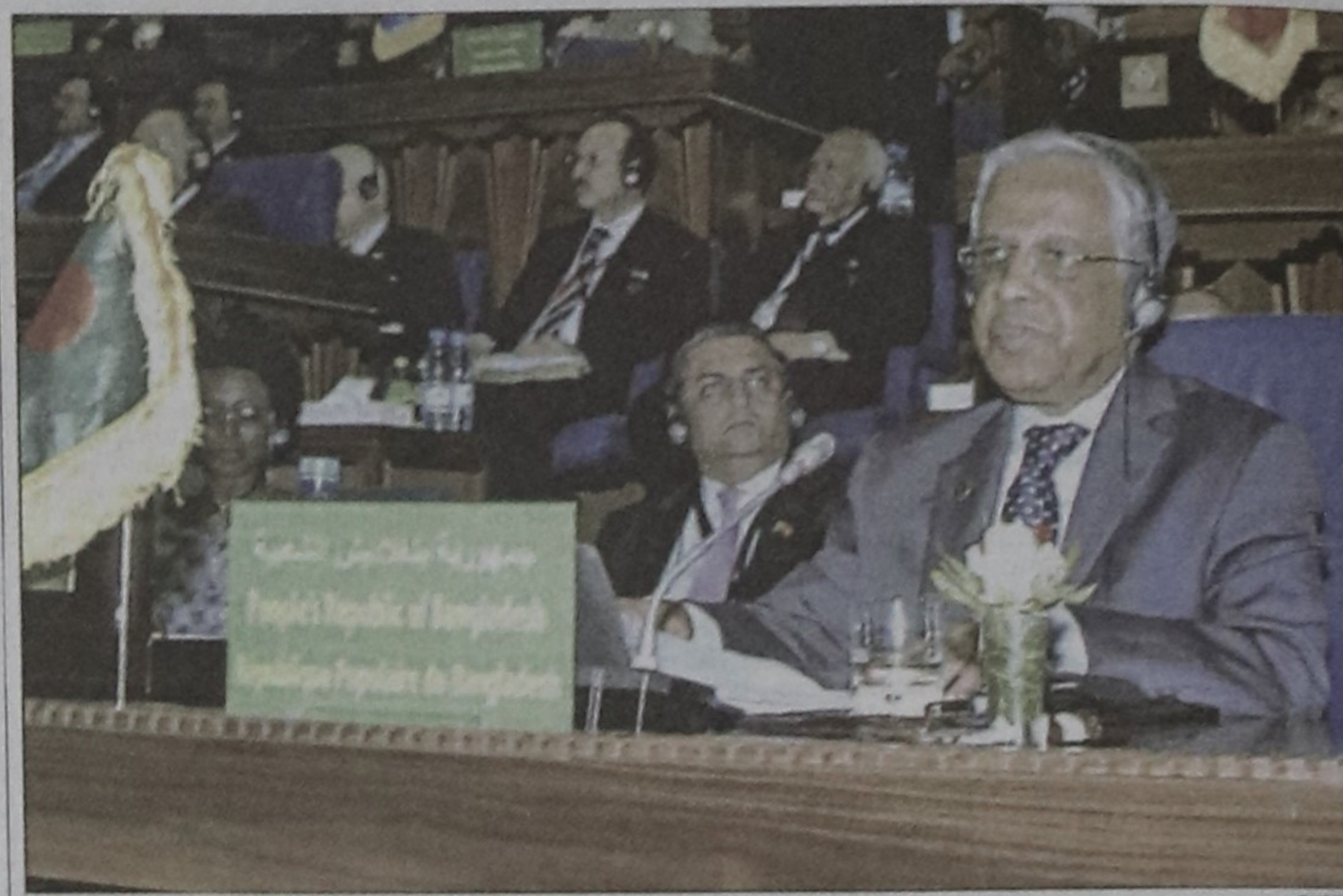
Chief Adviser Fakhruddin Ahmed during the opening session of the 11th OIC Summit held in Senegalese capital Dakar yesterday gives vote of thanks on behalf of the Asian group.