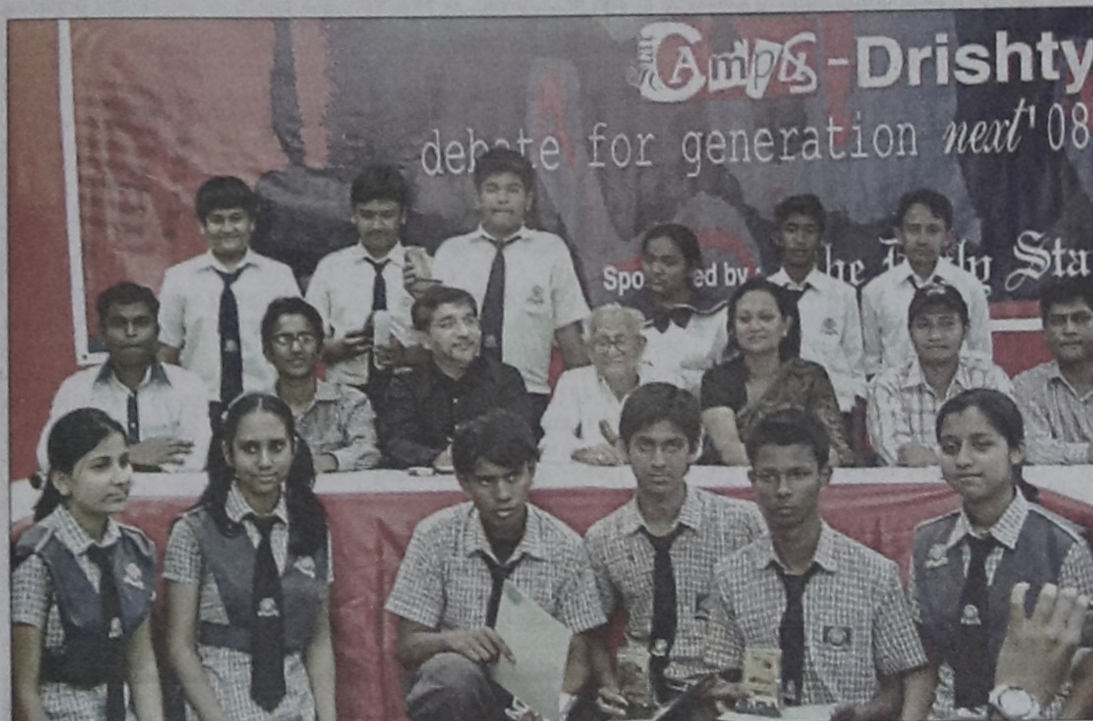
Winners of the final rounds of inter-class debate competition of Sunshine Grammar School and College and Chittagong Sunshine School and College pose for photograph with the guests at the prize giving ceremony in the port city yesterday. The competition was held as part of the Star Campus-Drishly Debate for Generation Next '08.