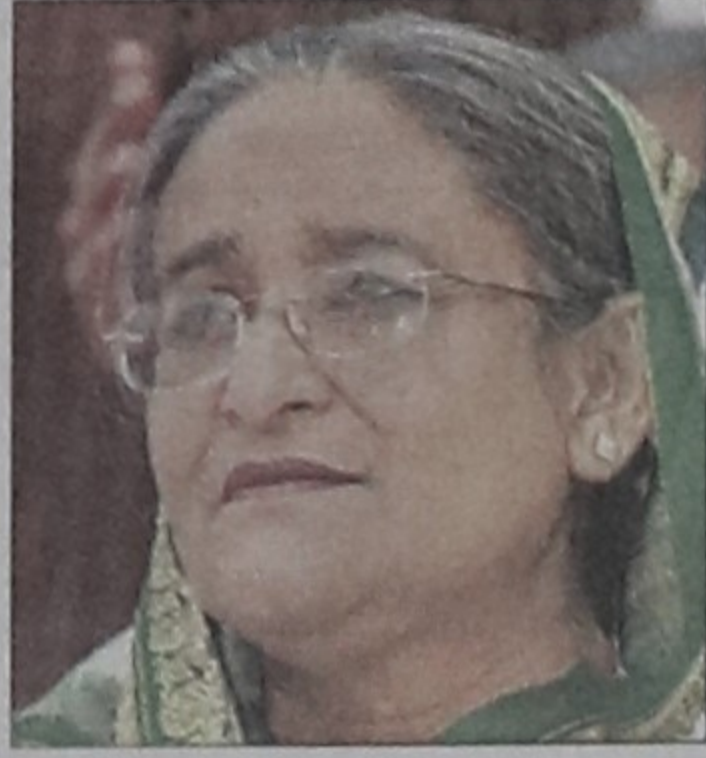
the former premier in the hospital yesterday.