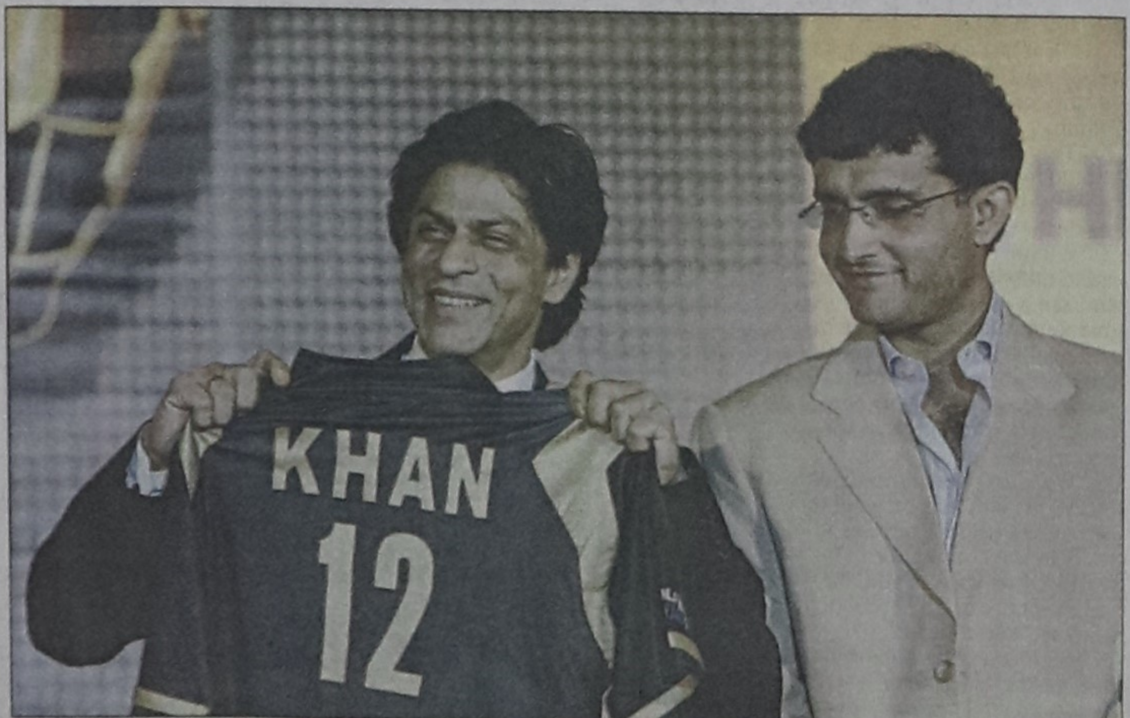
Indian actor and co-owner of the 'Kolkata' cricket team Shahrukh Khan (L) displays the team jersey as his captain Sourav Ganguly watches during a press meet in Kolkata yesterday. The Indian Professional League featuring eight franchised city-based teams drawn from a star cast of cricket's top players, will be held over 44 days in 12 Indian cities from April 18.