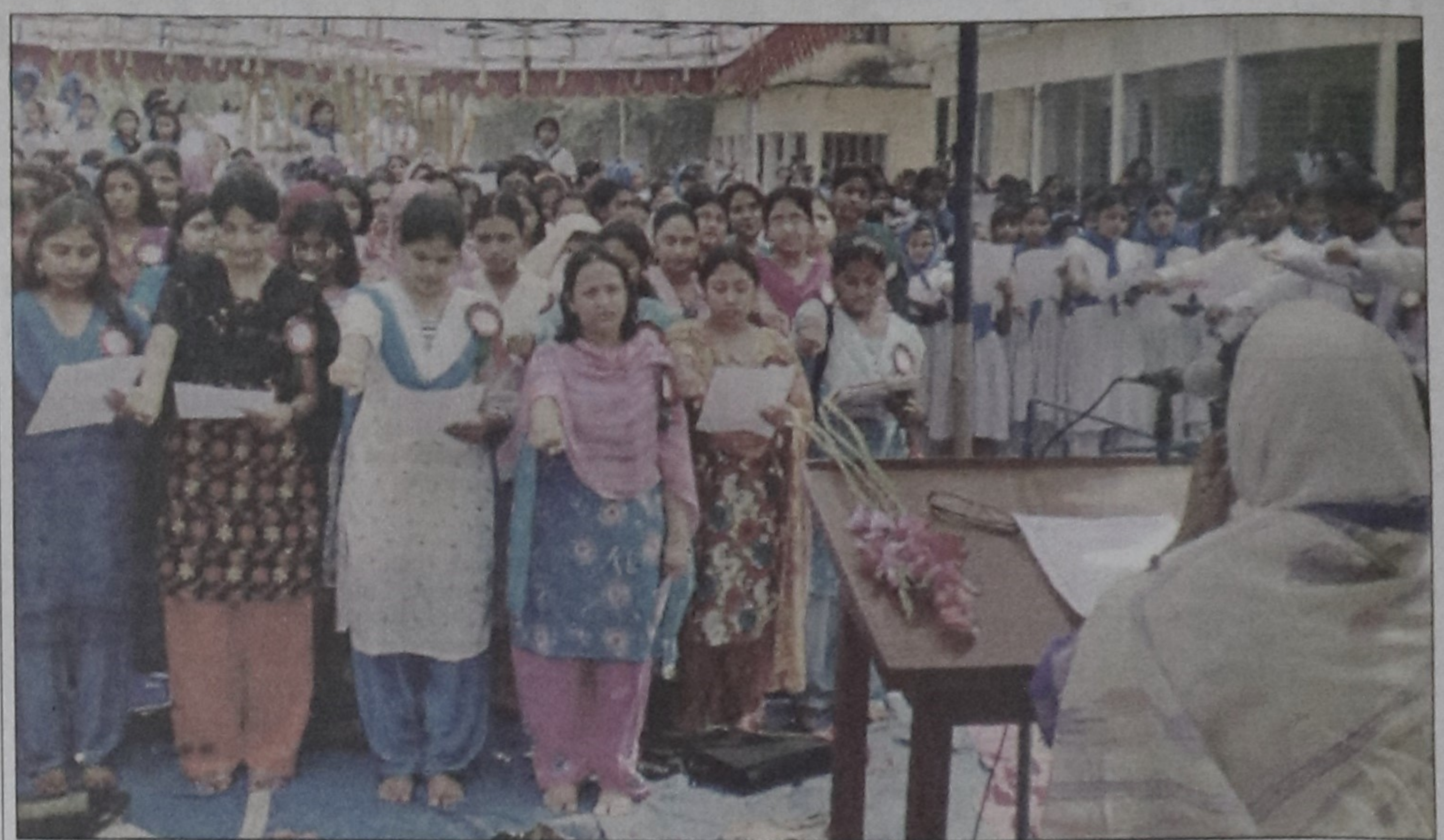
Students of Chapainawabganj Government Girls School taking oath against corruption yesterday.

He was also arrested during the anti-crime drive Operation Clean Heart.