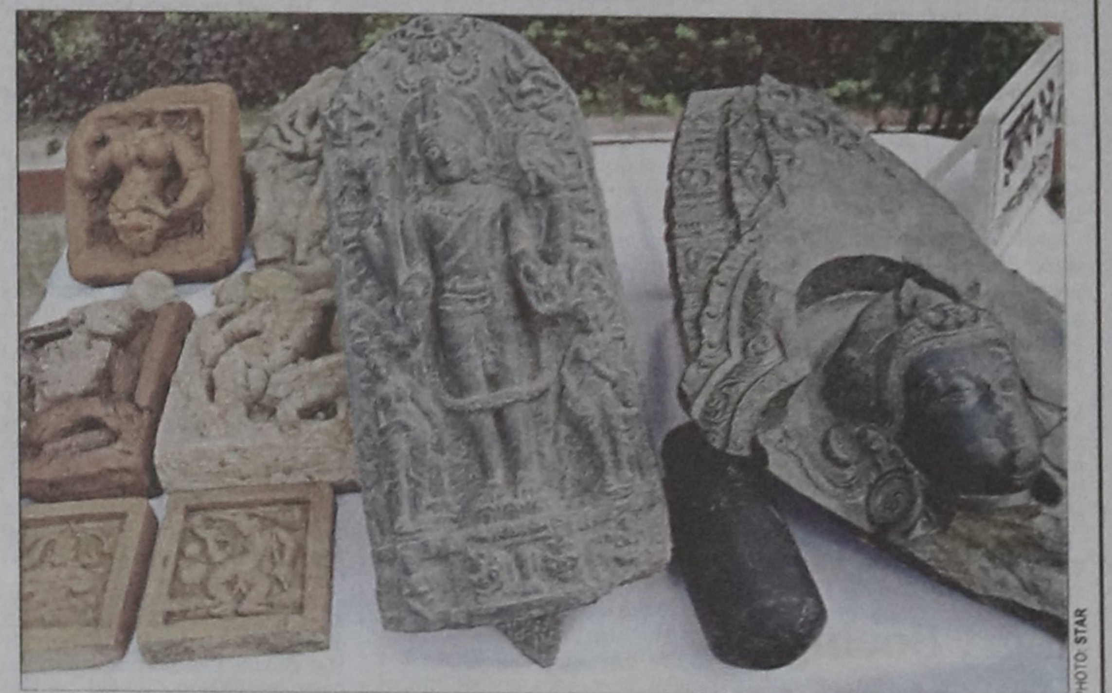
The artefacts including the over-thousand-year-old Vishnu statue, centre, recovered by Rab members in Gaibandha and Dinajpur.

They also recovered several artefacts including ancient terracotta tiles at Shahargachhi village in Gaibandha and Kamarpada village in Dinajpur.