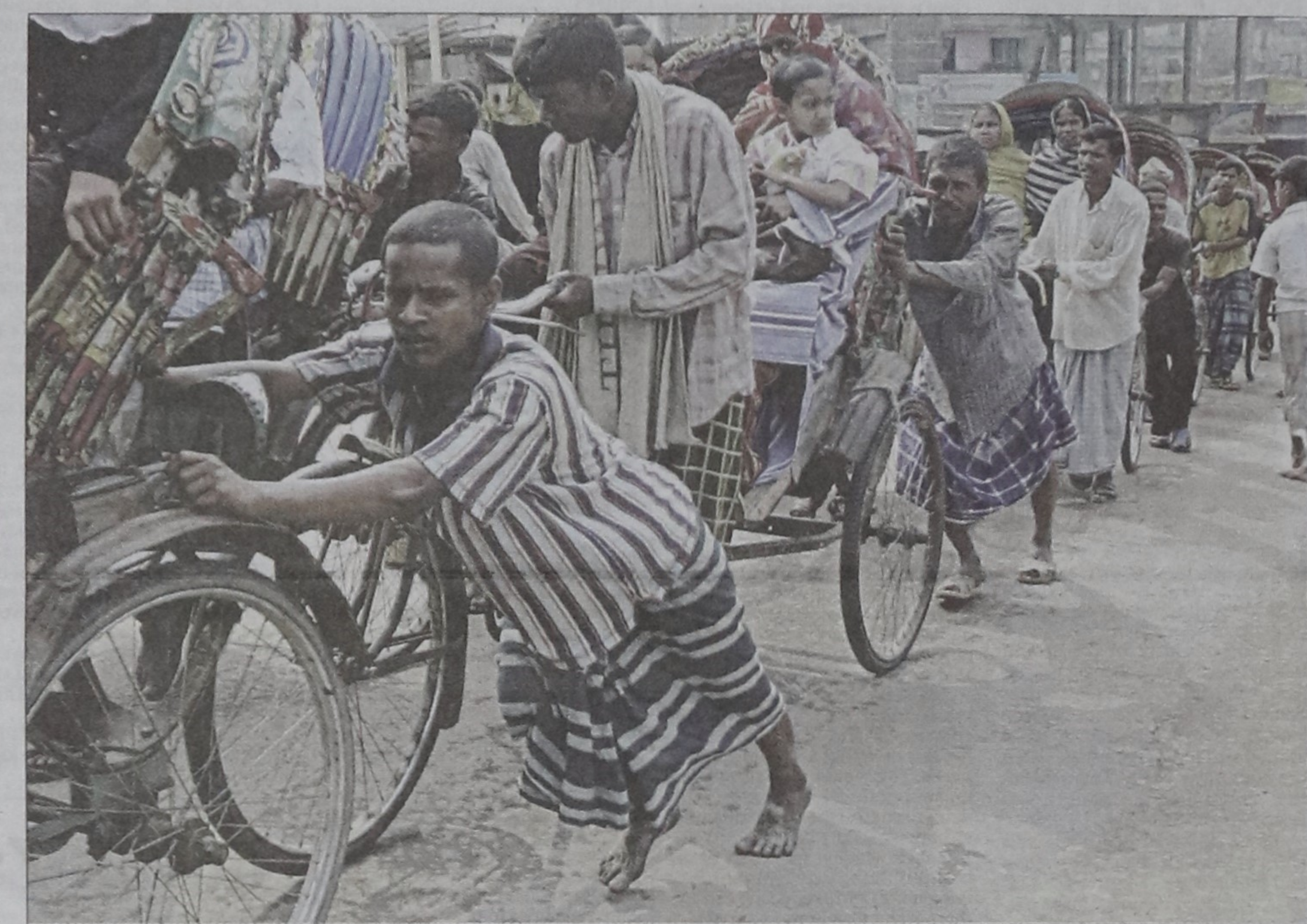
These people earn their livelihood by pushing rickshaws up the slope of Kamrangirchar Bridge under Kamrangirchar Police Station in the capital in exchange for just Tk 1. The photo was taken yesterday.

Ziaul Huq demanded proper investigation into the death.