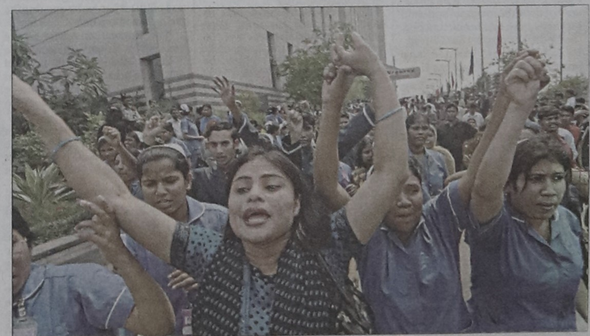
Staffs of Apollo Hospitals in the city's Bashundhara residential area stage a demonstration in front of the hospital protesting the decision of retrenching employees.

First ODI against SA today SPORTS REPORTER