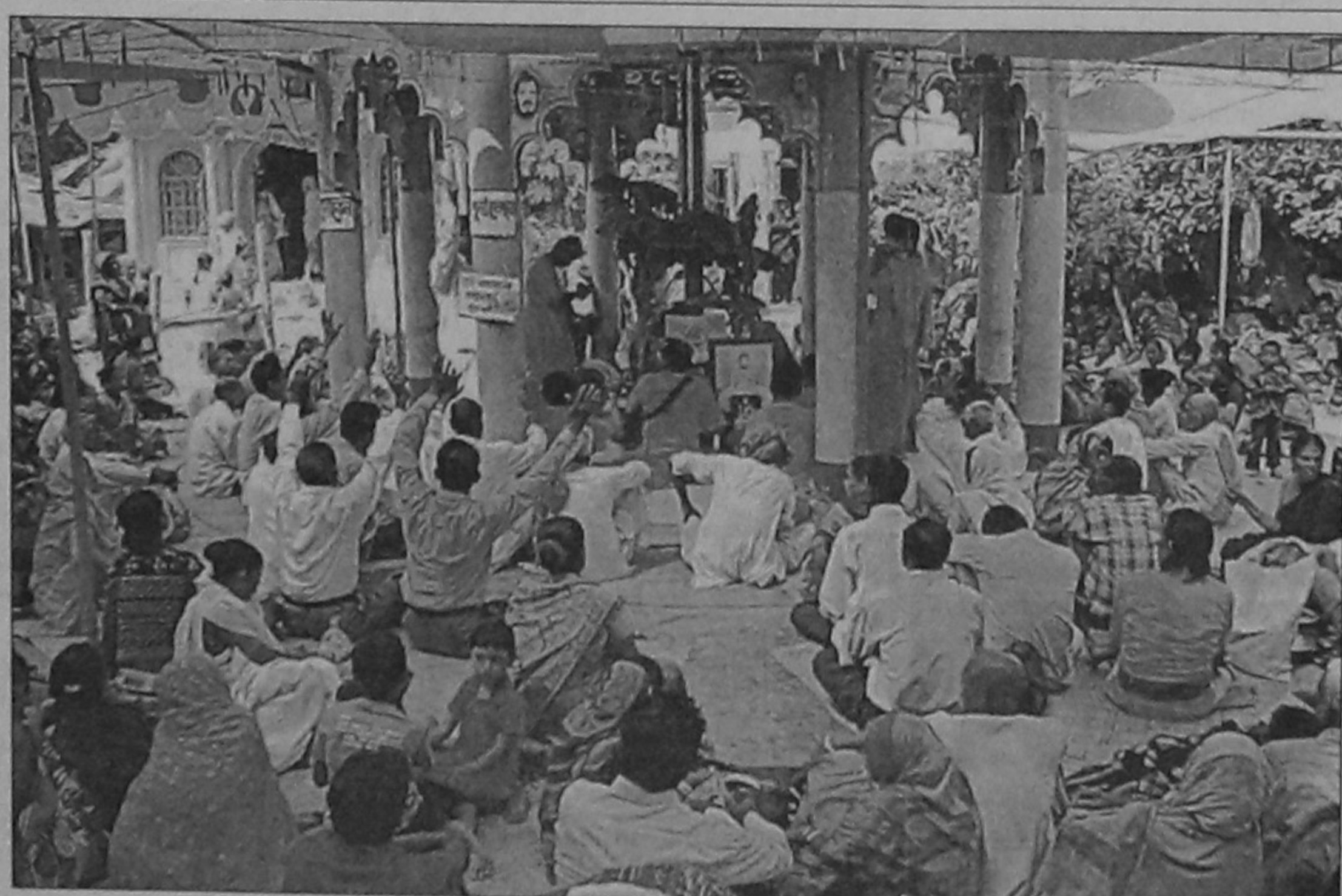
Devotees at the concluding day of three-day Shib Chaturdashai fair at Chandranathdham in Sitakunda in Chittagong yesterday.