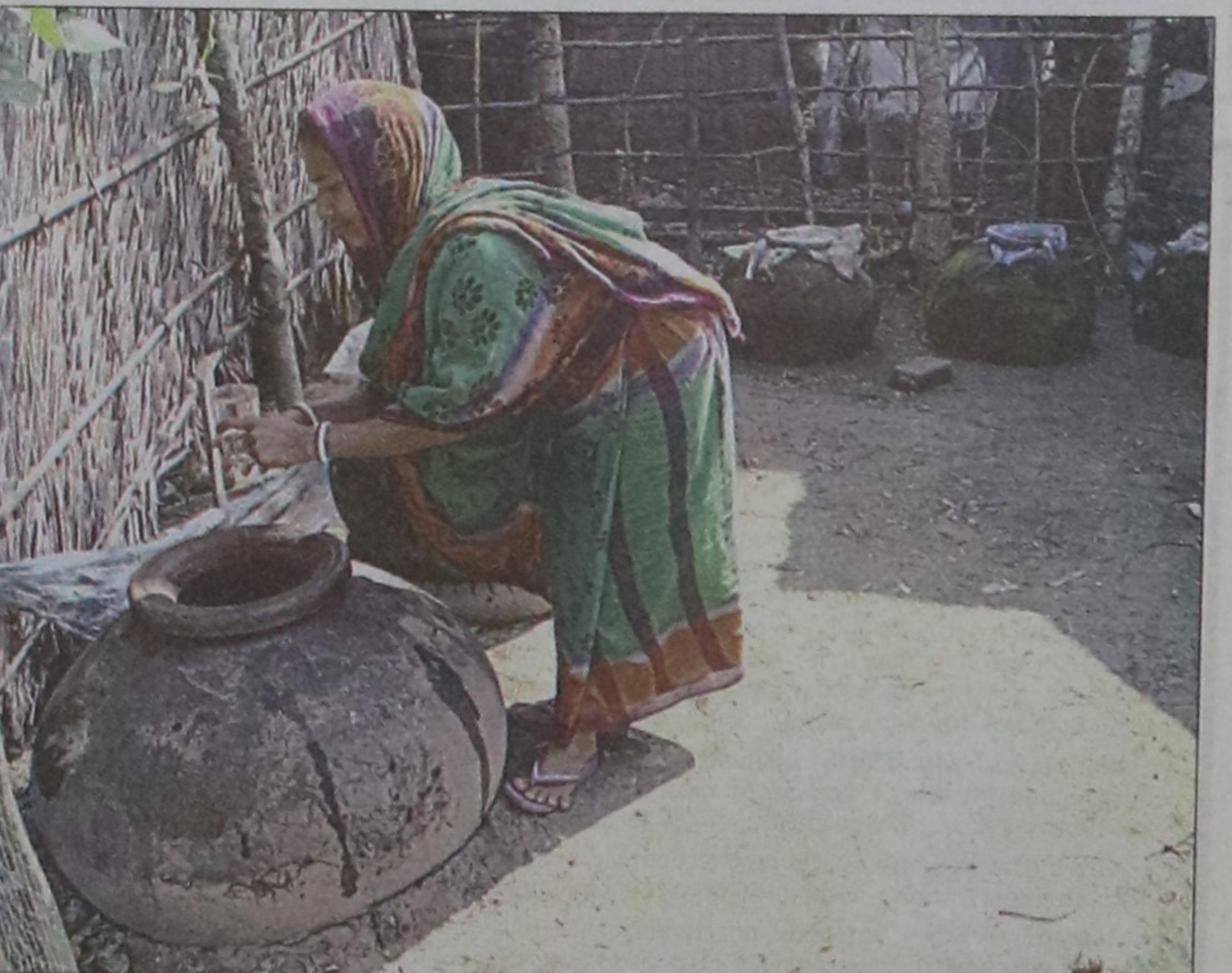
Due to high salinity in water in the south-western region of the country, people use large vessels to store rainwater for drinking and cooking. The photo was taken from Mongla in Bagerhat.