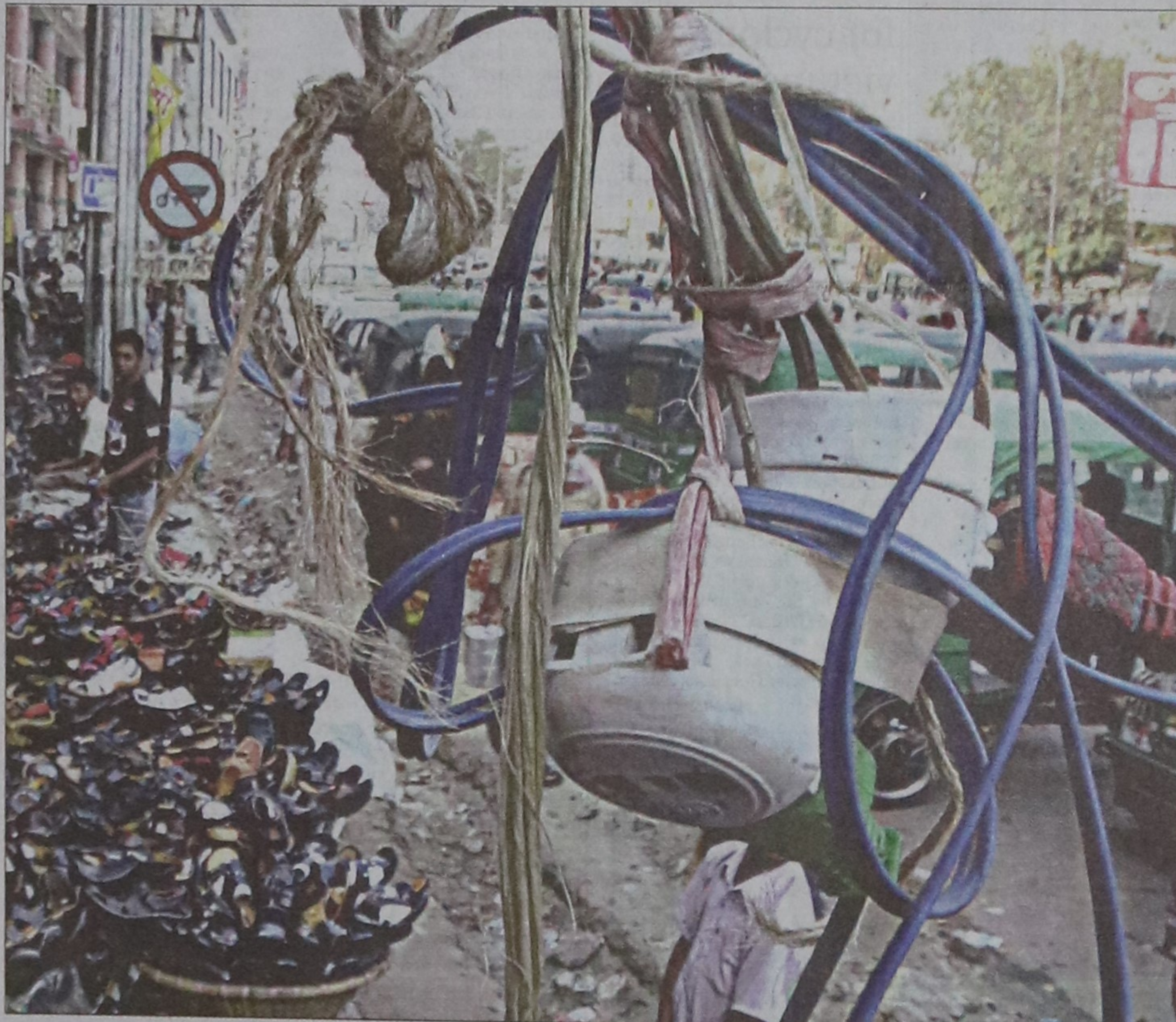
A syndicate hoists illegal power outlets on the pavement of Bangabandhu Avenue at Gulistan in the capital and sells power to street vendors. The criminals are making profit by stealing power in this way and causing a huge financial loss to Desa.