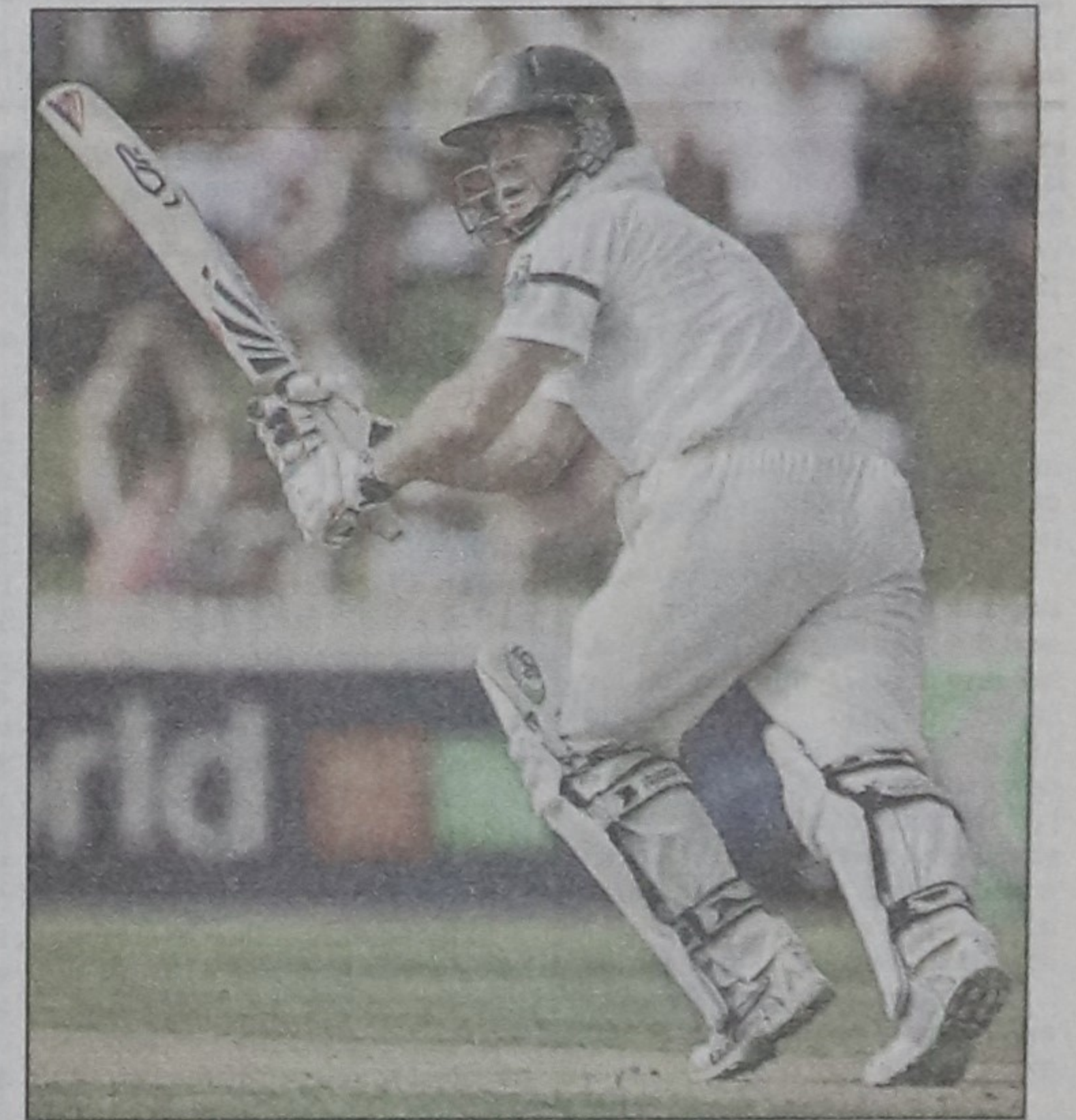
New Zealand opener Jamie How flicks the ball on way to a solid 92 on the opening day of the first Test against England in Hamilton yesterday.