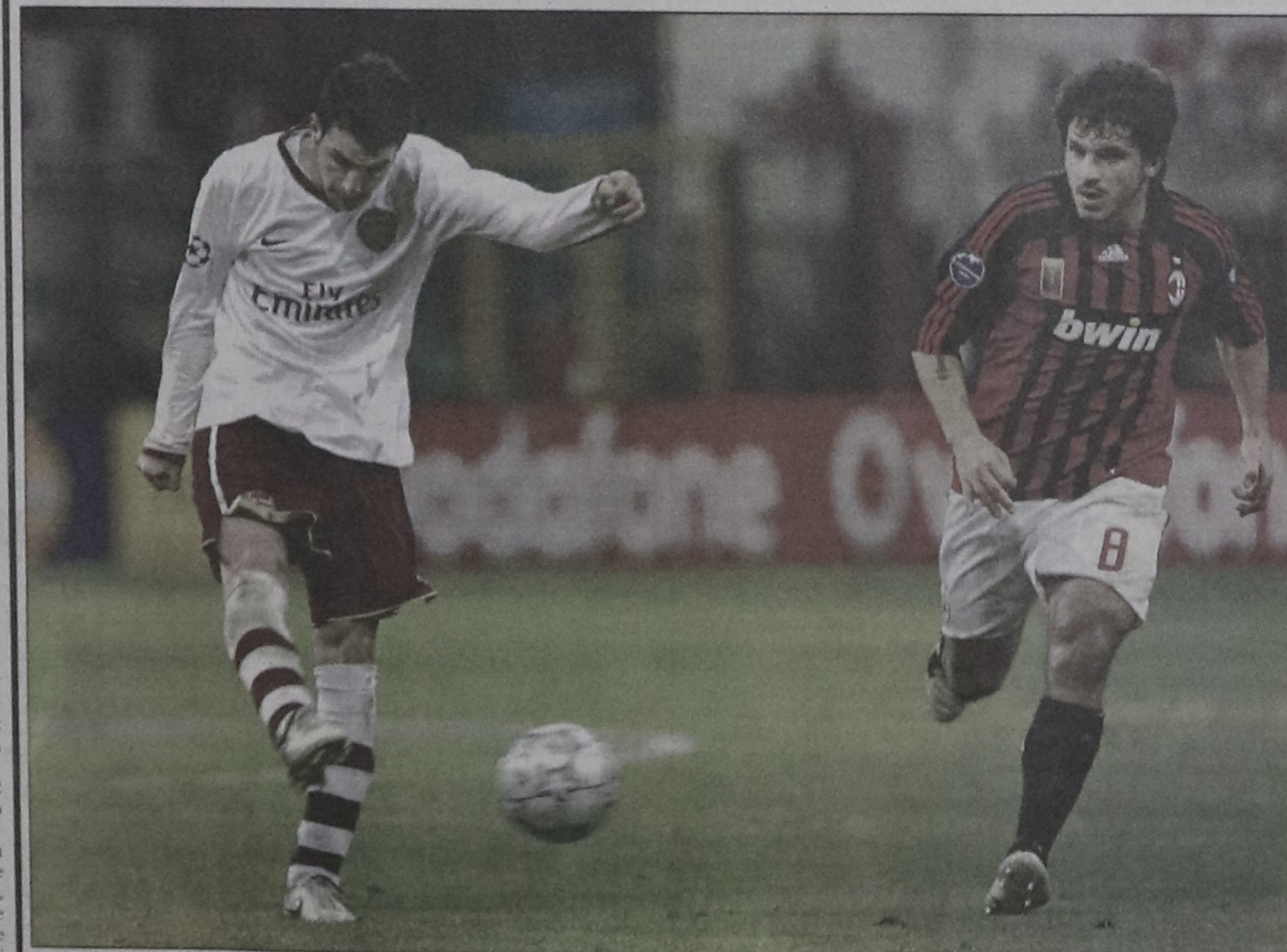
Arsenal star Cesc Fabregas (L) shoots to score the opening goal as Milan midfielder Gennaro Ivan Gattuso looks on during their Champions League encounter at the San Siro on Tuesday.