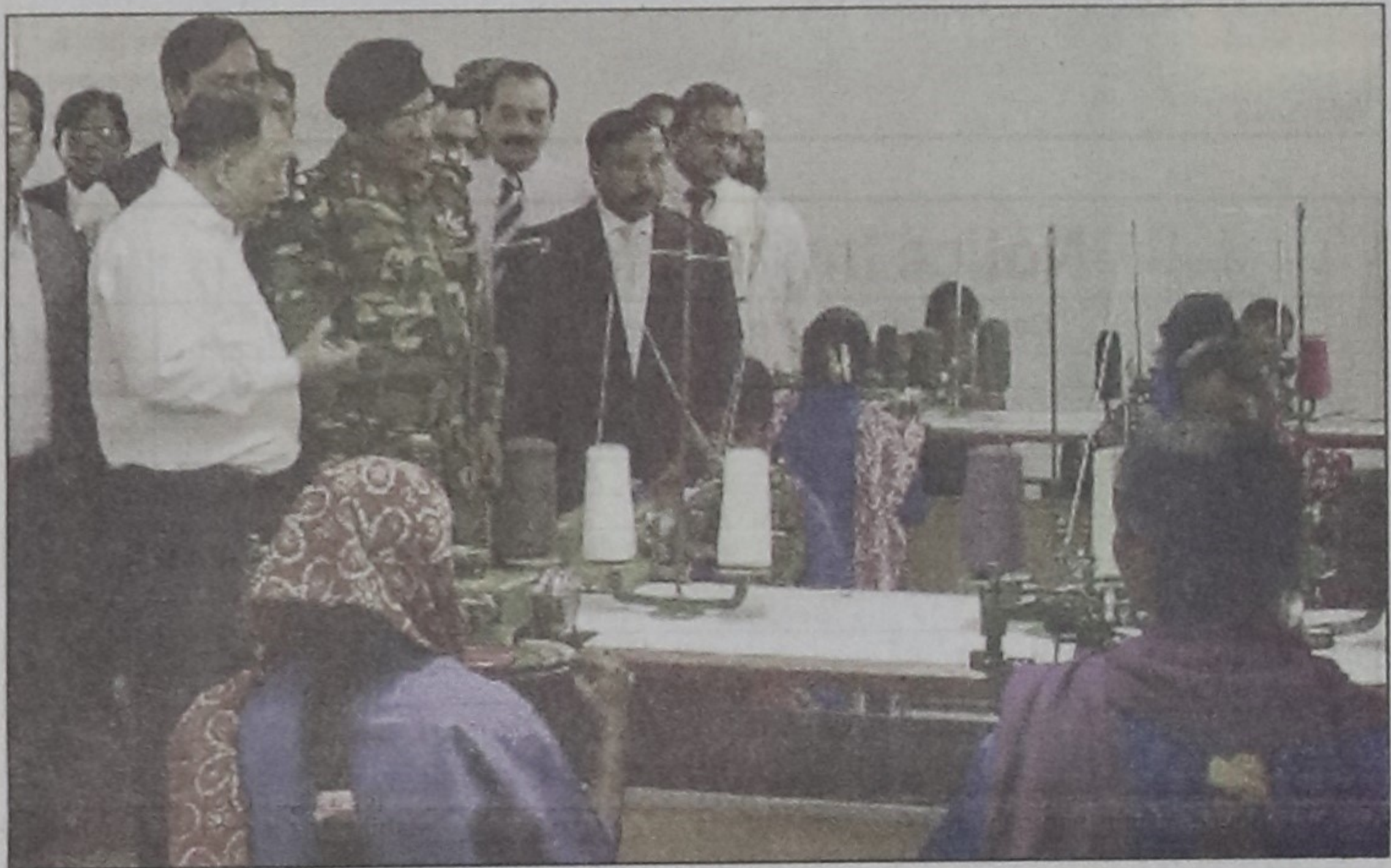
A knitting training centre was inaugurated at Nilphamari yesterday to create jobs for people in munga-prone areas.

Last year the AL leader submitted his wealth statement mentioning wealth worth Tk 47 lakh 12 thousand and 136 as his total asset but the ACC later found that he possessed wealth worth Tk 50 lakh 50 thousand 821, goes the prosecution.