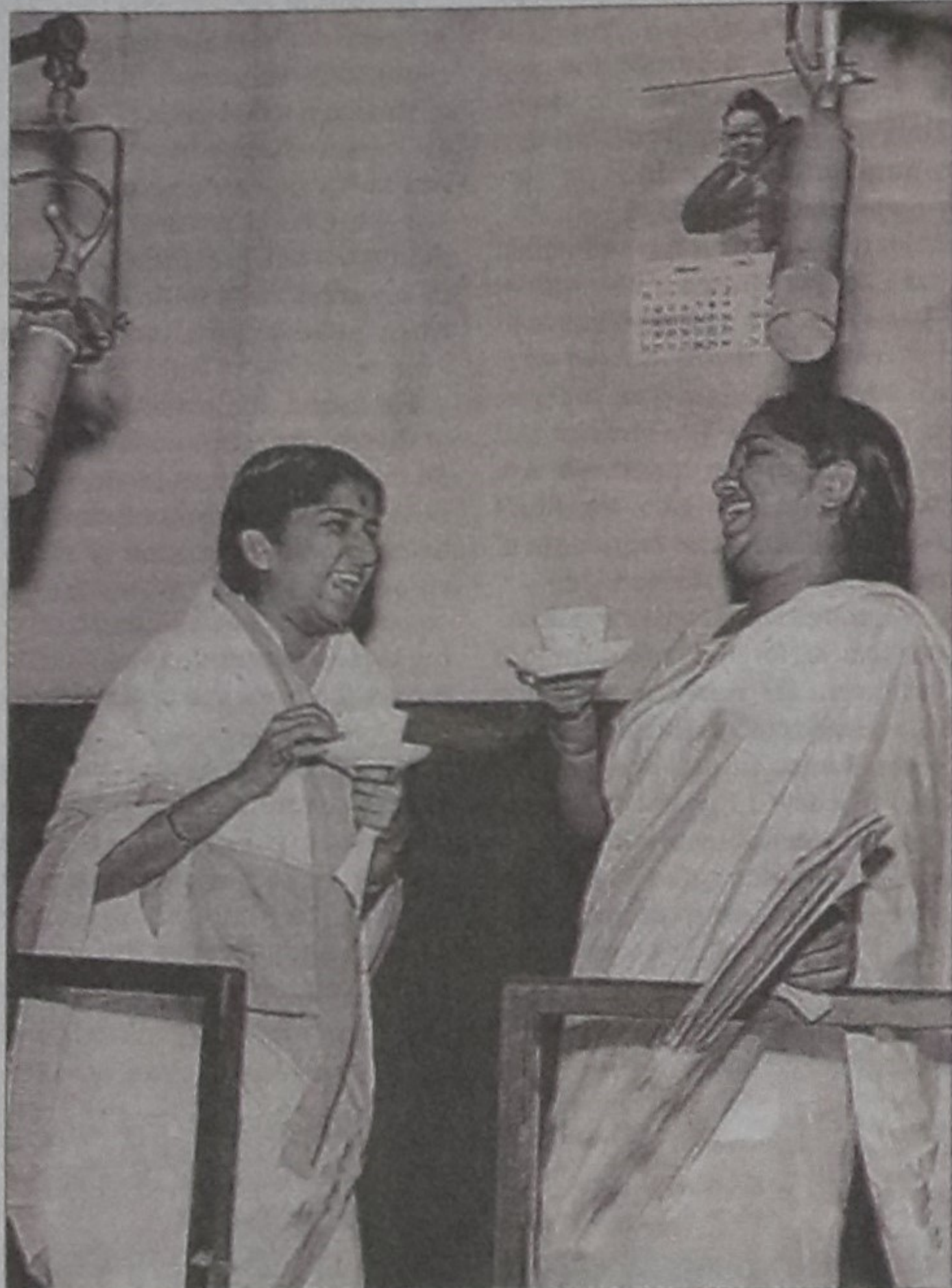
Lata Mangeshkar and her sister Asha Bhosle

Geeta Dutt (singer and actress) and I came at the same time, though she became popular with the songs of Do Bhai before I did. Geeta's voice was very charming, with a distinctive Bengali lilt to it. She had good enunciation and diction too. She relied more on instinct than practice, so her