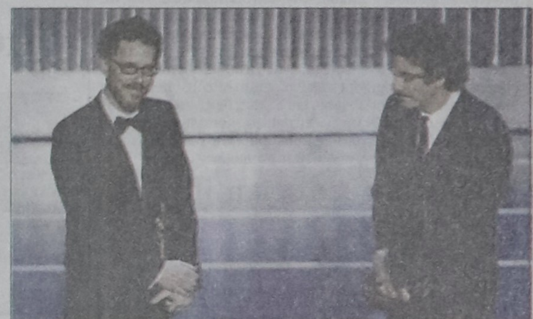
The Coen brothers at the Oscars this year