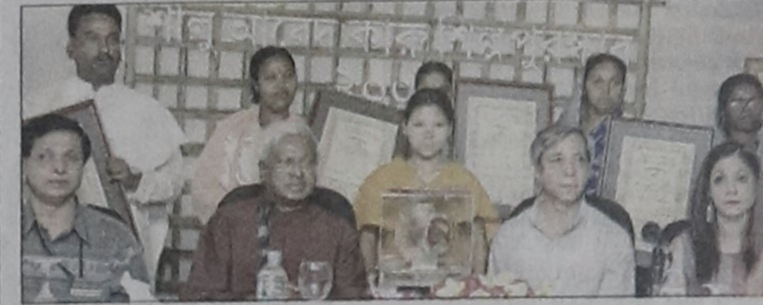
Recipients of Shilu Abed Handicrafts Award 2008 pose for photograph with Brac Chairperson Fazle Hasan Abed, sitting 2nd from left, and other guests at the award giving ceremony at the Brac Centre auditorium yesterday.

The committee is scheduled to submit its report today.