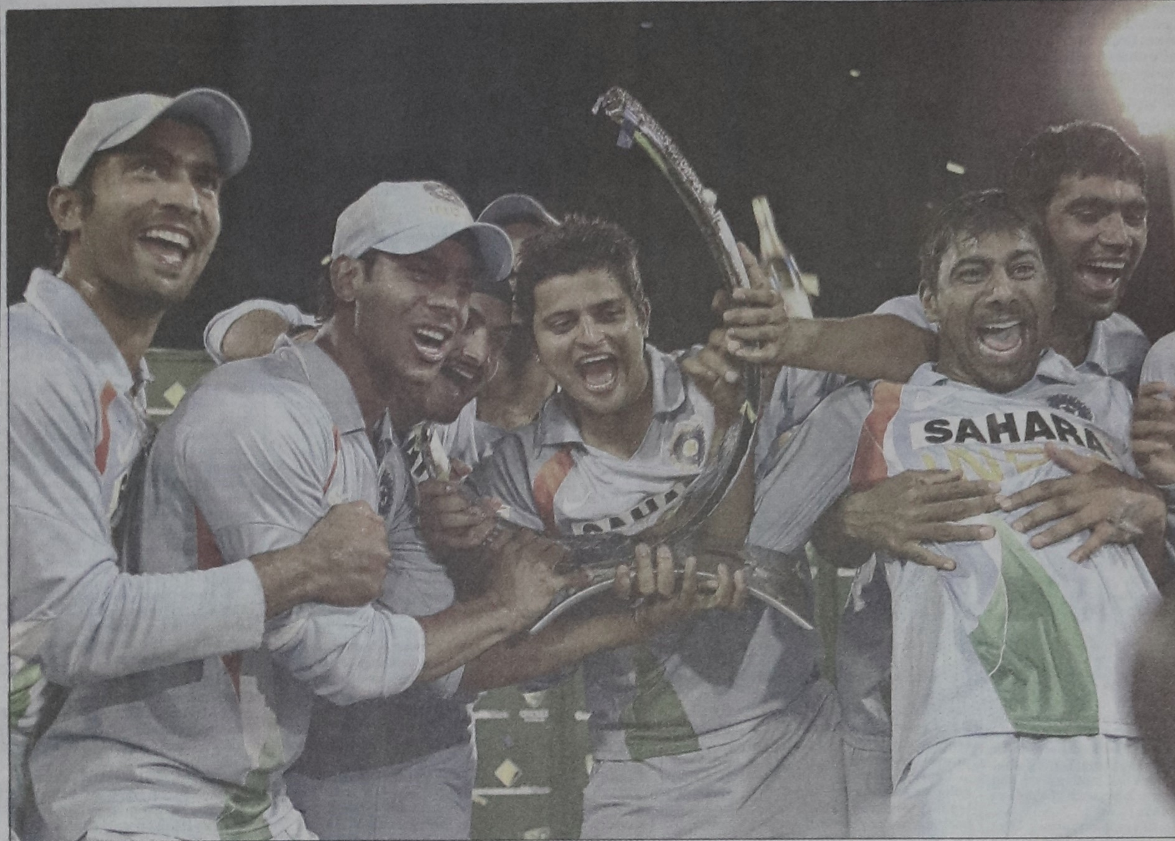
THE CHAMPS: Indian team celebrate with the CB Series trophy after their nine-run triumph over Australia in the second final of the one-day triangular tournament in Brisbane yesterday. India clinched the series by winning the first two games.