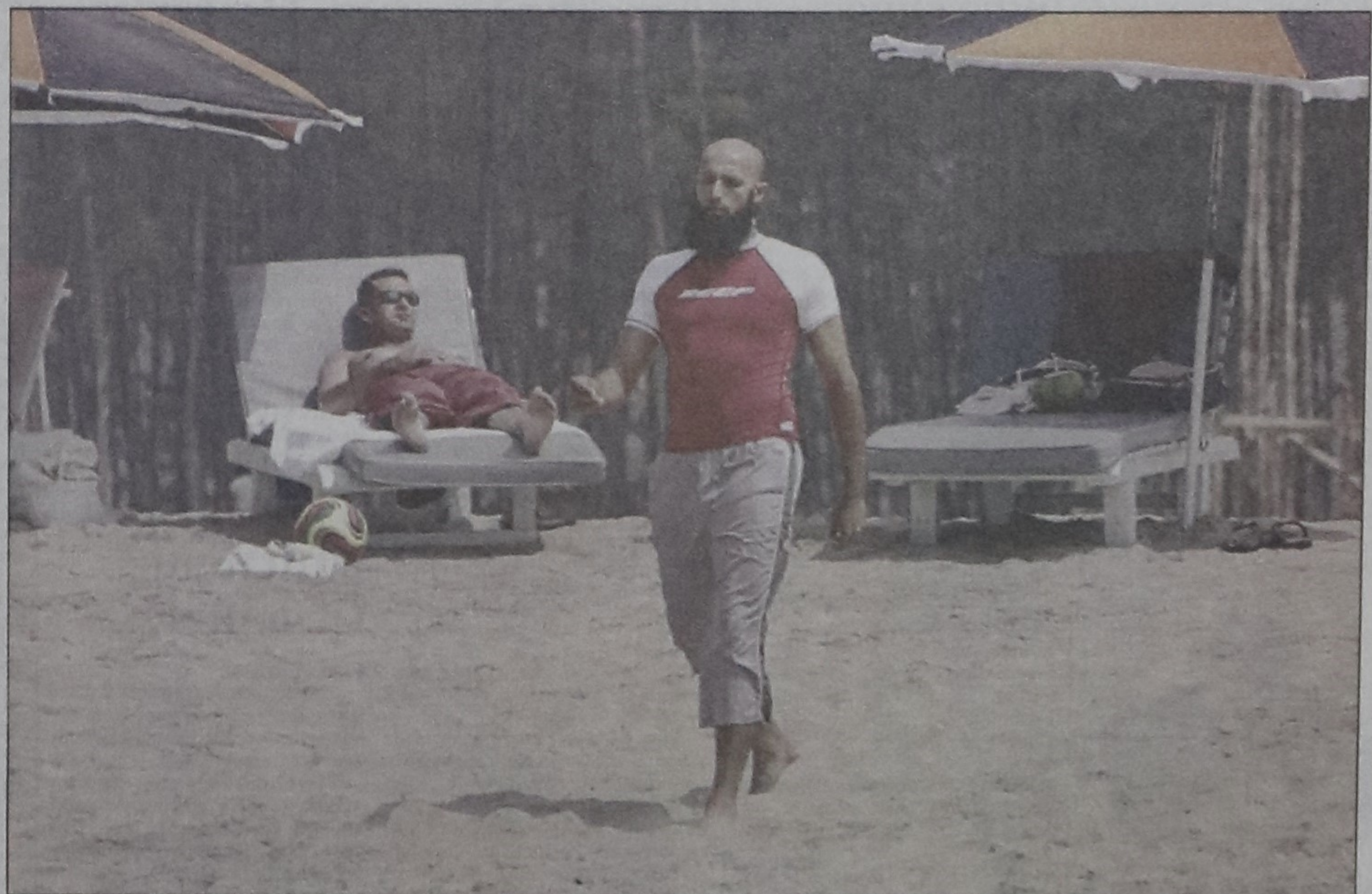
TIME OUT: South African captain Graeme Smith relaxes under the glorious sunshine while a bearded Hashim Amla walks through the sandy beach of Cox's Bazar yesterday. The Proteas enjoyed an unscheduled day off after their victory by an innings and 205 runs against Bangladesh in the fourth morning of the Chittagong Divisional Stadium on Monday.