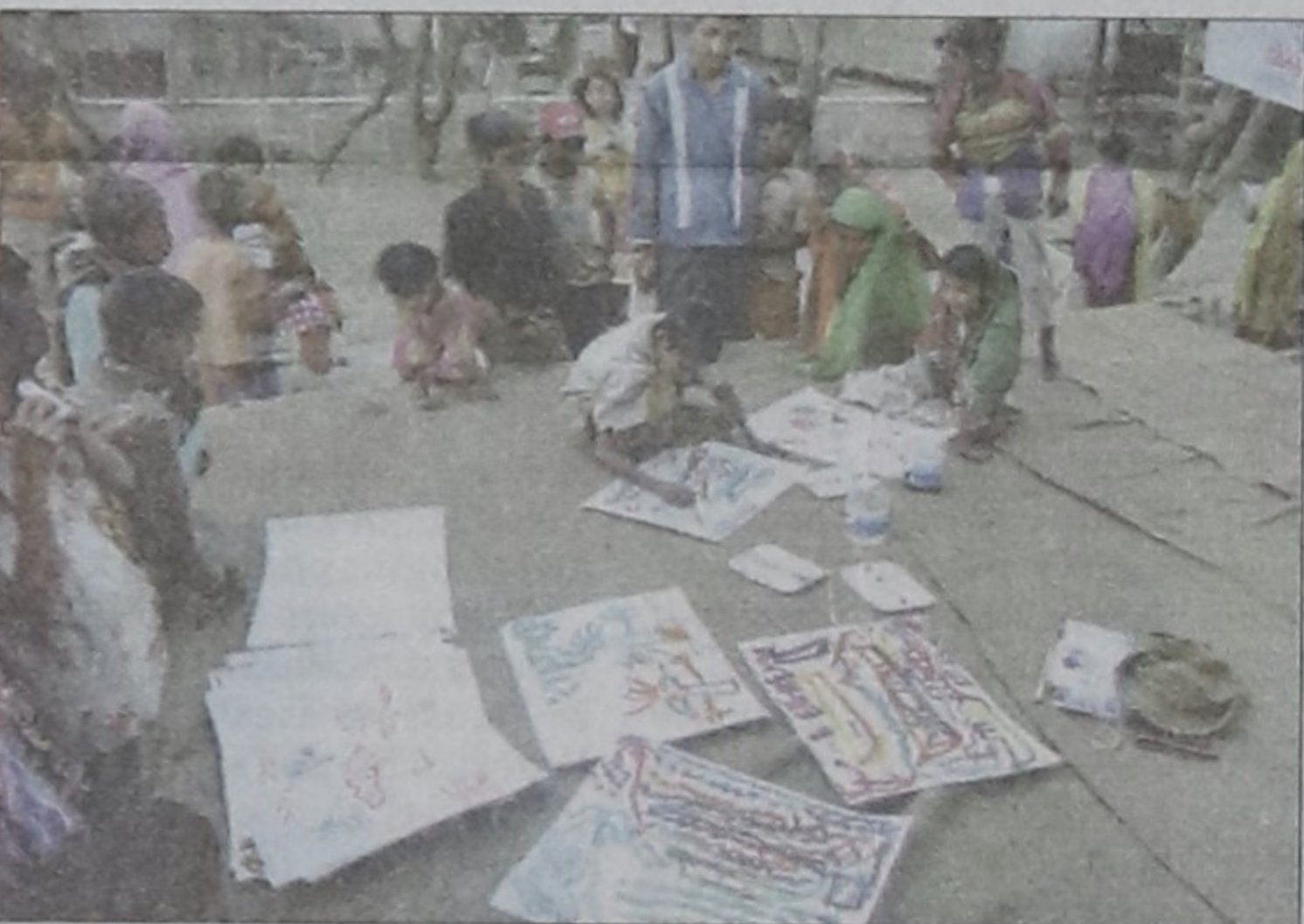
Children take part in an art workshop

Each artist produced 6-8 artworks. After witnessing the devastation caused by Sidr first