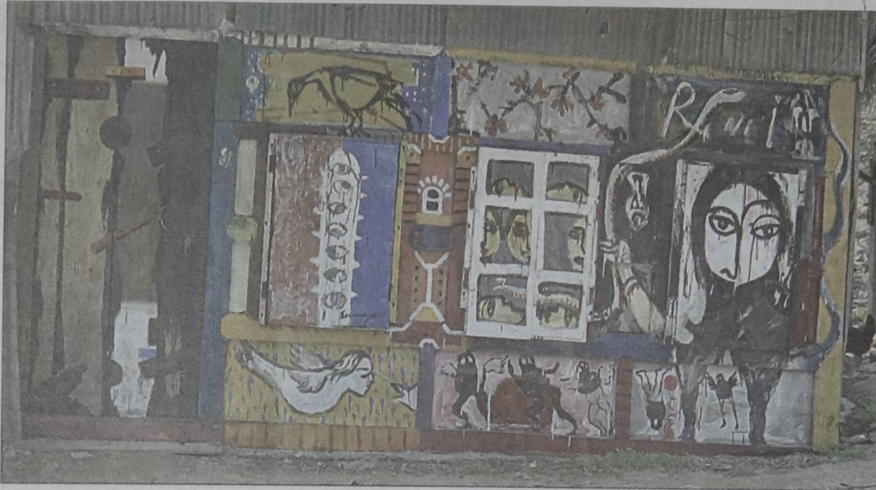
A group-painting by the artists

The artists spent time with the children everyday through different activities which ranged from listening to music to art workshops.