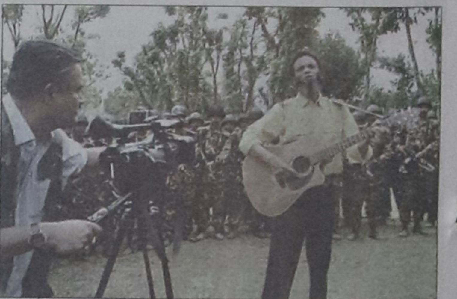
Making the video

The video was released on March 3 on the occasion of BDR week.