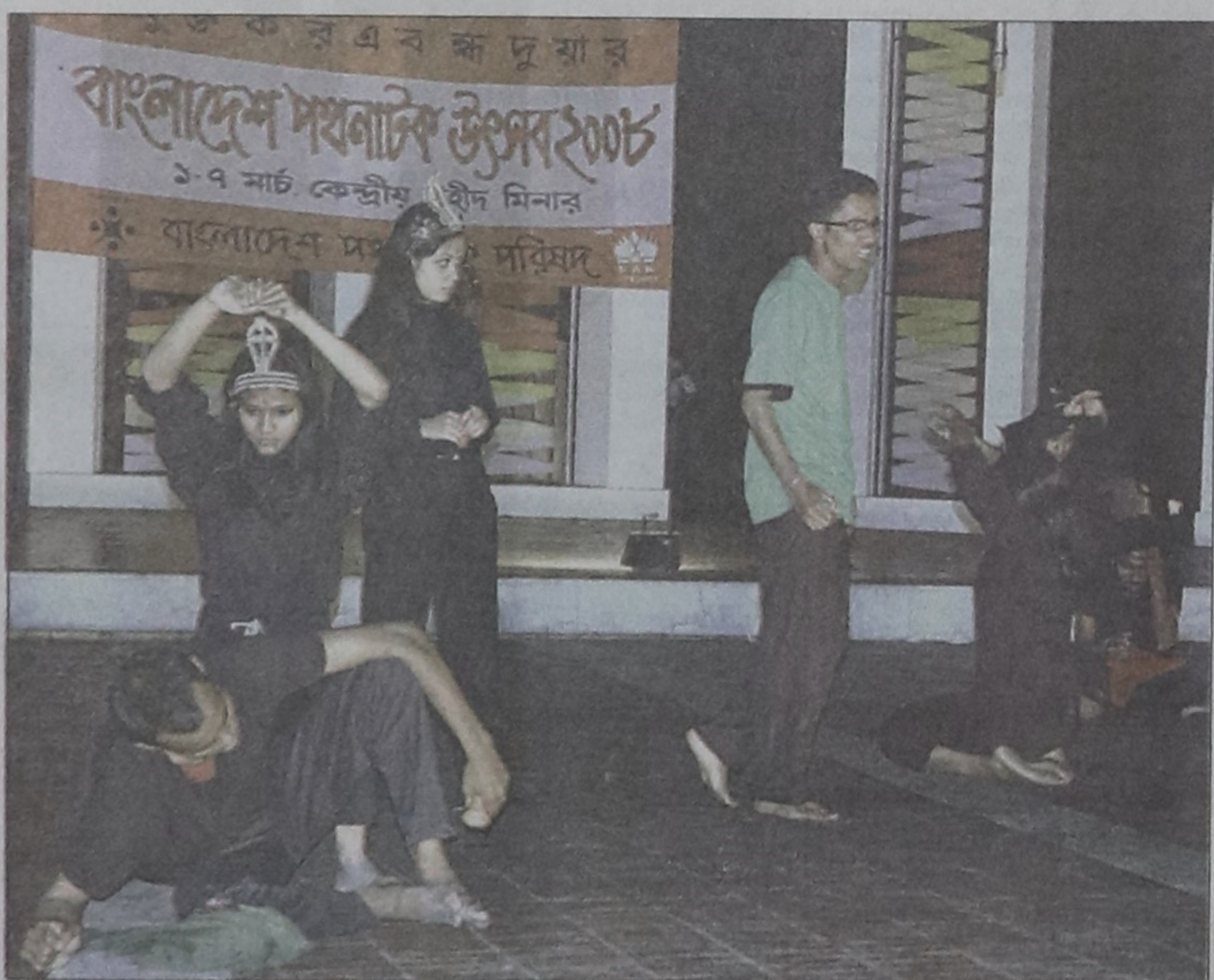
Actors of Moitri Theatre staged the play Kalnagini