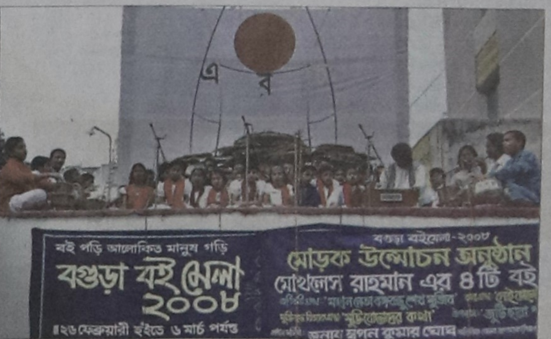
Children perform a group rendition at the Shaheed Khokon Park premises as part of the Bogra Book Festival on March 2. The District Administration, Bogra arranged the festival.