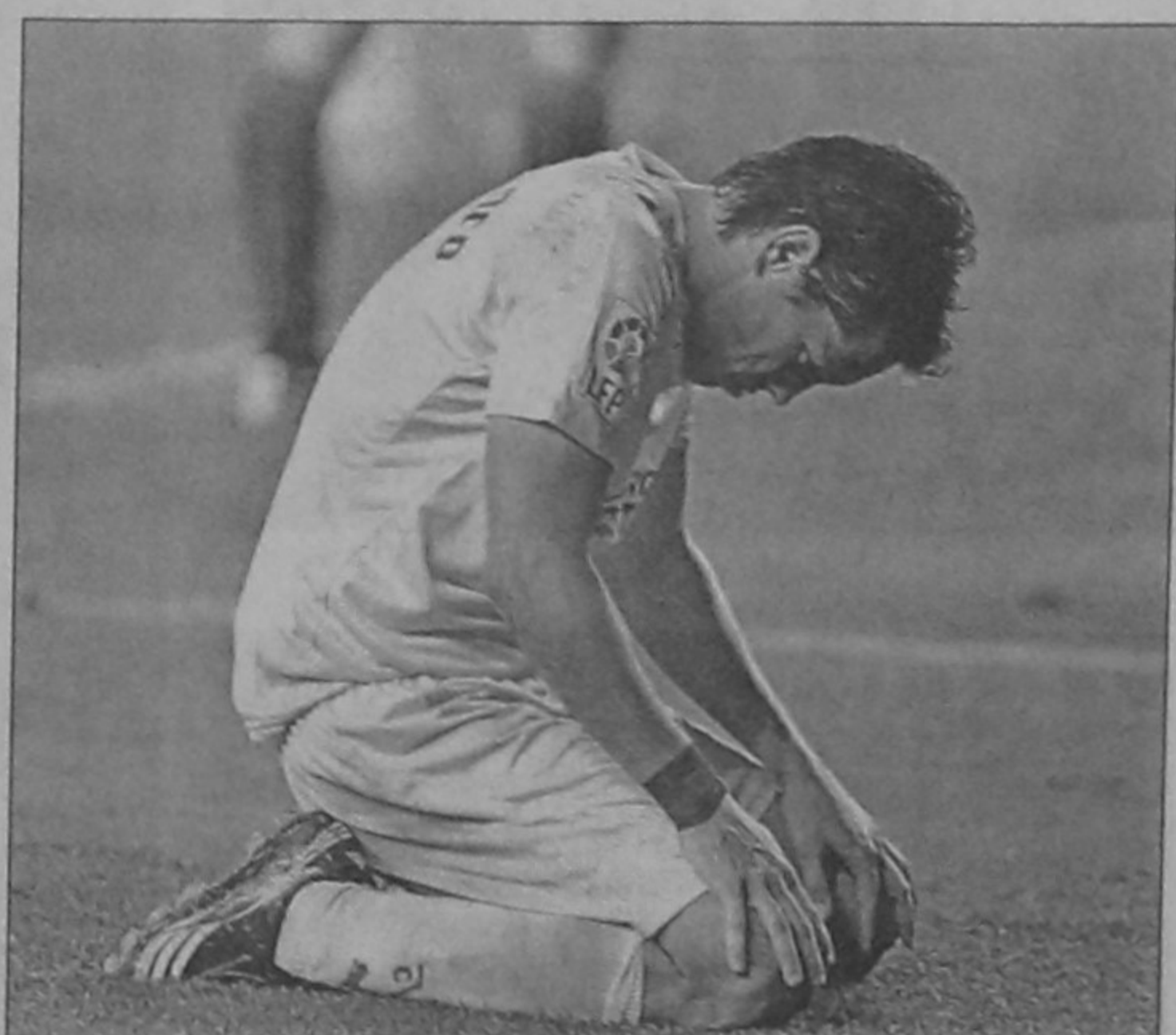
Villarreal striker Guillermo Franco is upset after missing another chance in their goalless draw against Primera Liga rivals Osasuna at the El Madrigal on Sunday.