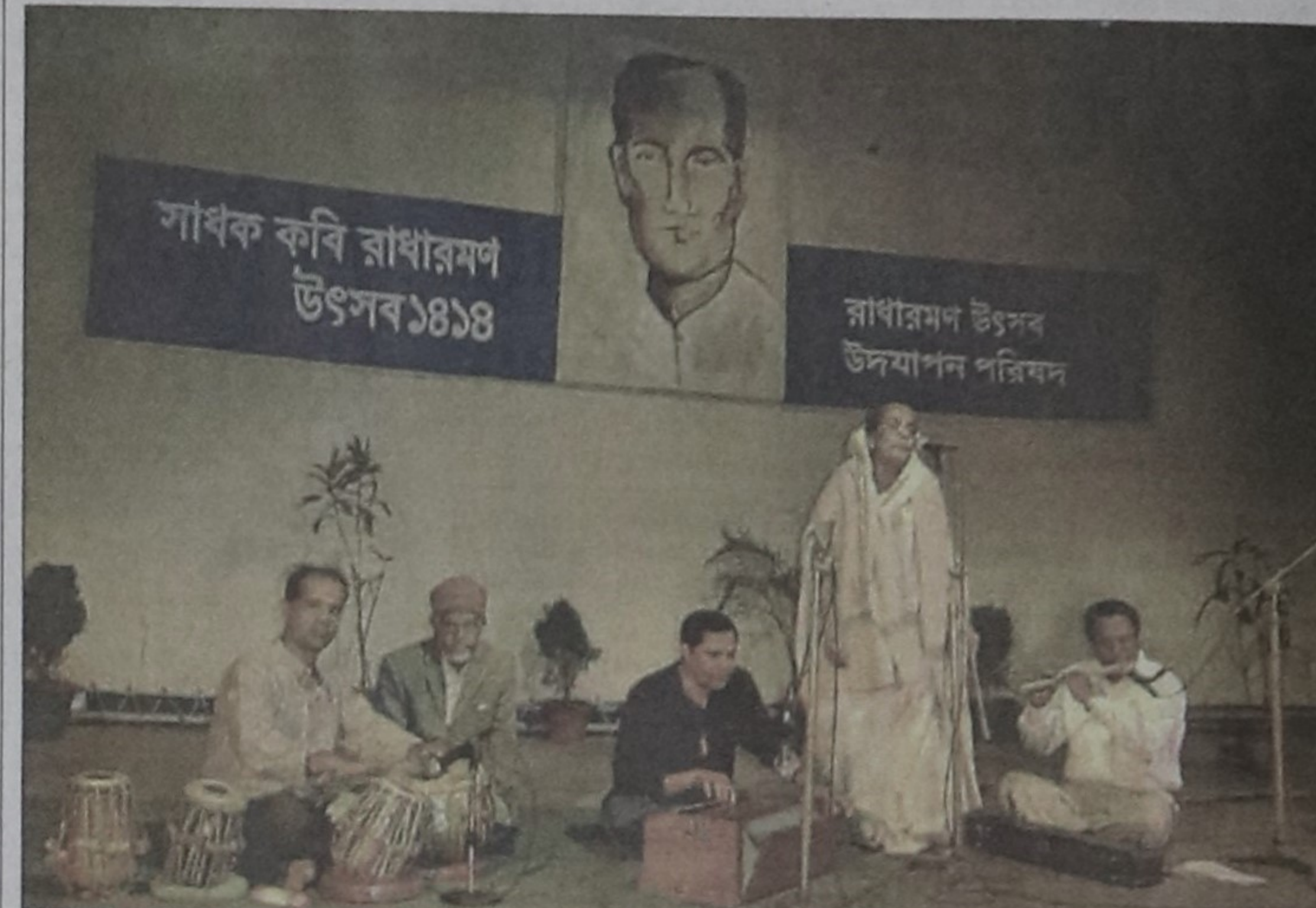
Artistes perform at the Radha Raman Utshab