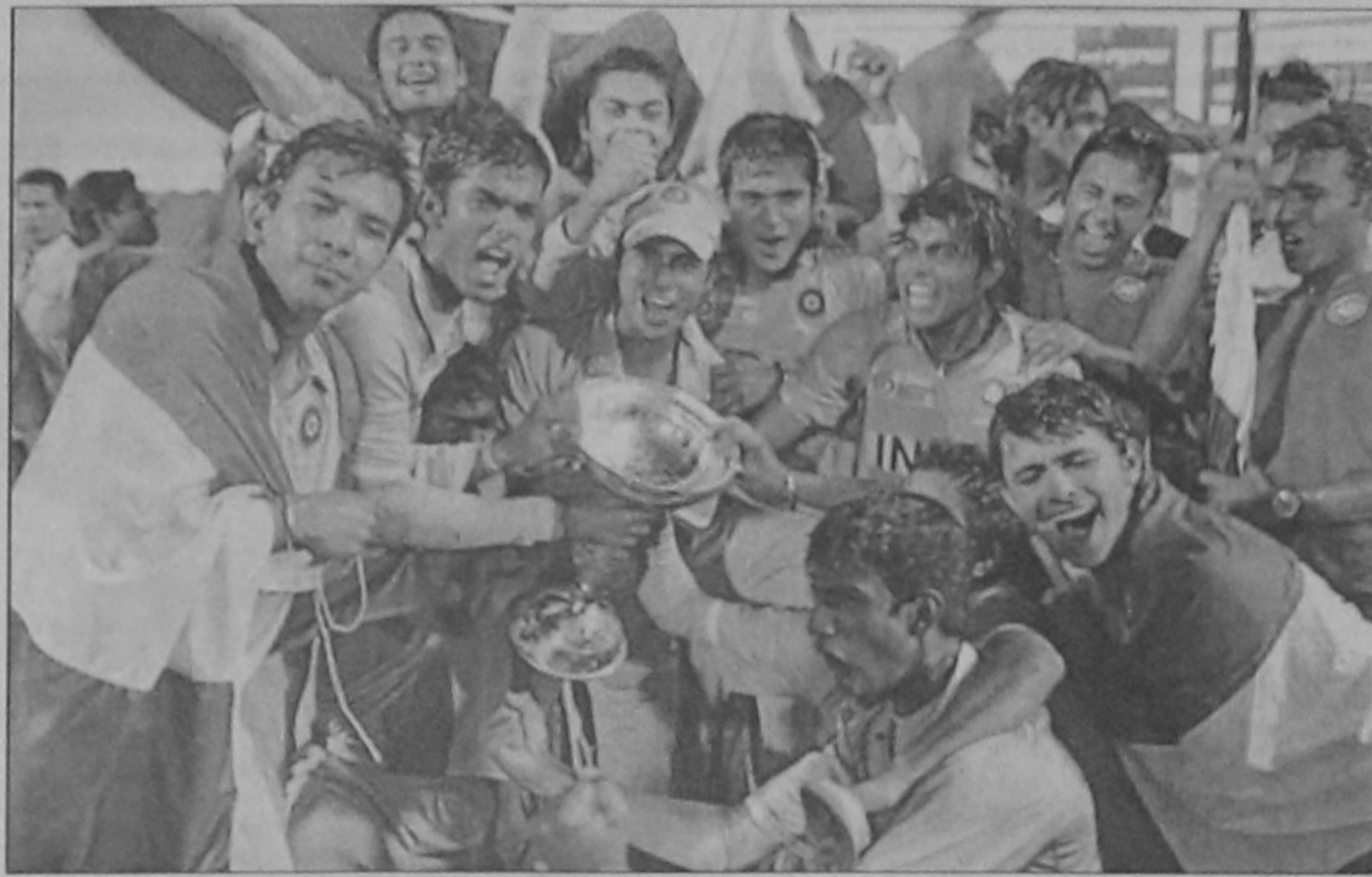
Jubilant members of the Indian team pose with the trophy after beating South Africa in the ICC U-19 World Cup final in Kuala Lumpur yesterday.

Chagot Krita Chakra and Cricket Coaching Centre will meet today.