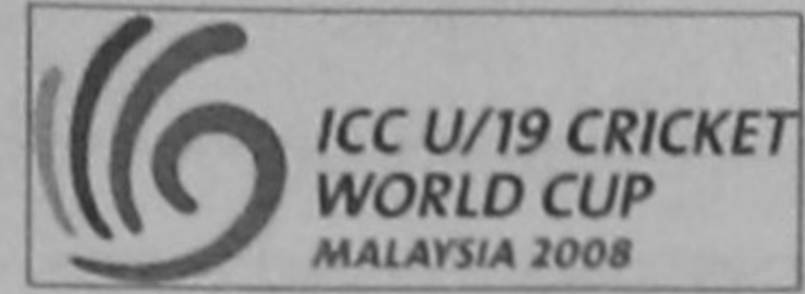
AFP, Kuala Lumpur

Virat Kohli's India juniors won cricket's Under-19 World Cup with a 12-run victory over unlucky South Africa in a rain-hit final here on Sunday.