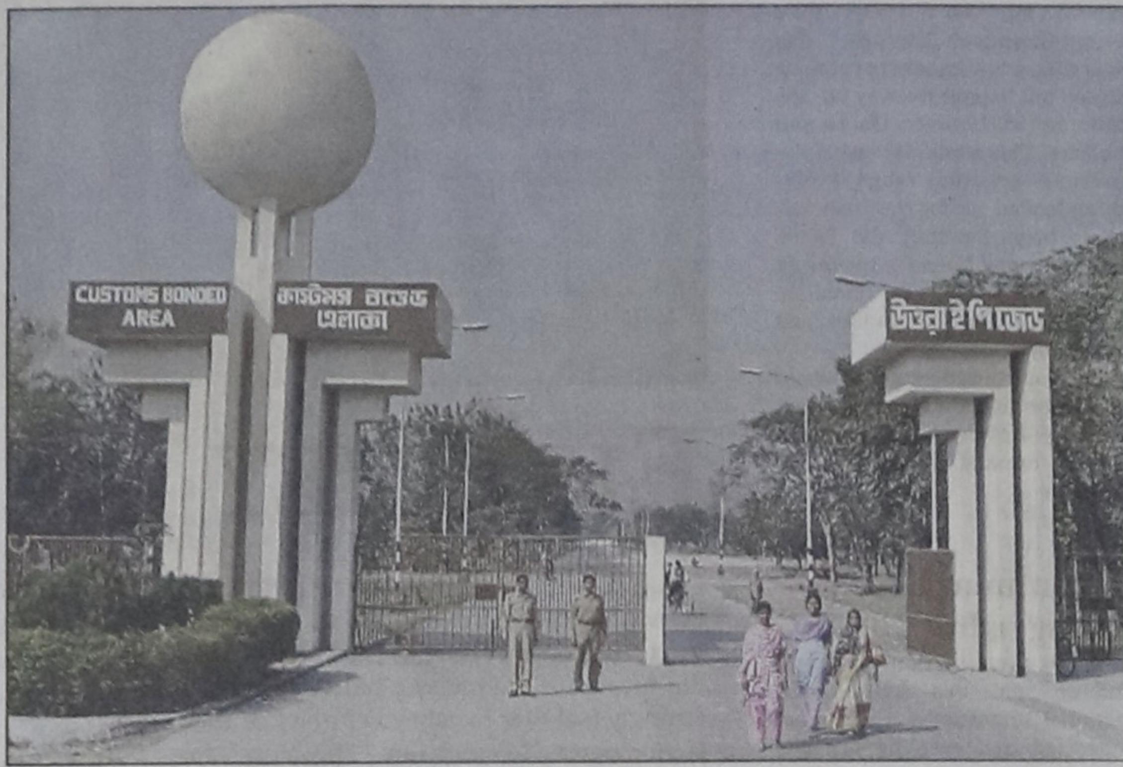
The lone export processing zone in the northern region, Uttara EPZ, is free from hustle and bustle as it has failed to attract investors despite having all infrastructural facilities.

Kapric Electronics Ltd' a joint Indo-Bangla venture producing electrical capacitor provides employment to 200 people. Quest Accessories produce garments accessories and Northern Poly Industries produces polythene and