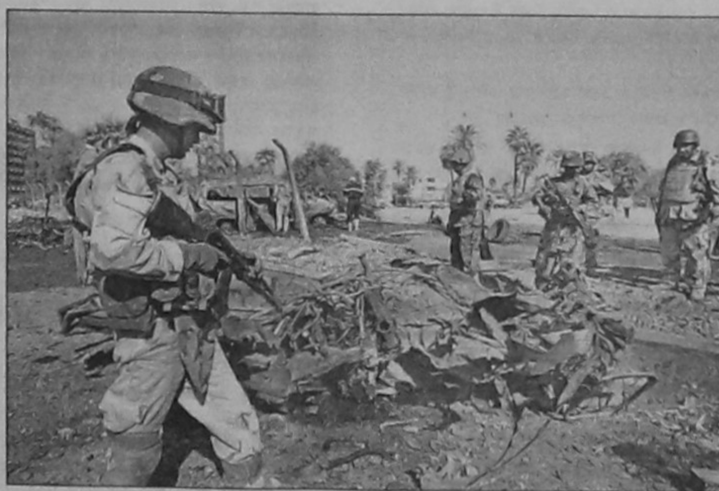
Iraq: $ 3 trillion and counting.

a military loss, but if the second one crashes into the first, it's called something else, and doesn't get tallied in the defense budget. But taxpayers still foot the bill. How expensive is the war from a historical perspective? Iraq is now America's most expensive conflict since World War II. The cost to keep a soldier in Iraq for one year is about $400,000, versus $50,000 in inflation adjusted terms for WWII. This is due in part to the fact that the ratio of injuries to fatalities has grown from 2 to 1, to 15 to 1. It's a miracle of modern medicine. But there is a cost to that. The last of the payments of veteran's benefits from