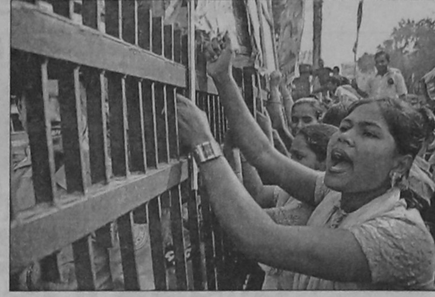
Please don't reduce us to pounding on the gates.

One segment plays wily and quietly succumbs to the situation,