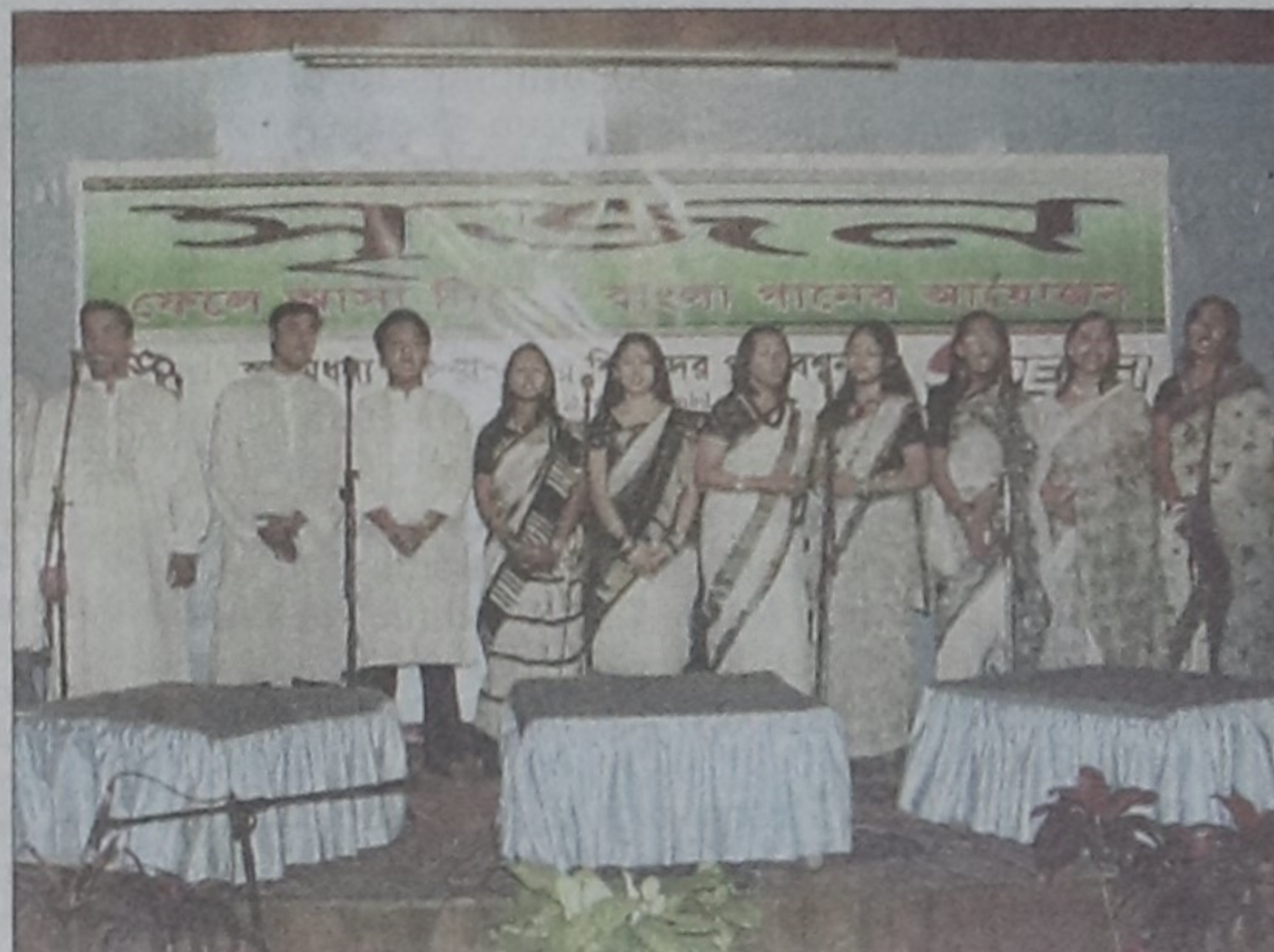
Artistes perform at the musical event by Srijon