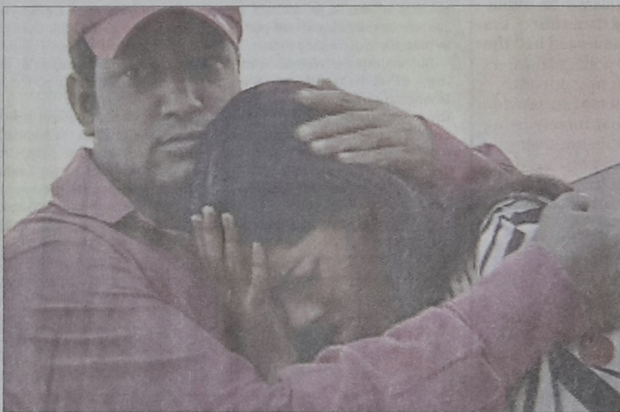
A scene from the serial