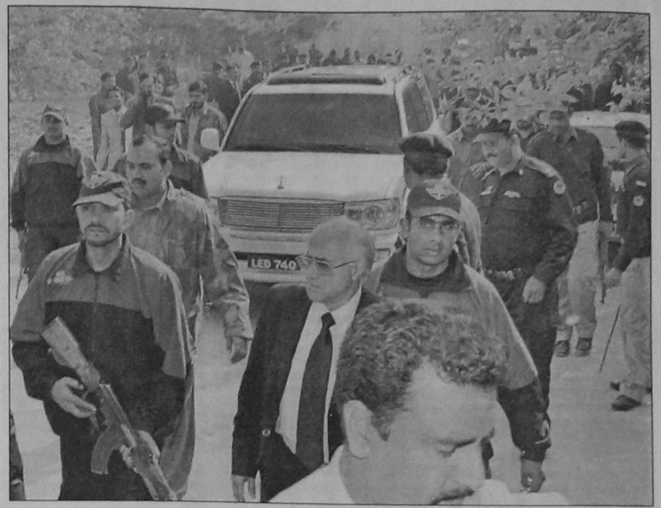
Pakistani policemen escort the vehicle of Shahbaz Sharif, brother of former premier Nawaz Sharif after his appearance in an anti-terrorist court in Lahore yesterday.

A top Pakistani Taliban commander has been formally charged with plotting the murder of former premier Benazir Bhutto and declared an absconder yesterday, police said.