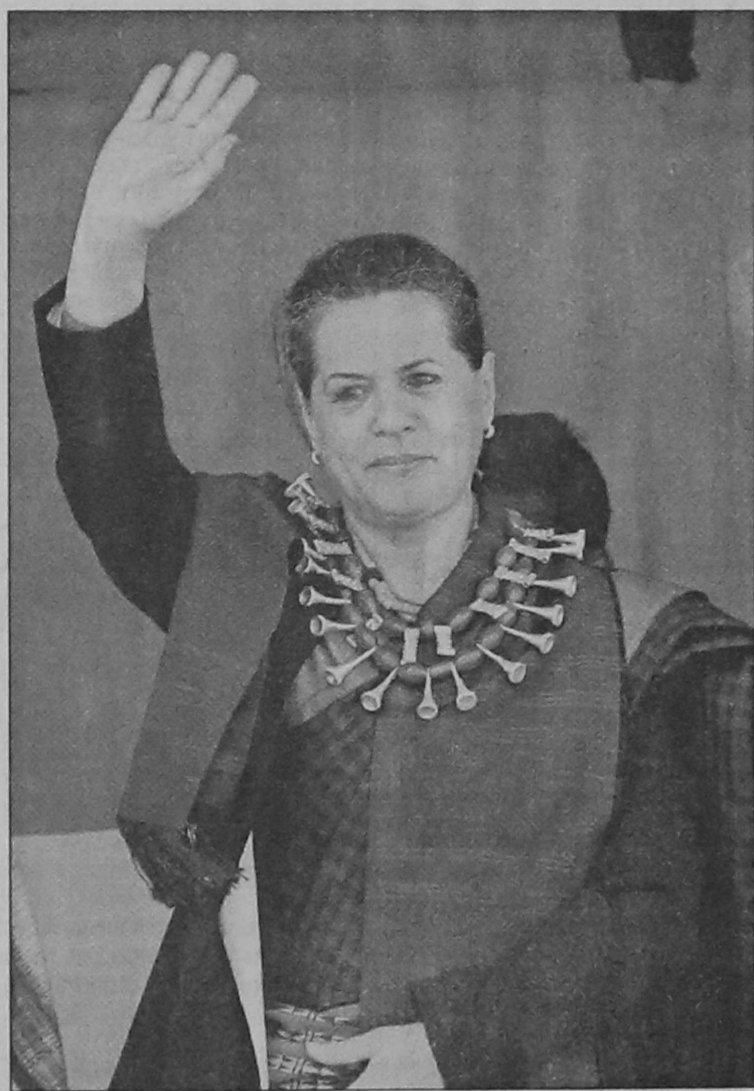
Chairperson of the All India Congress Committee Sonia Gandhi waves to the crowd, dressed in the traditional Naga "Ao Mekhela" and ornaments, during the state assembly election campaign for Congress Party candidates in five constituencies at the Dimapur District Sports Council stadium yesterday.

Taliban militants blew up a telecommunications tower Friday in southern Afghanistan following a warning to phone companies to shut down the towers at night or face attack.