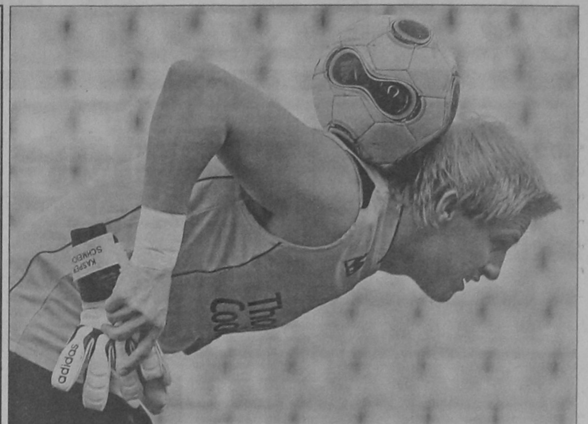
Manchester City goalkeeper Kasper Schmeichel plays with the ball during a football clinic at the Rajamankala stadium in Bangkok on Friday.

The official said he confronted the man, who said he was giving commentary to his son, and told him to hang up.