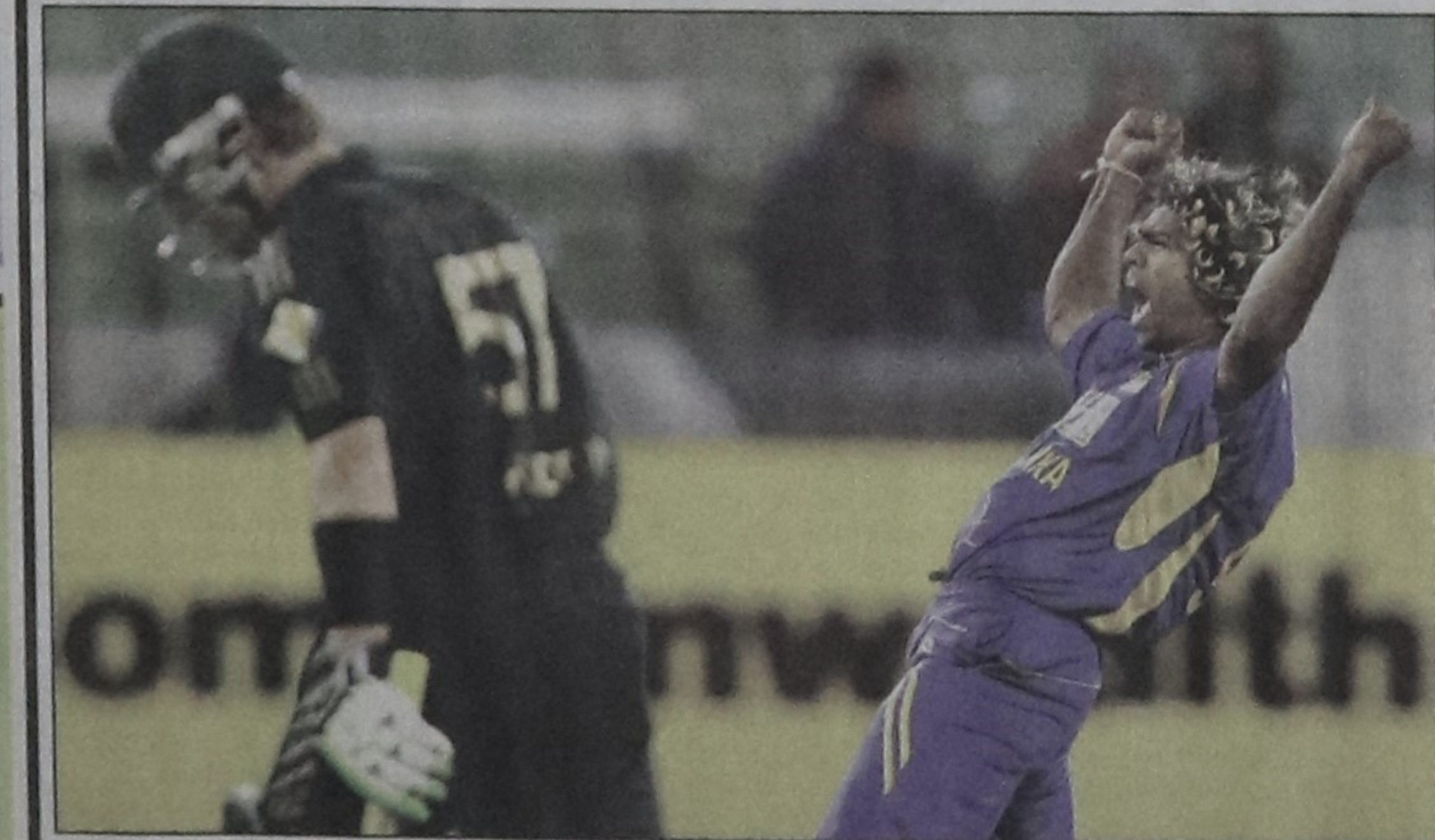
SOMETHING TO TAKE HOME: Sri Lanka paceman Lasith Malinga (R) is in seventh heaven after getting rid of Australian batsman Brad Haddin during their CB Series match at the Melbourne Cricket Ground yesterday.