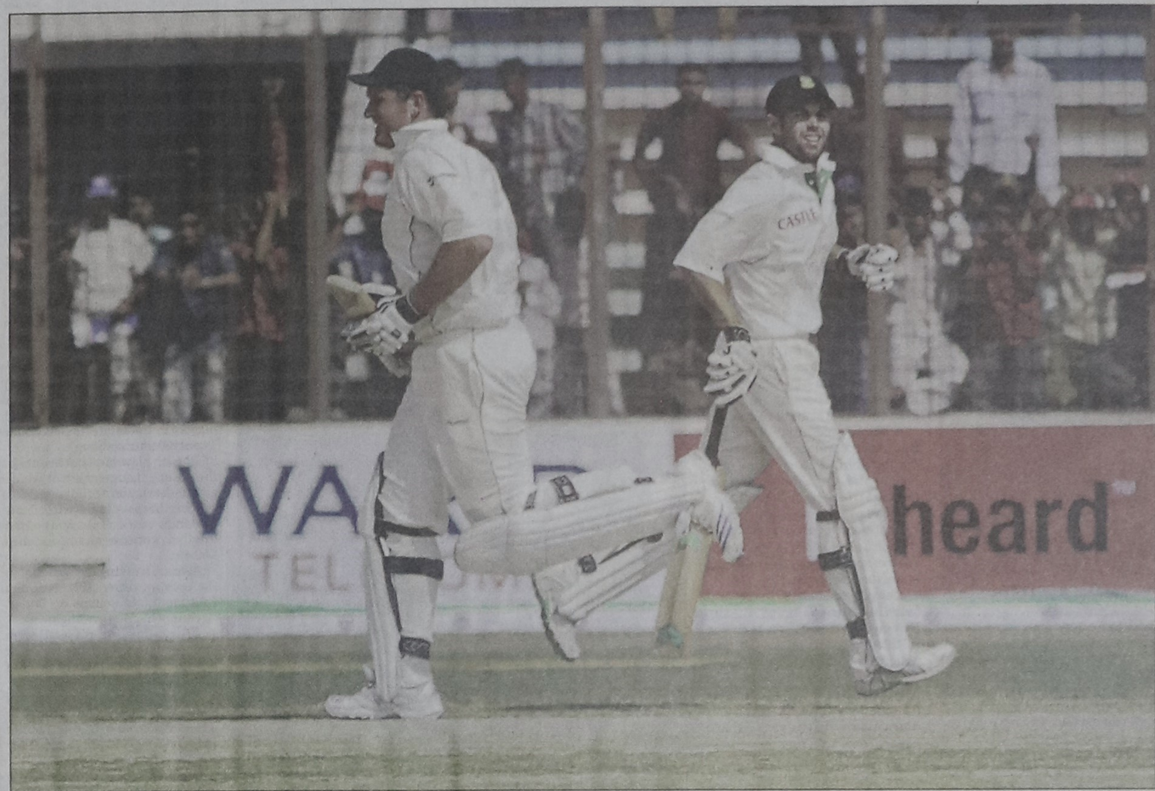
AN ABJECT LESSON: South Africa captain Graeme Smith (L) and his opening partner Neil McKenzie take a single during their mammoth 405-run unbroken stand on the first day of the second Test against Bangladesh at the Chittagong Divisional Stadium yesterday.

"It's always a great experience to bat with Graeme because you will never be under pressure. I never thought that I was struggling in any stage as the scoreboard kept ticking due to Graeme's batting," said the right-hander, who overcame his seven-year itch of getting a Test hundred. He ended his agony by