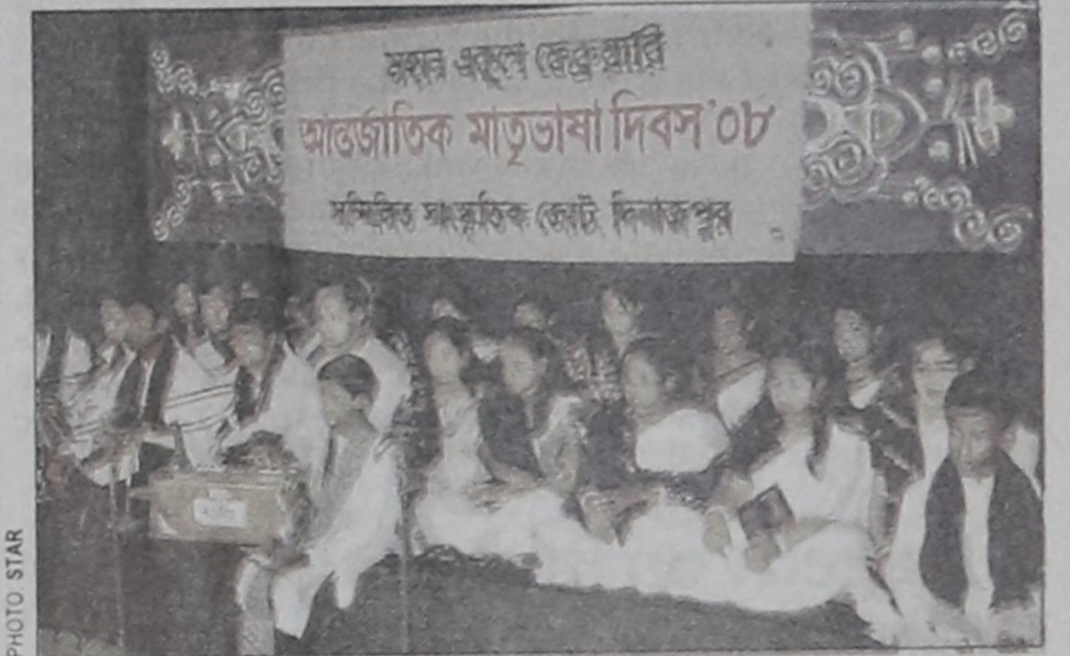
Artiste perform at the programme arranged by Sannilito Sanskritik Jote, Dinajpur

The cultural programme pulled in a huge crowd everyday. At least 20 cultural organisations of Dinajpur including Dinajpur Shilpakala Academy, Udichi, Monimela and Bhairabi participated at the weeklong event.