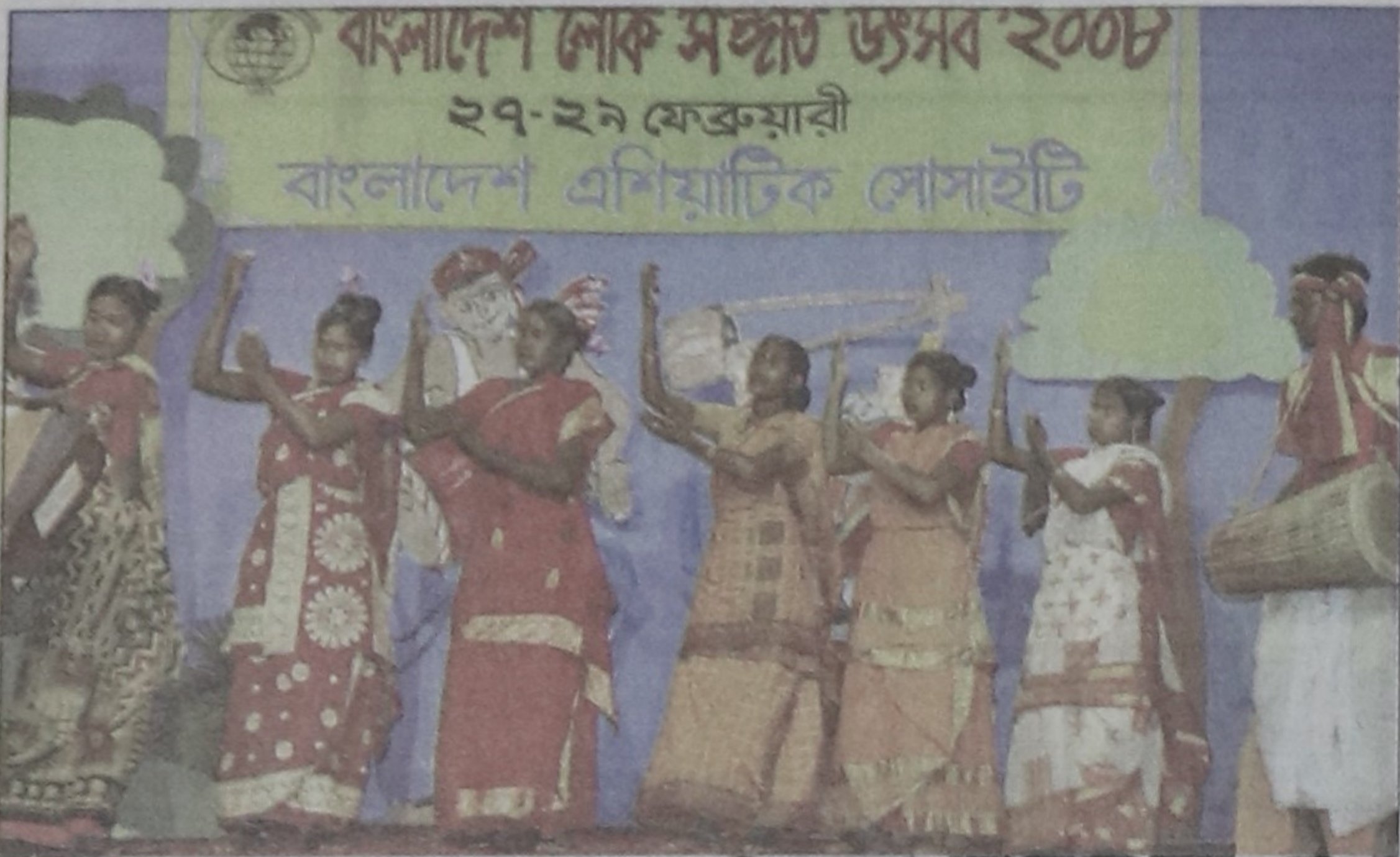
Artists present an indigenous art form at the folk music festival

Eleven troupes perform on the opening day