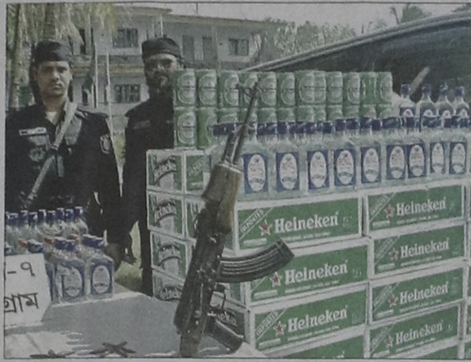
Members of Rapid Action Battalion (Rab) recovered one AK-47 rifle and 16 bullets from Noapara village in Raozan and seized a huge number of beer cans from near the St Martin's Hotel at Agrabad in Chittagong city yesterday.

BDB has already held meetings with Jatiya Samajtantrik Dal (JSD-Inu) and Workers Party of Bangladesh at KC Memorial Clinic at Baridhara in the city recently.