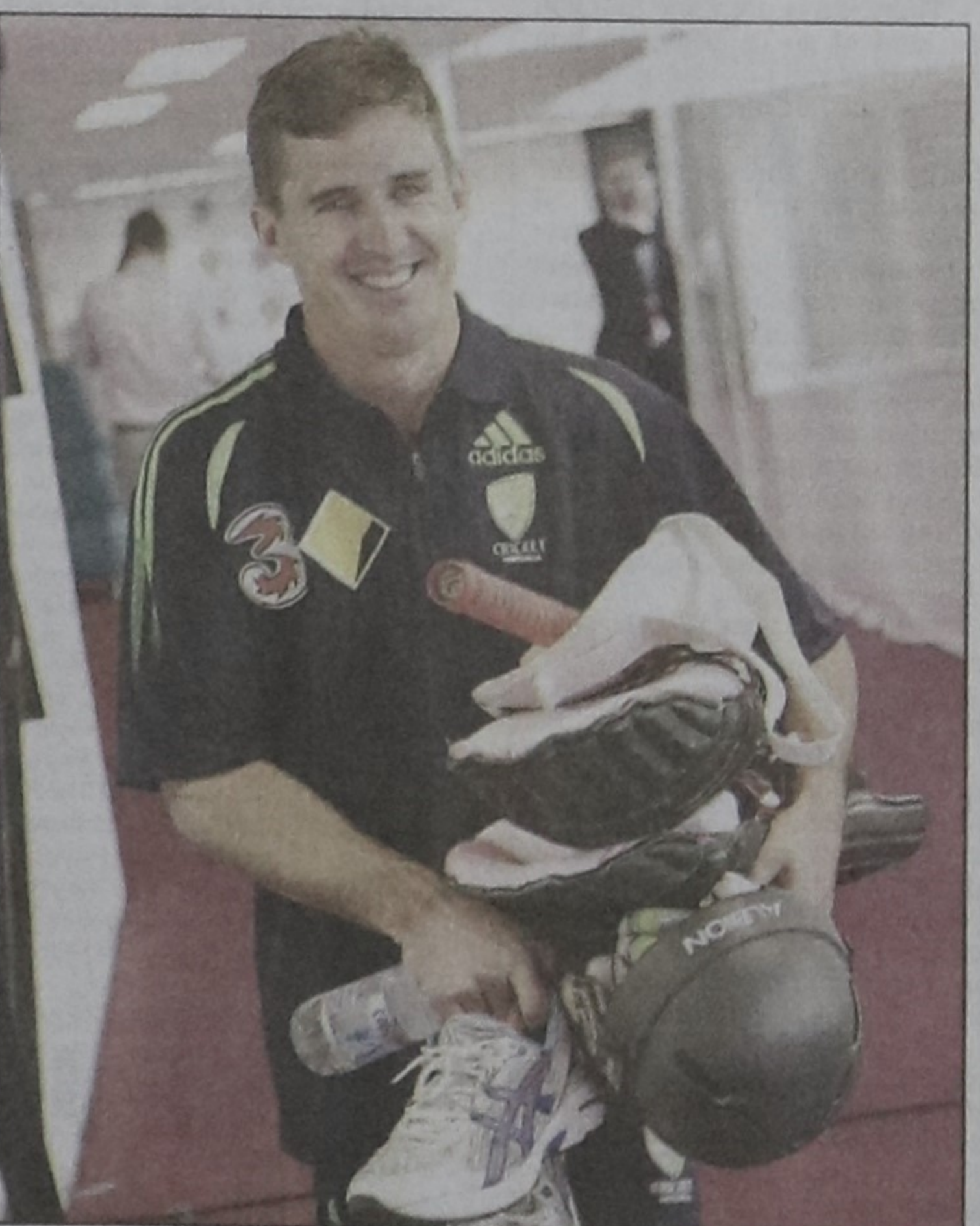
Australian spinner Brad Hogg prepares for a practice session after announcing his retirement from international cricket during a press conference in Melbourne yesterday.