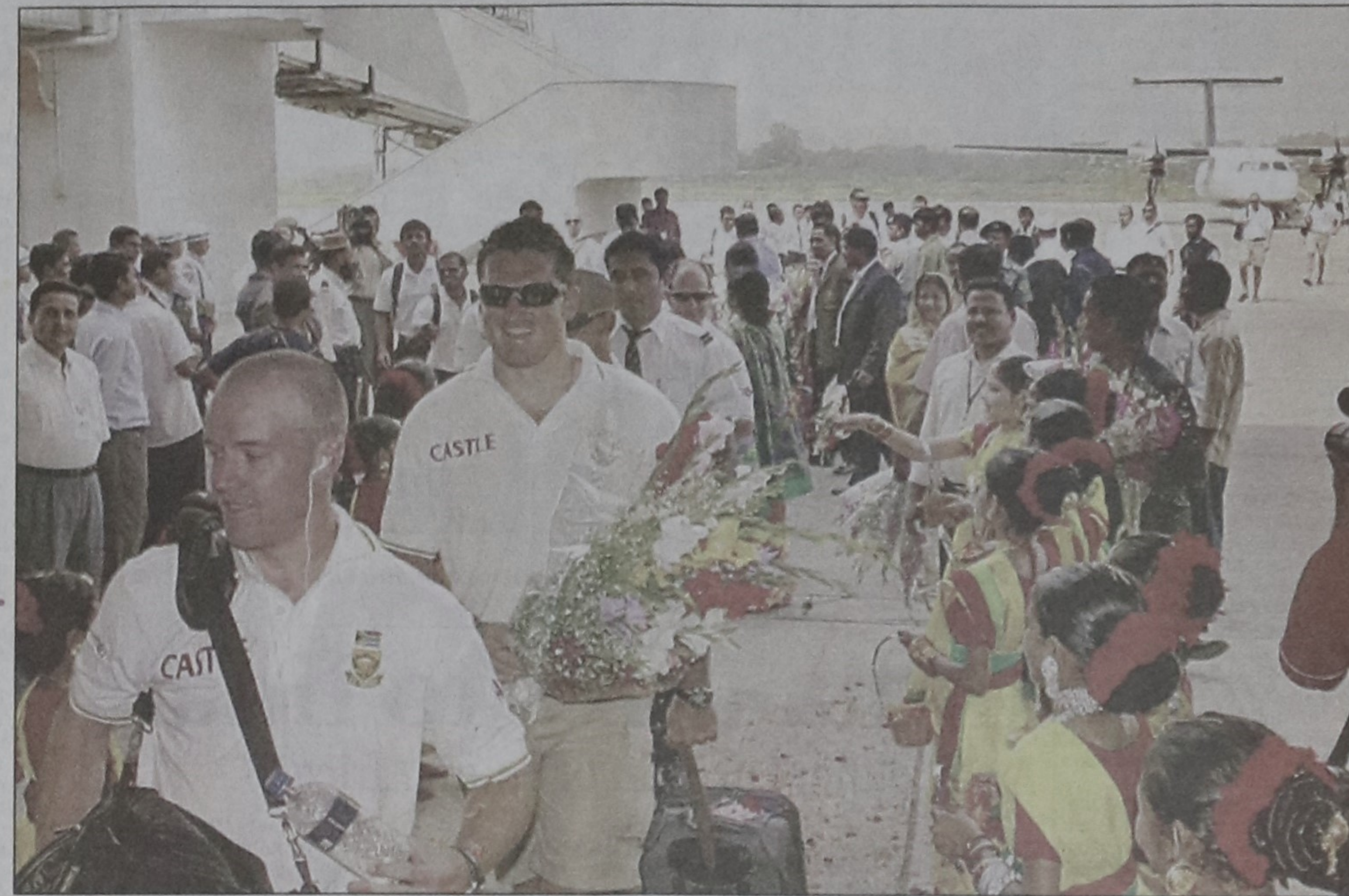
Children, attired in colourful dresses and with baskets of petals in hand, greet the South African players on their arrival at the Shah Amanat International Airport in Chittagong yesterday. The Proteas are in the port city to play the second Test which starts Friday.