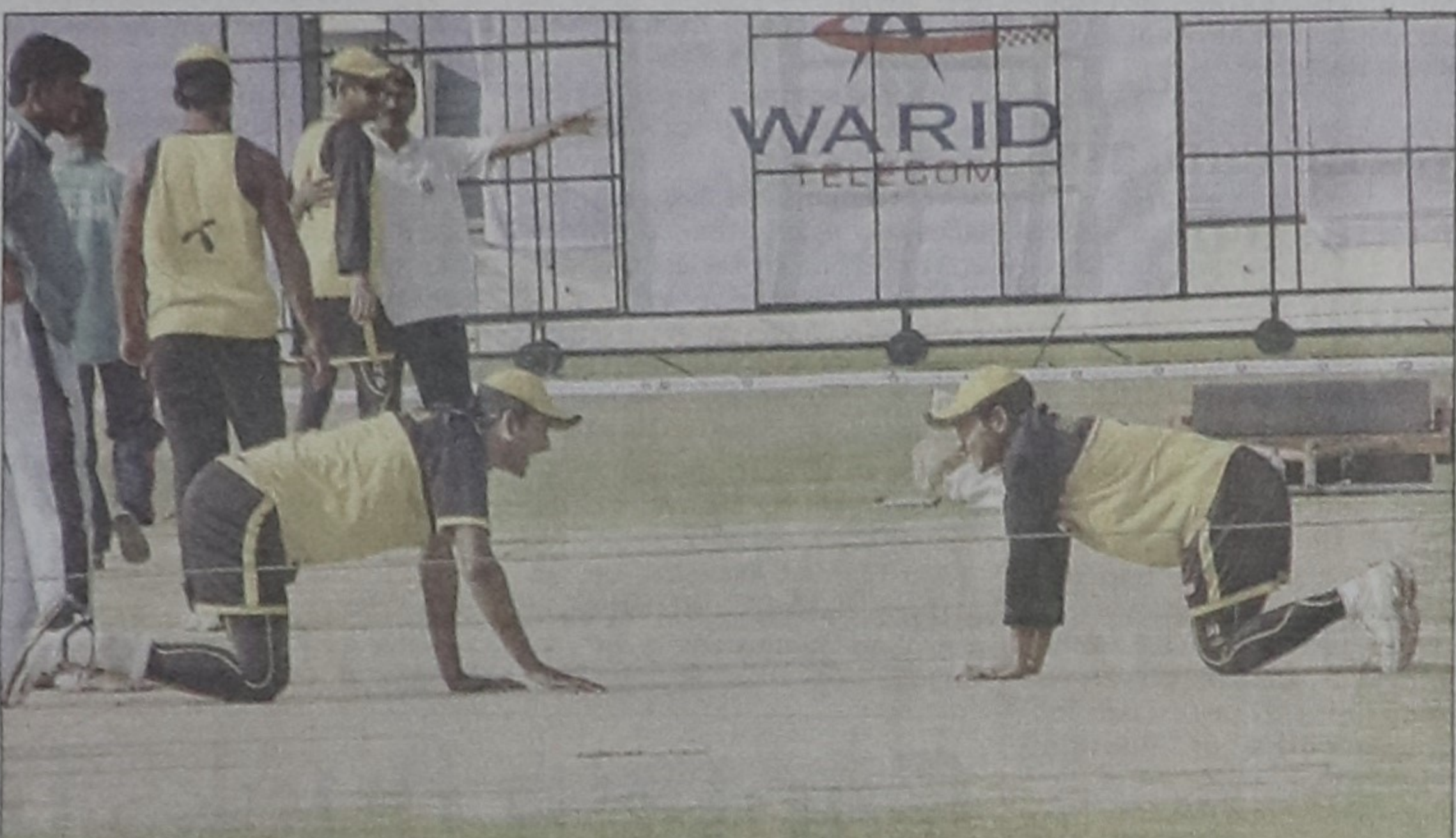
Young Bangladesh opener Tamim Iqbal (L) and wicketkeeper Mushfiqur Rahim are all smiles after giving a close knock at the wicket of the Chittagong Divisional Stadium yesterday.

Bangladesh also scored another 300-plus figure at the venue against Australia and the positive of this match was that that score (304 all out) came in the second innings where Shahriar Nafees (79) and Rafique (53-ball 65 with two fours and six sixes) shone.