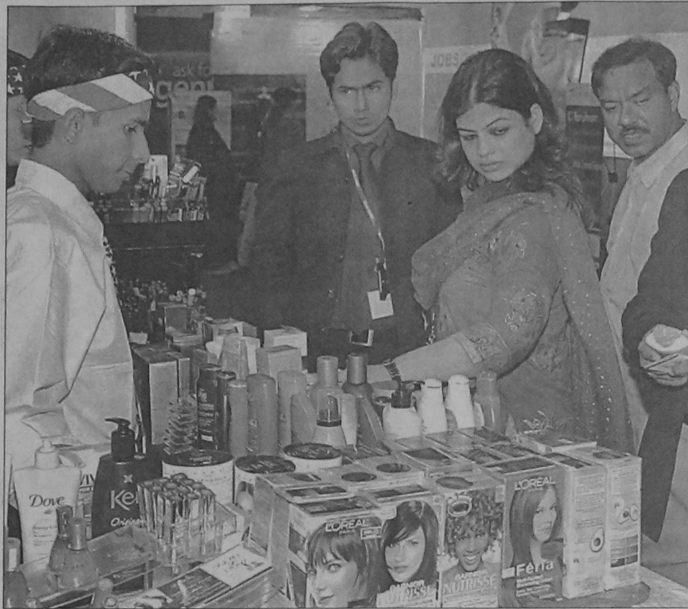
Visitors are seen at a cosmetics stall at the US Trade Show-2008 that began at Dhaka Sheraton Hotel yesterday.

He said Bangladesh exported to US products worth US$12.178 million and import products worth $17.157 million in the 2007 fiscal.