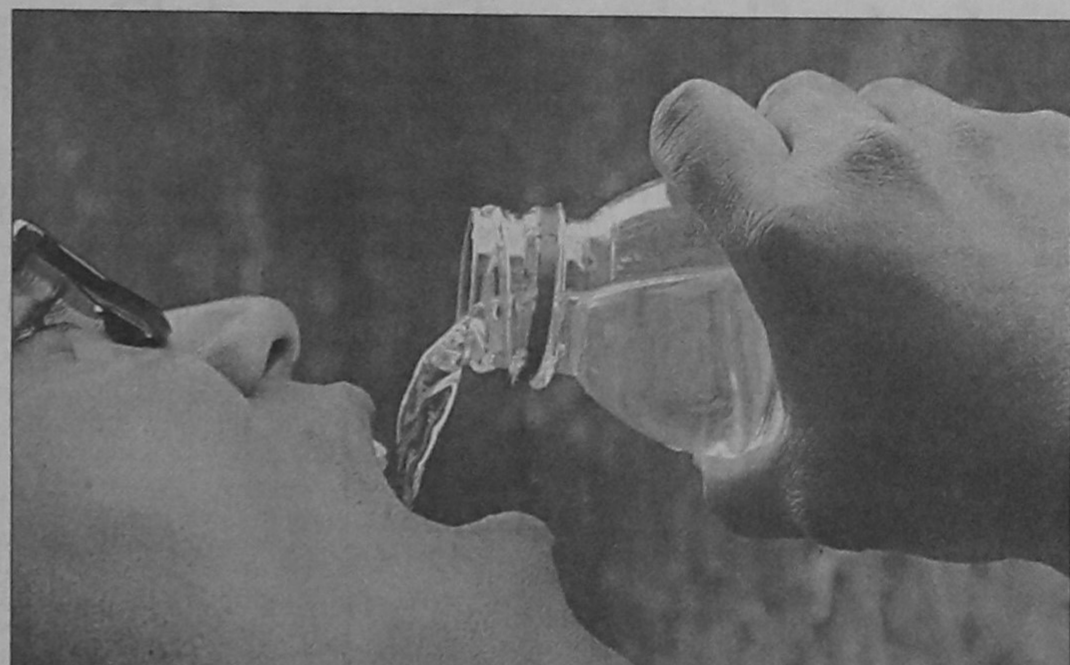
The photo taken yesterday in the capital's Karwan Bazar area shows a consumer drinking bottled water. Increased mobility of people and mass awareness against water-borne diseases have contributed to a speedy growth of the market.

"Many office goers these days prefer bottled water with