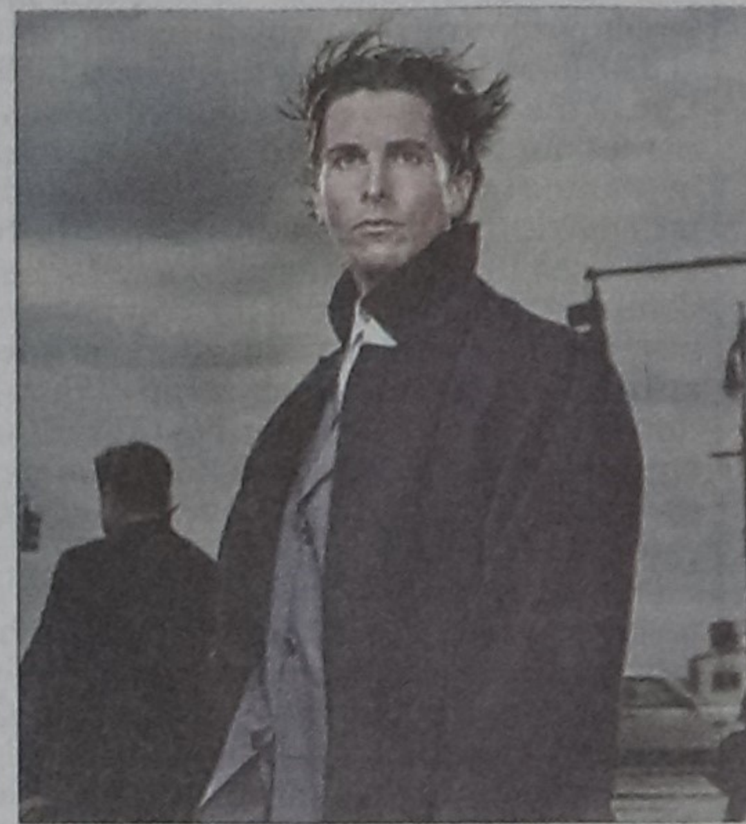
Christian Bale is set to star in Terminator Salvation: The Future Begins