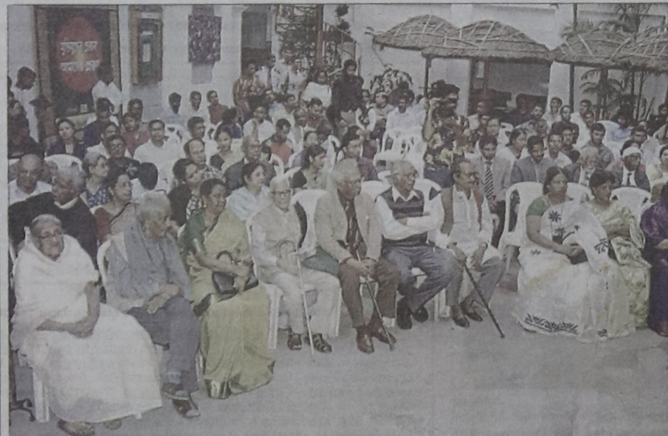
Noted personalities attended the CD and book launch at the Liberation War Museum

The Gunijan web portal is run by a dynamic voluntary team. Anyone can contribute to the Gunijan initiative providing information, photographs, publications and more at this address: www.gunijan.org/Donation/donate.php