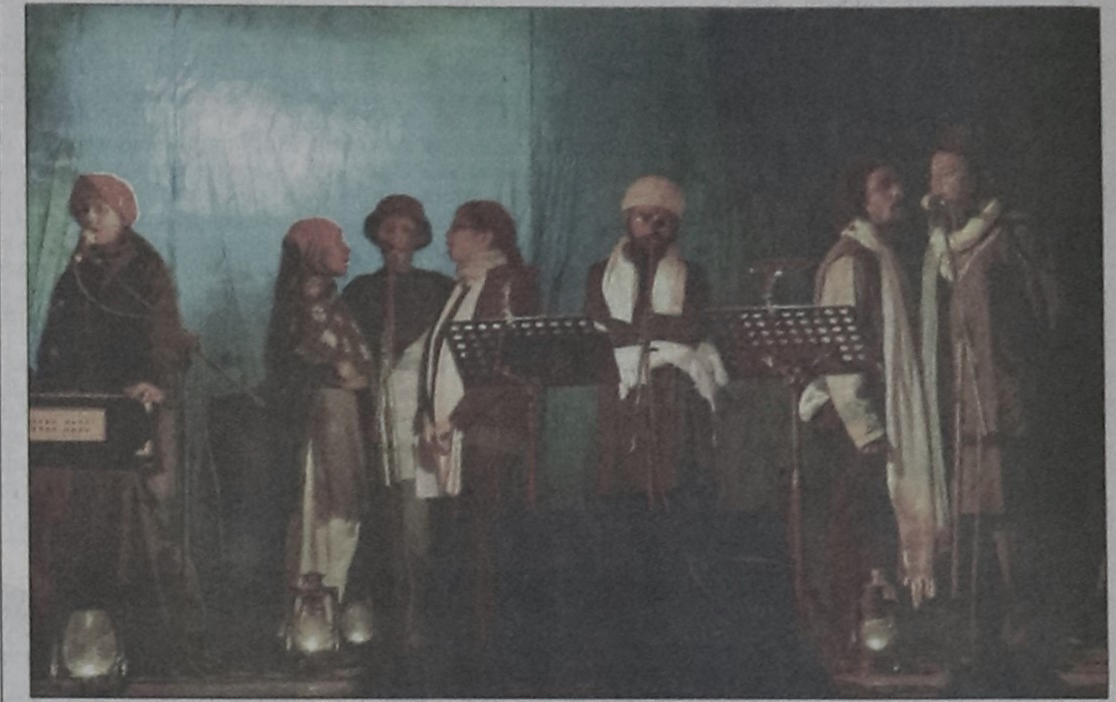
Artists of Prachyanat perform at JU